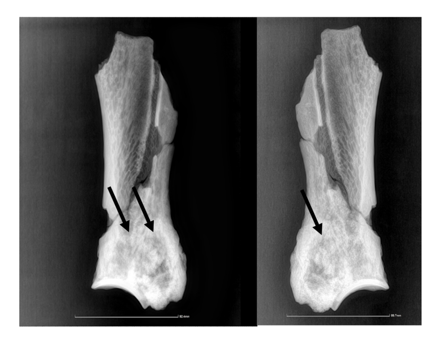
Figure 2. The radiographic images in lateral and medial perspectives. The arrow points to the delimitation line between the newly deposited bone and the compact bone of the lateral scapular surface.

The newly formed bone tissue displays an irregular surface just dorsally (2–3 mm) to the glenoid cavity (Figure 1), all around the neck of the scapula. Consequently, the infraglenoid tubercle and the coracoid process are barely visible, being embedded in the osteophytes/exostoses situated in the neck of the scapula. The osteophytes and exostoses are most likely of cancellous bone, a fact suggested by the X-ray images (Figure 2).