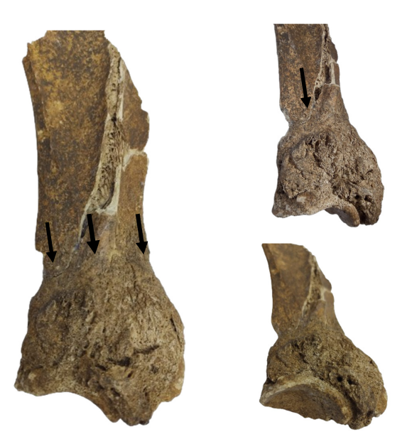
Figure 1. The scapular fragment. The aspect of the lesion onto the lateral surface of the scapular neck. Note the development of osseous tissue and the marking of the suprascapular artery and nerve trajectory (arrow).

The gross features (Figure 1) detected in the distal portion of the scapula (neck of the scapula) include a major hypertrophy of the region due to the formation of an exuberant osseous tissue.