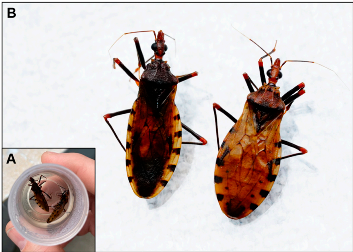
Figure 3. (A) Two adult triatomines were found inside a home in the city of Liborina (Antioquia Department). (B) Both triatomines were identified as adult male Panstrongylus geniculatus using morphologic keys [101]. Trypanosoma cruzi DTU TcI was detected in one of the triatomines via RT-PCR molecular techniques [97].