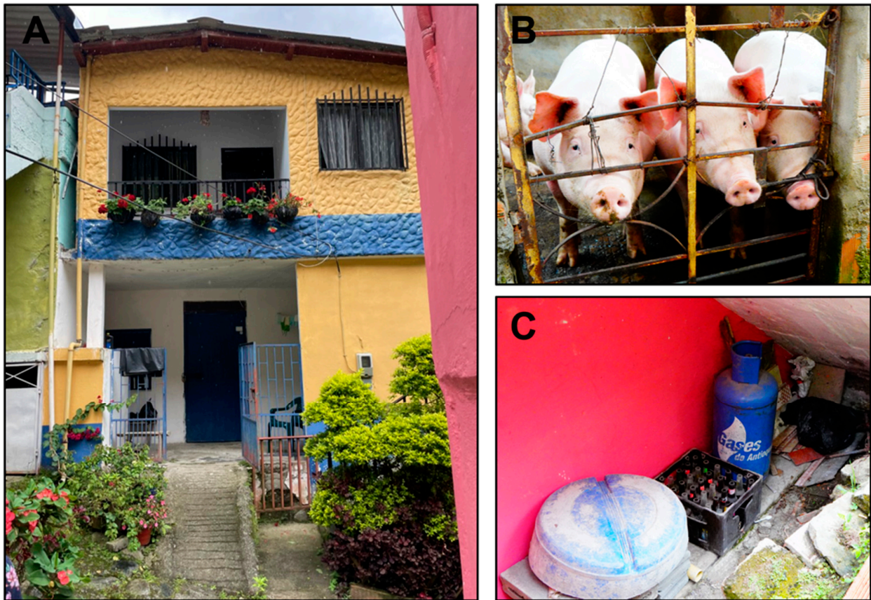
Figure 4. (A) Home in Liborina, Antioquia, Colombia, where several adult Panstrongylus geniculatus triatomines were found by homeowner inside on the second floor. The homeowners commonly left their windows open with no screens, and (B) domesticated pigs were housed below the structure. (C) Debris was located adjacent to the building, where evidence of small rodents could be seen.