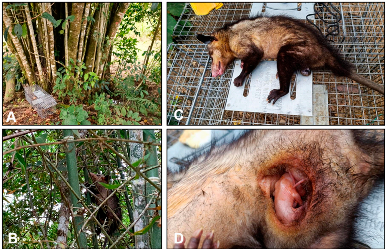
Figure 5. (A) Field trapping for Didelphis marsupialis in Miraflores, Boyacá Department, Colombia, near human dwellings and where suspected oral Chagas disease cases have been isolated. (B) Didelphis marsupialis found resting within canopy in Miraflores. (C) Female Didelphis marsupialis captured and anesthetized for T. cruzi infection testing. (D) Joeys were present in the marsupium, and concerns for vertical transmission of T. cruzi among Didelphis marsupialis are being investigated.