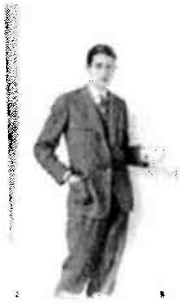
August Sander: High School Student, gelatin silver print, 28.1 x...