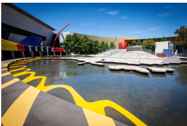
Garden of Australian Dreams