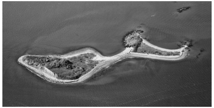
Rainsford Island today. While it is no longer used as a quarantine site, the island is part of Boston Harbor Islands National Recreation Area.