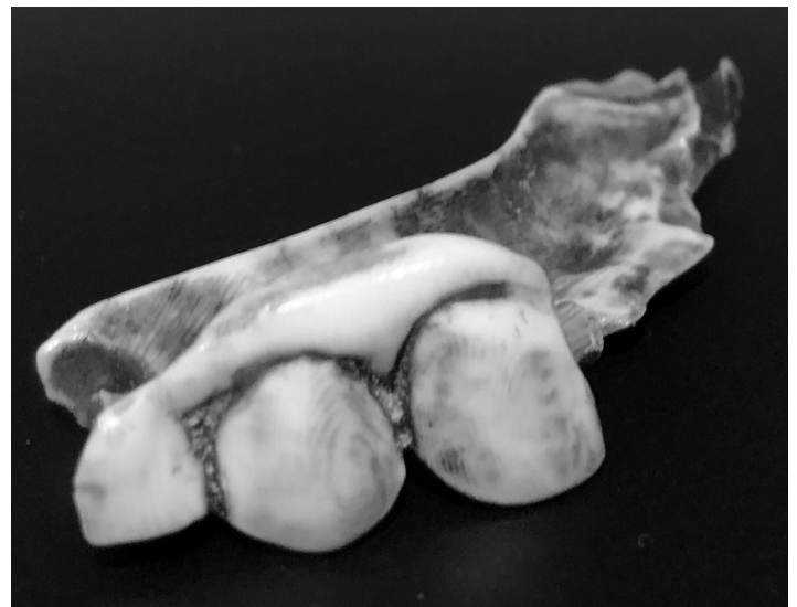
You can see this partial denture on display in our visitor center! Property of the Paul Revere Memorial Association.

Revere's dental practice appears to have been short lived, as he devoted the majority of his time to other business ventures following the Revolution. However, Revere distinguished himself by being one of the first Americans to use dental records