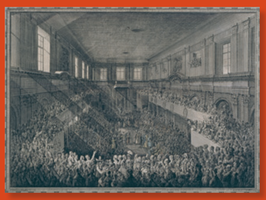
• Adoption of the May 3rd 1791 Constitution, J. P. Norblin, National Library of Poland

• The Sejm (Parliament), which passed the Government Act, has commenced its sessions in a very complicated international situation. Russia, which held actual protectorate over the Polish-Lithuanian Commonwealth, became entangled in wars with Turkey and Sweden. Austria supported Russia against Turkey, and Prussia took a position openly antagonistic to Russia. It seemed to be the only opportunity to regain sovereignty of Poland. Seim managed to form a confederation, the so-called treaty of guarantee was terminated, and following the disbanding of the Perpetual Council, the Sejm took full power in the country, commencing an attempt to reform the system. Enactment of the Government Act was the culmination point of those activities. Russia has never accepted losing its influence in Poland, and after signing peace treaties with Turkey and Sweden, commenced military actions against the Commonwealth. Those soon led to capitulation of the king and power was taken over by opponents of the May 3rd 1791 Constitution, who were united in a confederation formed under the influence of Russia, called Targowica Confederation after the town where it was formally established.