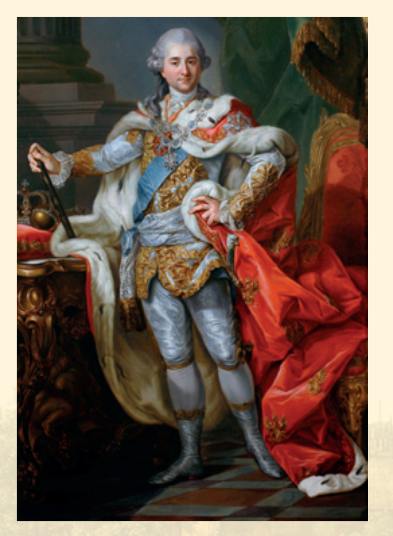
Portrait of Stanisław August Poniatowski in coronation robes, M. Bacciarelli, Royal Castle in Warsaw

• The Great Sejm, which managed to form a confederation in order to avoid disruption, was most of all result of efforts and ideas of Stanisław August. The King himself with Ignacy Potocki and Hugo Kołłątaj were the main authors of the Government Act.