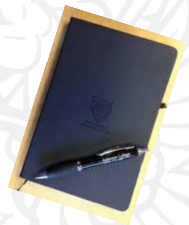
Black lined notebook and pen: £8.50