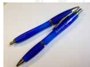
Blue ballpoint pen: £1