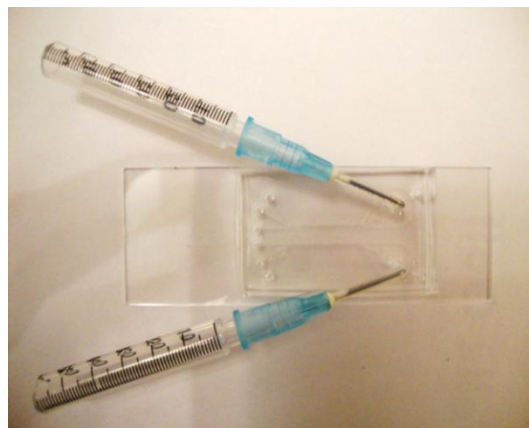
Suppl. Fig. 1: Horizontal reservoirs used for the perfusion of the microfluidic platforms. Inlet 2, outlet 1 and outlet 3 were plugged using pipette-tip plugs, whereas Inlet 1 was connected to the horizontal syringe reservoir and outlet 2 was connected to the peristaltic pump pulling off the depleted cell culture medium.

Microfluidic systems differ considerably from conventional cell culture flasks. A conspicuous example is the very small amount of cell culture medium needed to submerge the cells. Consequently the amount of nutrients and oxygen within the culture medium is rapidly depleted and needs to be replaced frequently. To tackle this demand the development of autonomous systems continuously exchanging the depleted medium is unavailable. Therefore, we coupled our microfluidic platform to a peristaltic pump using 0.6mm (inner diameter) Tygon tubings and to a horizontal syringe reservoir containing an adequate amount of fresh medium (Suppl. Fig. 1).