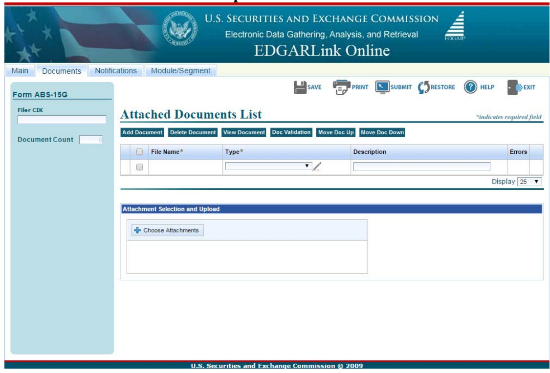
Figure 10: Form ABS-15G Attached Document List Page with Attachment Selection and Upload Window