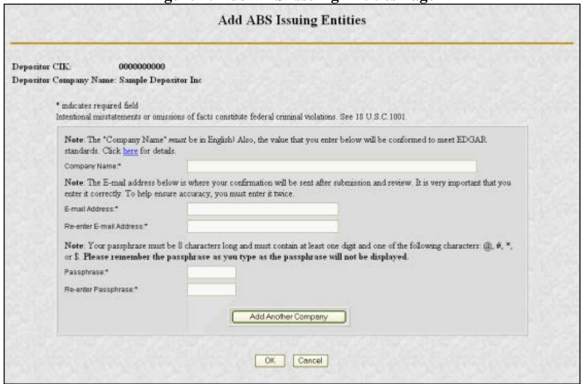
Figure 2: Request ABS Issuing Entities Creation Information Page