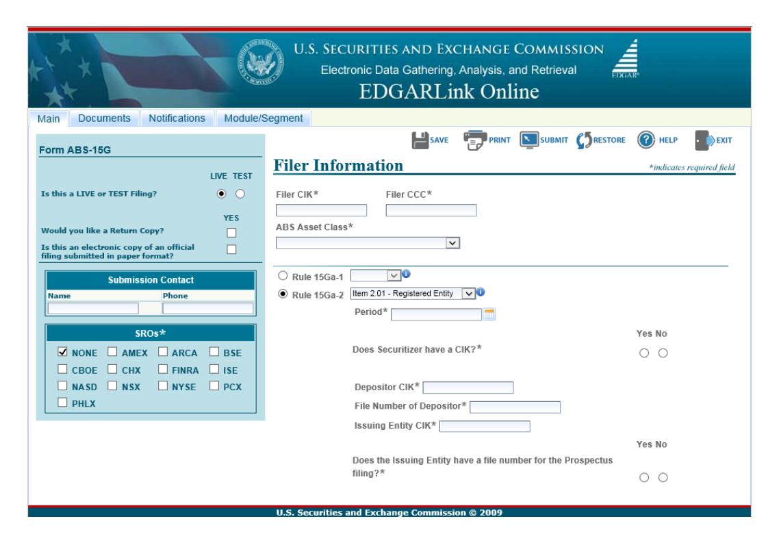
Figure 8.2: Form ABS-15G Filer Information Page (Unregistered Entity)