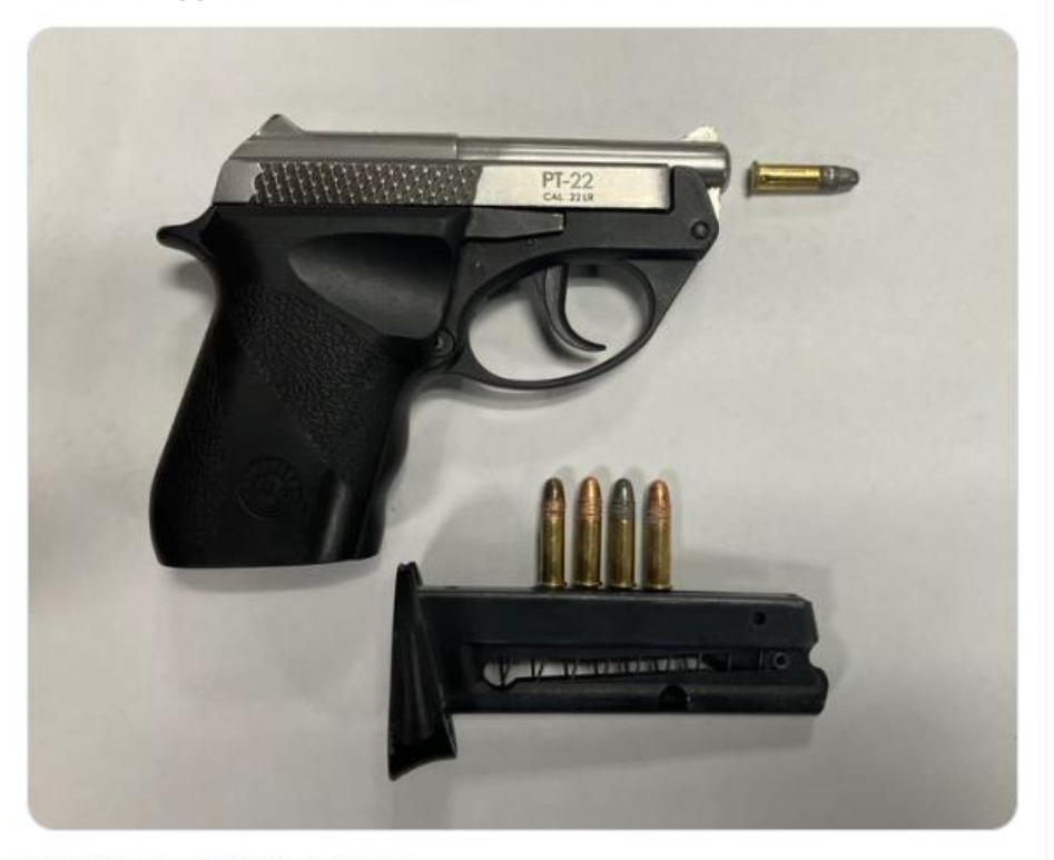
11:11 PM · Mar 17, 2023 · 2,462 Views

Little did he know that officers from our Field Training Unit were right around the corner. After 3 shots rang out and a Shotspotter Activation, our officers identified the shooter and went on a brief foot pursuit. The male was apprehended and this small firearm was recovered!