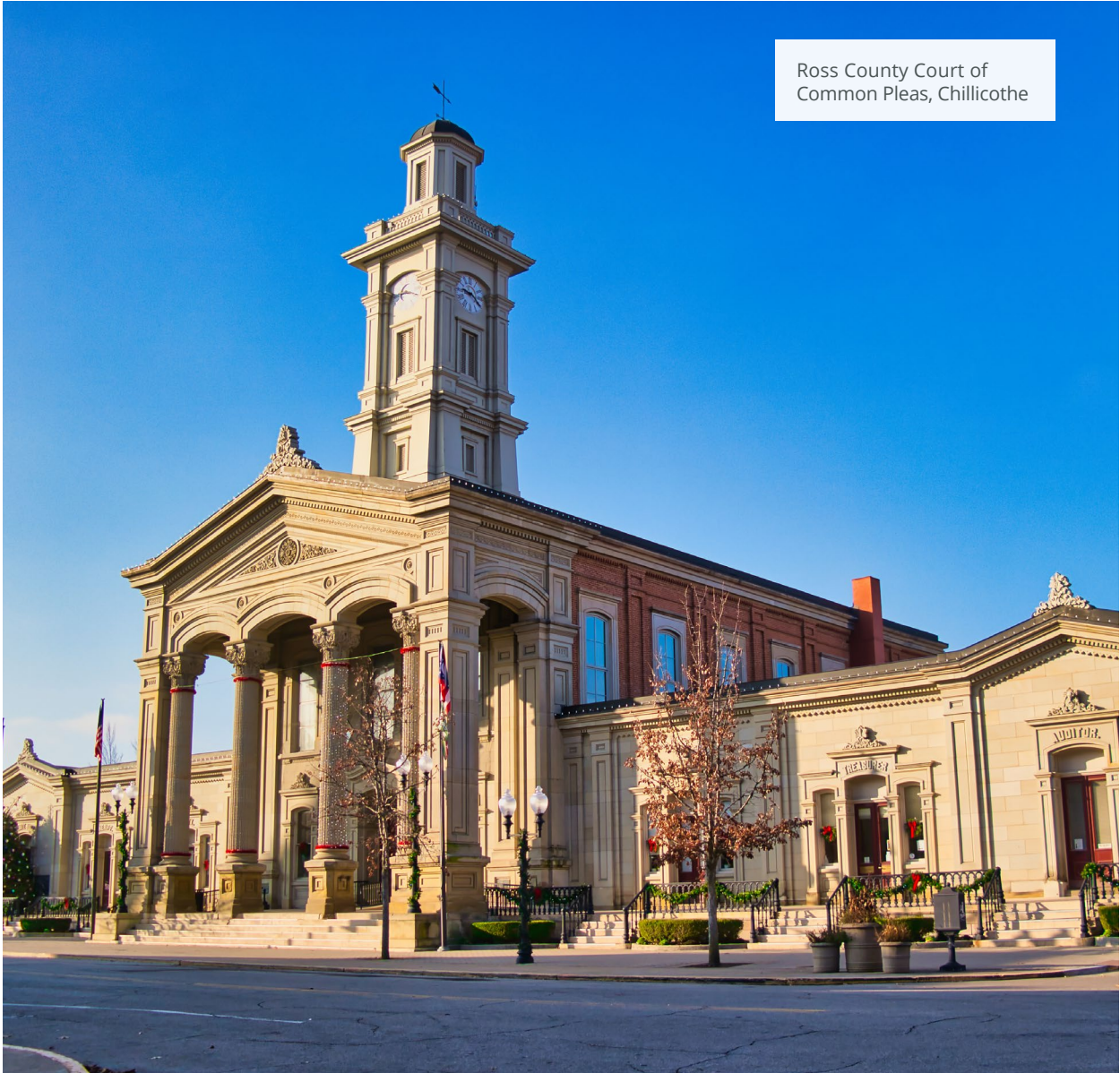
Ross County Court of Common Pleas, Chillicothe