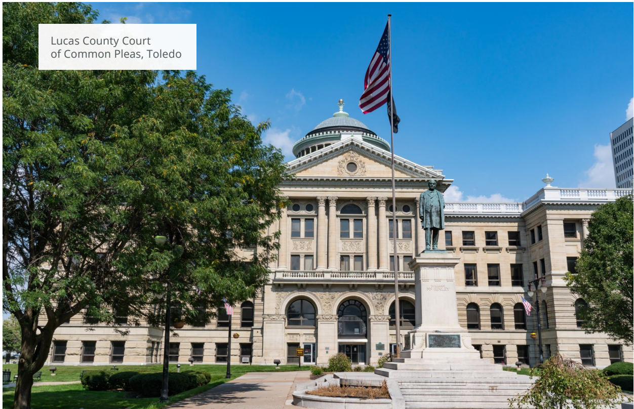
Lucas County Court of Common Pleas, Toledo