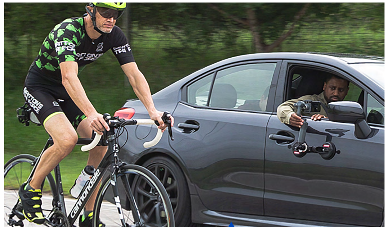
On-road analysis of rider biomechanics

SwRI's markerless technology is the result of extensive research, development, and expertise in complex biomechanical modeling, machine learning, and sensor fusion techniques. By employing an athlete-specific biomechanical model, this markerless solution provides a level of accuracy that has previously been available only in the laboratory.