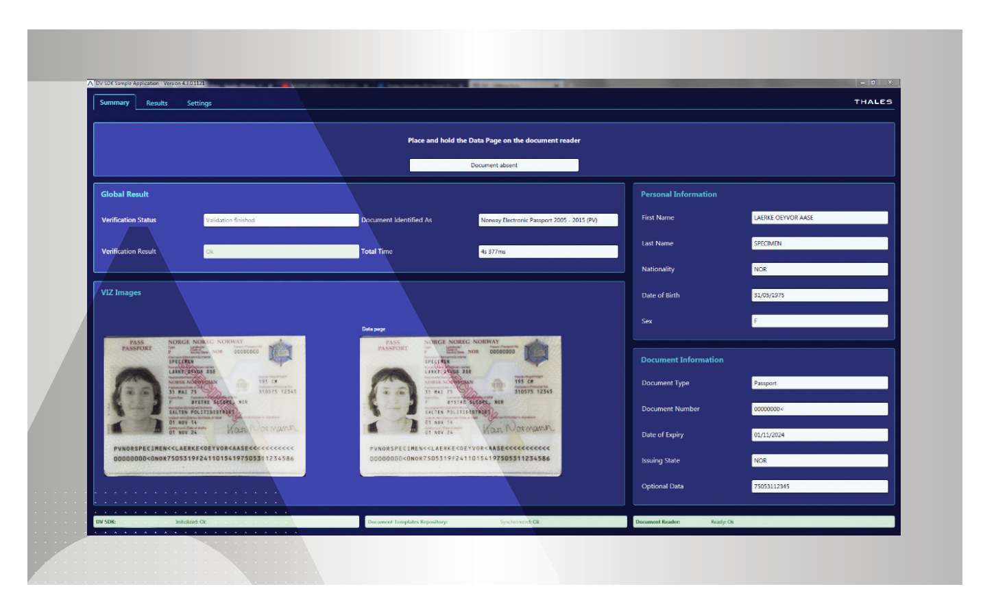
Thales Gemalto DV Sample Application