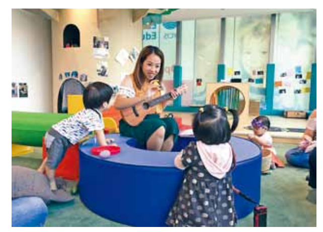
▲ Teachers use music and singing to engage children and support their auditory skills and language development from a young age.

The school follows a Chinese and English bilingual programme for all years. The Infant and Toddler Learning Programme (ITLP) and the Kindergarten Programme is guided by the developmental outcomes of the Early Years Foundation Stage of the National Curriculum of England. In line with this