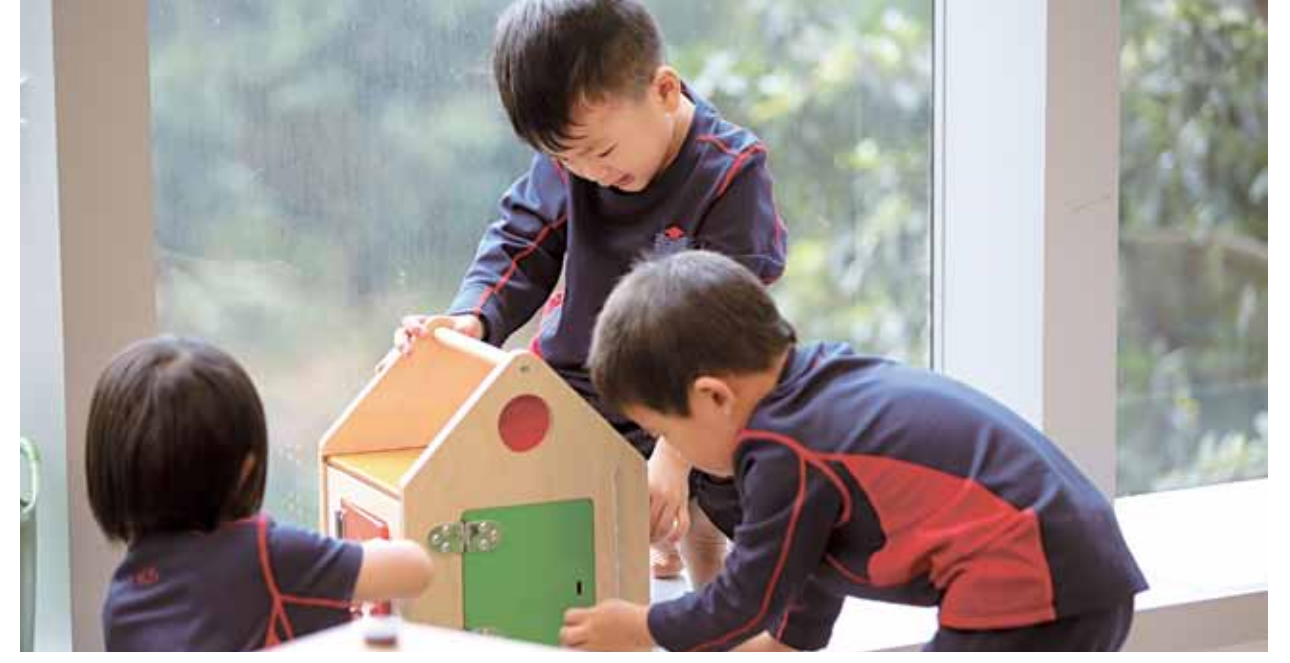
▲ Collaboration with others is an important part of learning and development in an Early Years context.

Every child is respected as a unique individual, and teachers and leaders are focused on creating opportunities and developing ways that enrich and deepen their individual strengths as well as support areas for growth.