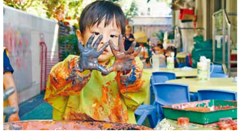
Children's curiosity and investigation are encouraged as they explore their ideas through play opportunities.

curriculum is an emphasis on the motto: 'Development Matters' with focus areas placed on seven domains. These include physical development, understanding the world, expressive arts and design, personal, social and emotional development as well as Mathematics and Literacy.