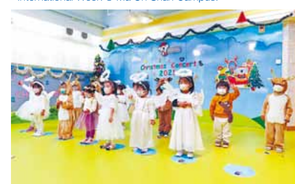
▲ Christrmas Concert @ Fo Tan Campus.