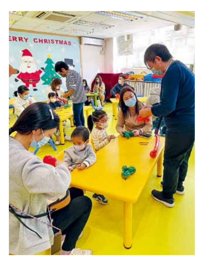
▲ Parent-child Balloon Twisting Workshop held by a student's grand parents.