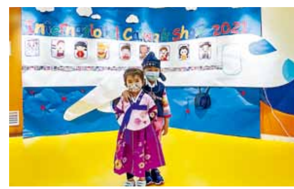
▲ International Week @ Ma On Shan Campus.

The BoxHillian Qualities is a specially curated programme that ties into their philosophy and motto of 'Confidence for a brighter future', and is interwoven throughout their curriculum from prenursery levels to K-3. It encompasses seven animal characters that foster key character traits that enable children to develop positive and social morals while building their interests towards lifelong learning.