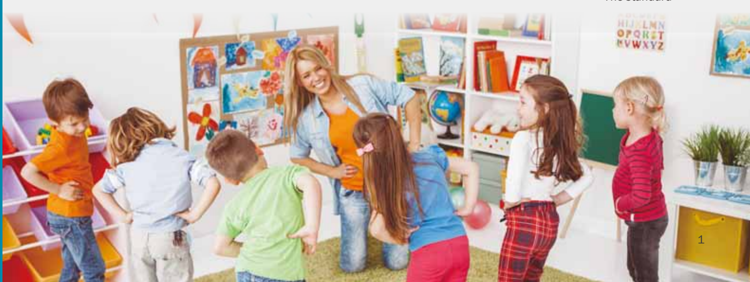
Senior Reporter The Standard