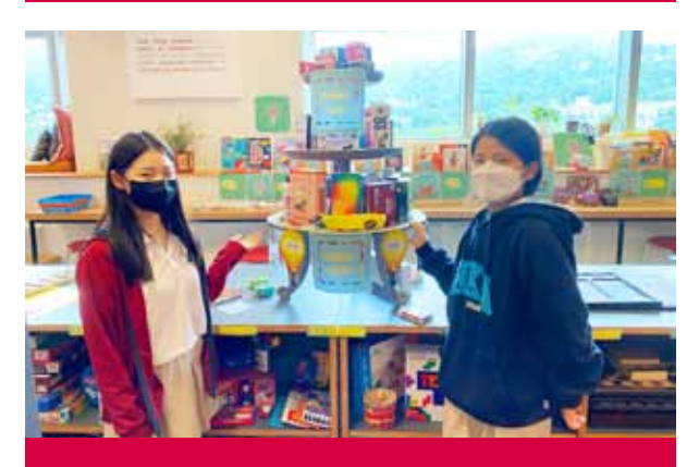
3. Grade 10 students leading a 'Brain Breaks' space in the library where students can mentally recharge by playing a game, reading for pleasure or engaging in conversation.