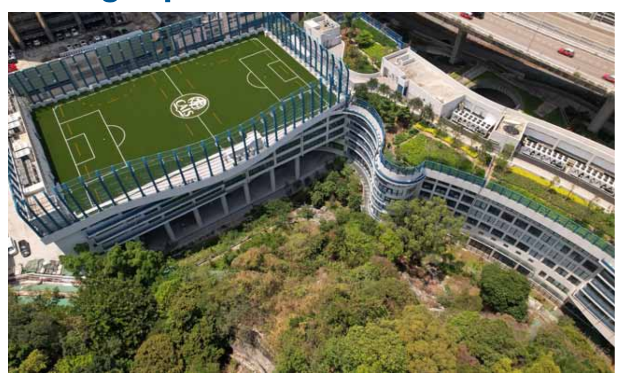
Christian Alliance International School (CAIS) is dedicated to cultivating young minds into holistic future leaders of tomorrow through its diverse curriculum combined with a nurturing environment.