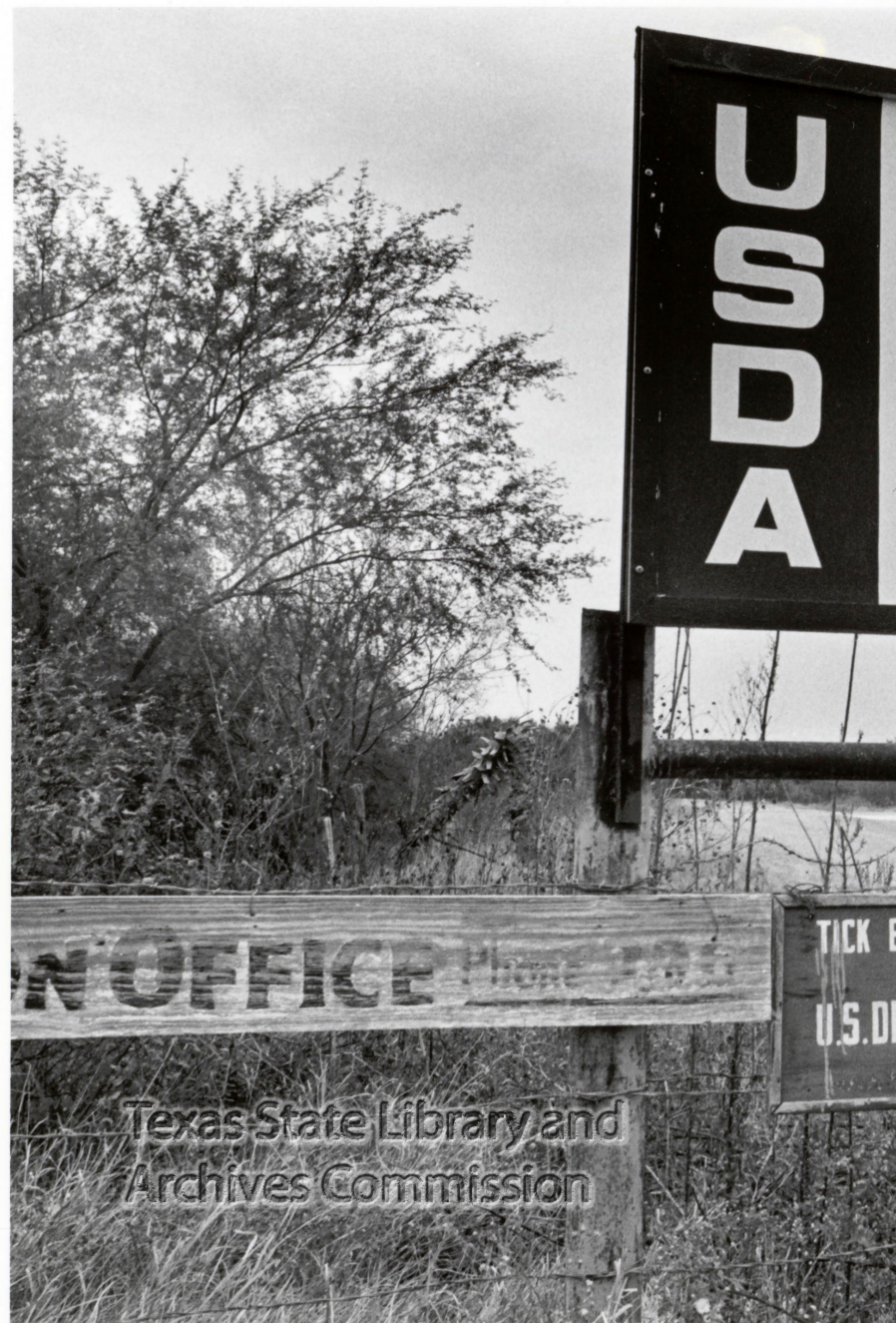
Texas State Library and Archives Commission