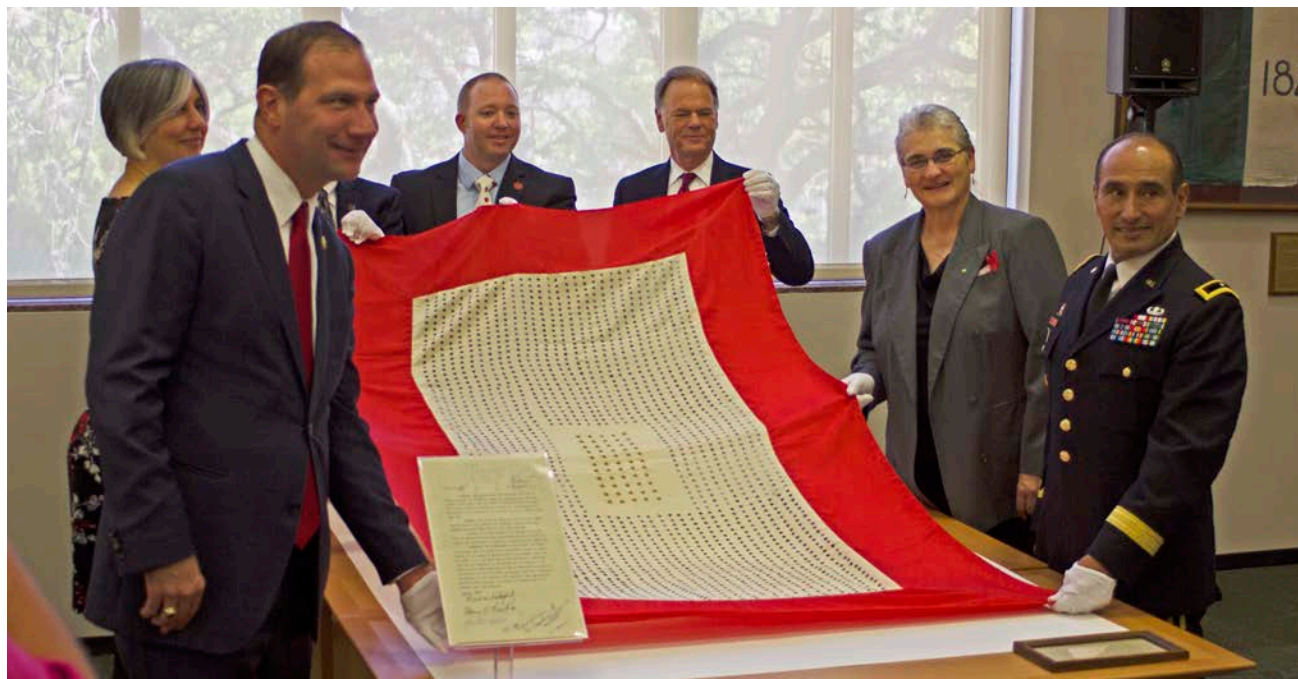
On April 6, 2017 at 10 a.m., the anniversary of the U.S. entry into World War I, TSLAC held a special event to return a flag commemorating students from Texas A&M University who participated in WWI to Texas A&M University. A&M had more students serving in the Great War than any other university in the country.