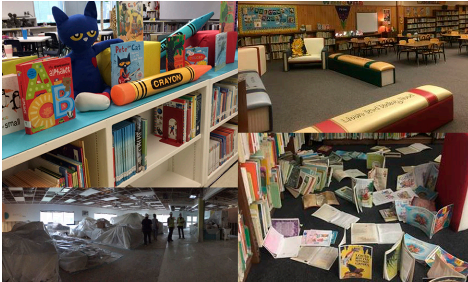
The effects of hurricane Harvey. These images of Little Boy Primary Library in Aransas County ISD in Rockport (left) and Mauriceville Elementary in Little Cypress - Mauriceville CISD in Orange (right) show before (above) and after (below) Harvey.