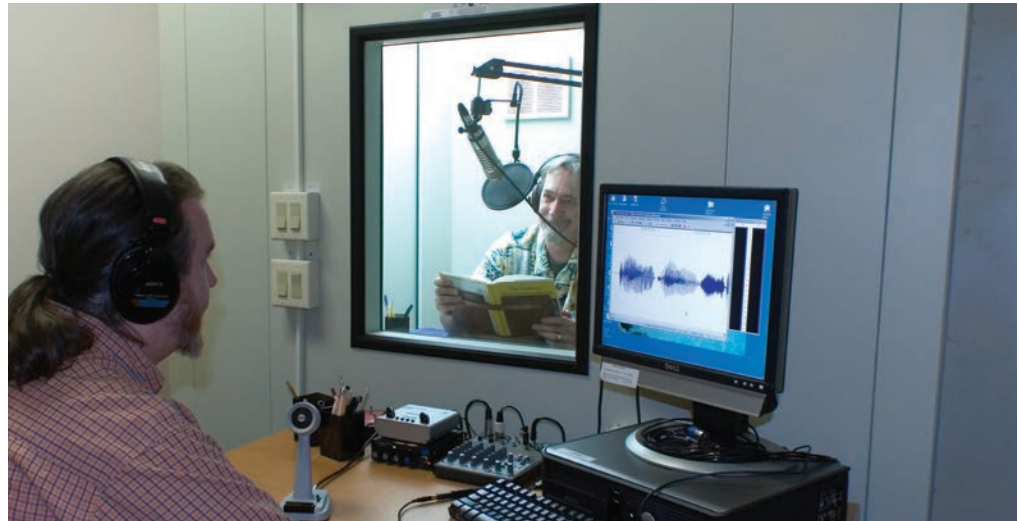
TBP's Volunteer Recording Studio

The Talking Book Program (TBP) provides free library services to qualifying Texans with visual, physical or reading disabilities. TBP is part of the National Library Service for the Blind and Physically Handicapped, a program administered by the Library of Congress.