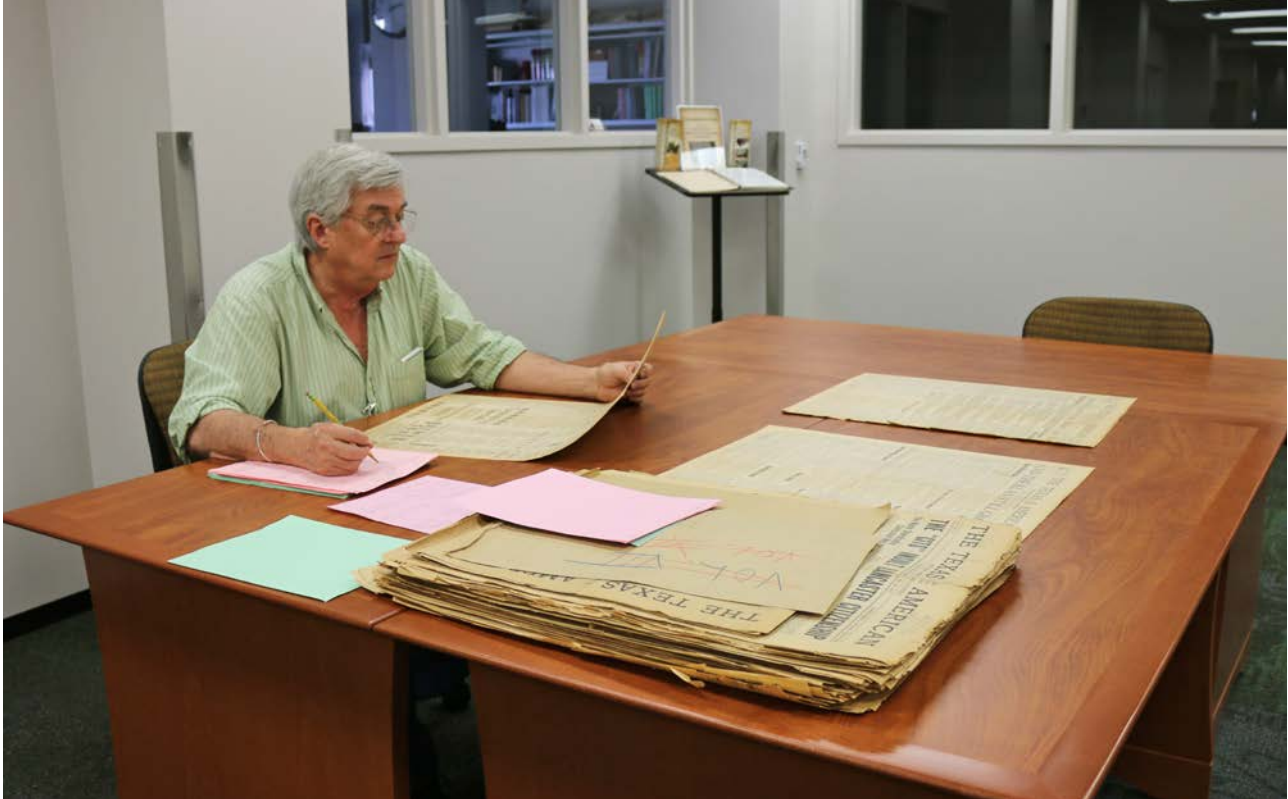
TSLAC patron researching items from the Archives.