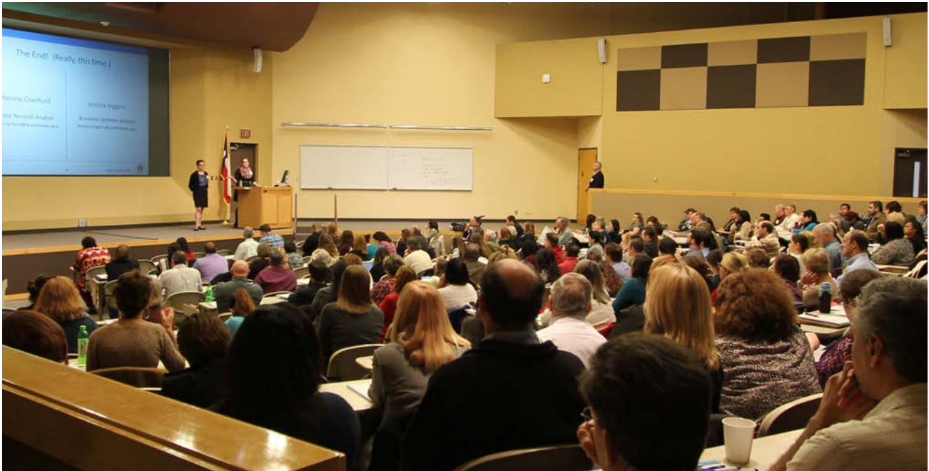
2017 eRecords Conference.

The State and Local Records Management Division provides an infrastructure for managing Texas public records. SLRM assists state and local officials with training, resources, guidelines and consultation to ensure that government information is stored, retained and made accessible.