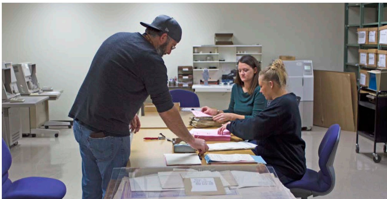
TSLAC staff preparing TXDOT documents for scanning.

TSLAC entered into an MOU with the Texas Department of Transportation (TXDOT) to image and add metadata to all conveyance documents for the state of Texas. These historical materials relate to the purchase of properties in the right-of-way of Texas highways. By making these documents available electronically, TSLAC will ensure the preservation and public accessibility of these vital records. TSLAC is also working with TXDOT’s Right of Way Division to digitize billboard license and permit records.