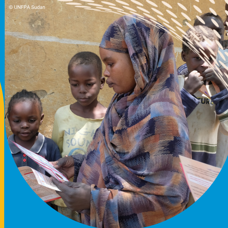
Key results are illustrative only and reflect a calculation based on the donor's contribution proportionally to UNFPA's overall results.

7,218 HIV infections prevented by providing female and male condoms