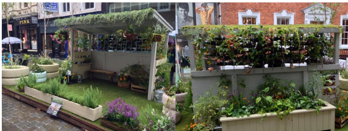
Figure 4: edible bus stop at "Dig the City" front and back

Growing in the City is a non-funded community project. They operate a community garden and interact with local organisations like a mental health charity and a local college. Both use their garden for treatments and education. Now Growing in the City is part of Growing Manchester and operates on a legal basis but initially they started growing food on church grounds without the council's permission because it would have taken too long and they did not know who to contact for permission. For the "Dig the City" urban gardening festival they created an edible bus stop. They would like to convert bus stops into edible places as many people are spending time every day waiting for the bus in places that do not look very nice. An edible bus stop would offer them an opportunity to pick fresh, locally grown food while waiting for the bus.