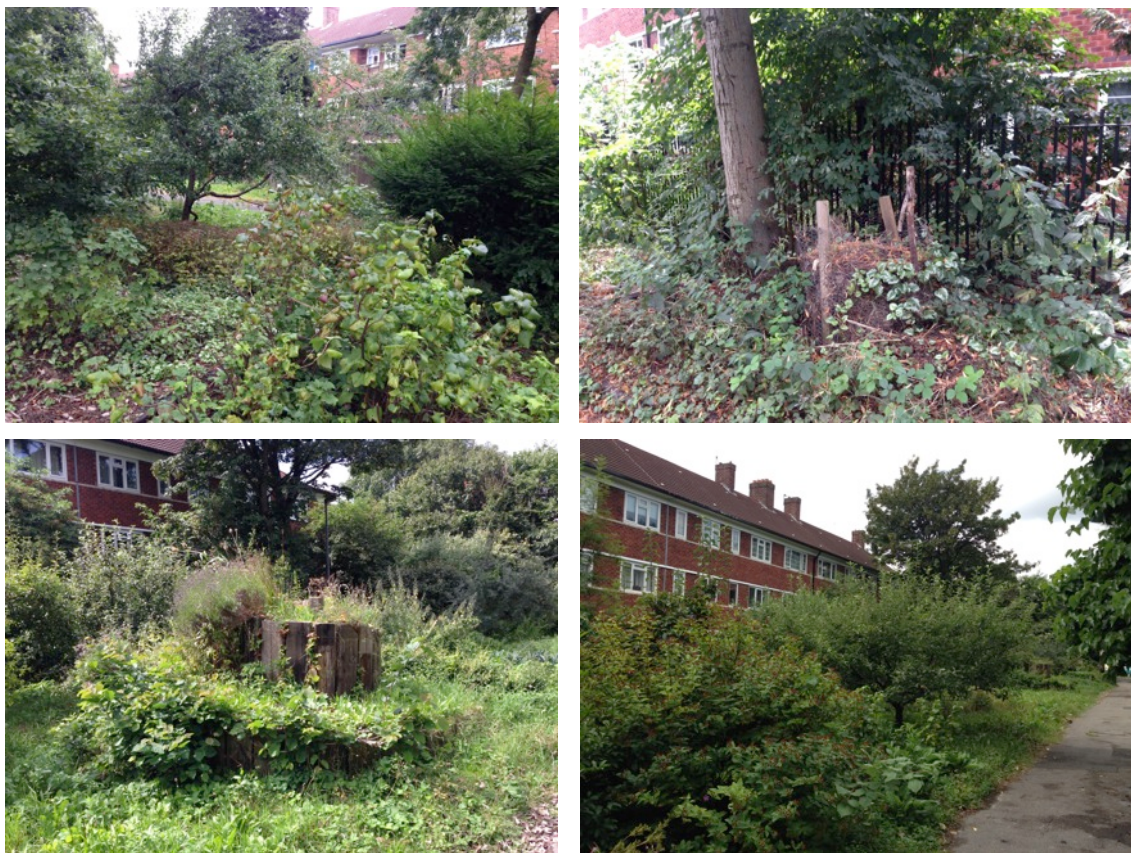
Figure 13: overgrown Leaf Street Community Garden

There is also another famous guerrilla garden in Manchester – the Leaf Street Community Garden, which is located at Leaf Street in Hulme (see map page 6). I tried to establish contact with the gardeners there but unfortunately I would not get any response to my e-mails so I decided to go there and have a look at the garden. I was hoping to meet some people there but the garden was deserted. In general the garden seems quite overgrown and not well maintained. There are fruit trees and berry bushes between high grasses but there were some beds, which seemed to be cultivated. The front part of the garden is very overgrown but the further one goes in the more one can see that people are growing in this area.