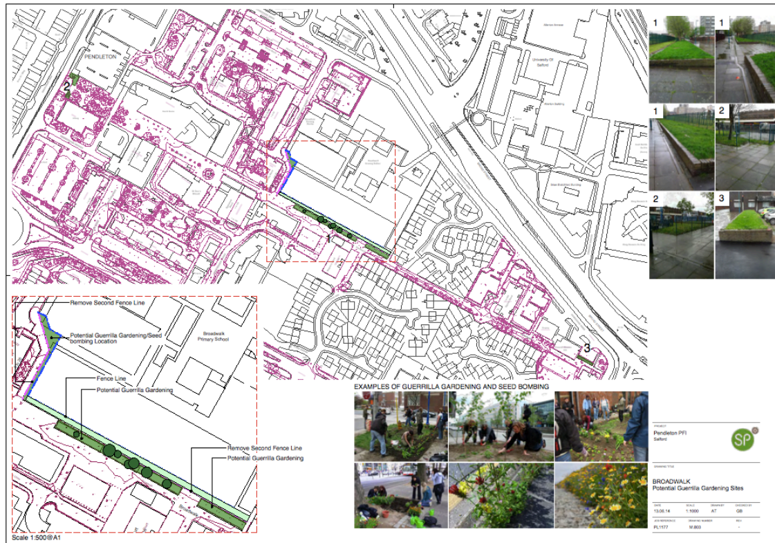
Figure 6: potential guerrilla gardening areas along Pendelton Broadwalk

Officially one would have to apply and get permission to grow on vacant spots in the city but the local authority in Salford tends not to interfere with illegal grow sites. It is an unwritten acceptance that one can garden wherever one wants to as there is so much space available and no one really takes care of it. Also it saves time and money for the city council if they do not have to maintain the spaces. At a short visit on the site, a small guerrilla garden in the area was discovered. The potential seems to be high as there is already someone gardening on an illegal basis.