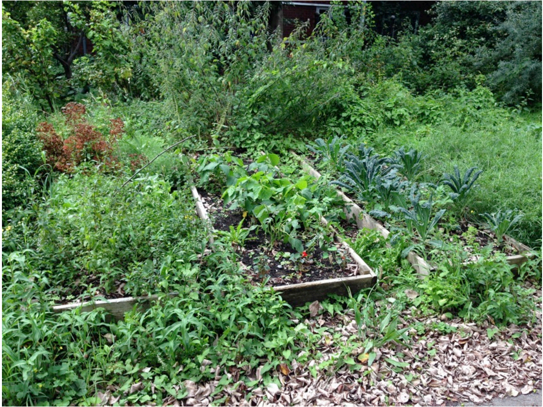
Figure 14: planted beds at Leaf Street Community Garden