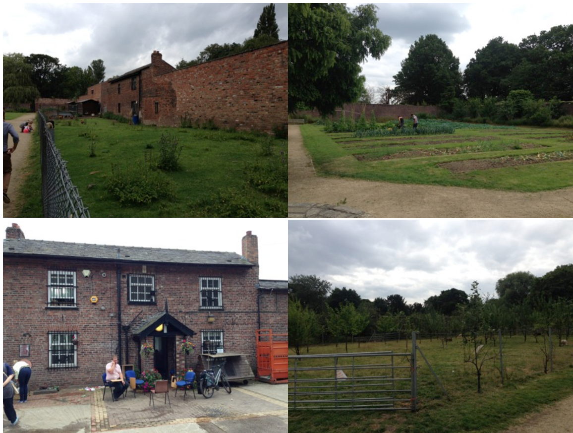
Figure 5: Real Food Wythenshawe urban farm, location see Figure 2/3

Real Food Wythenshawe is another food organisation in Manchester. They operate in Wythenshawe, a part of the city of Manchester. The project consists of several key partners from public, private and voluntary organisations and offers skills and experience. They try to inform and educate as many locals as possible about how to live a healthier life. In Wythenshawe Park they operate an urban farm with some animals and a walled garden for vegetable produce. The produce is sold in a small store directly at the farm.