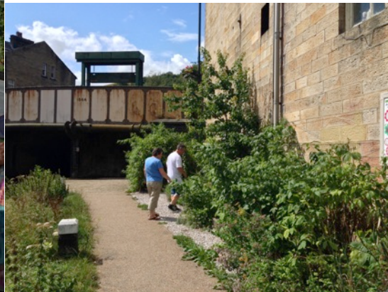
Figure 9: place regenerated by guerrilla gardening which used to be filled with litter