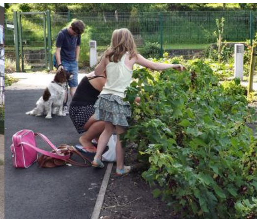
Figure 11: unknown family picking blackcurrants