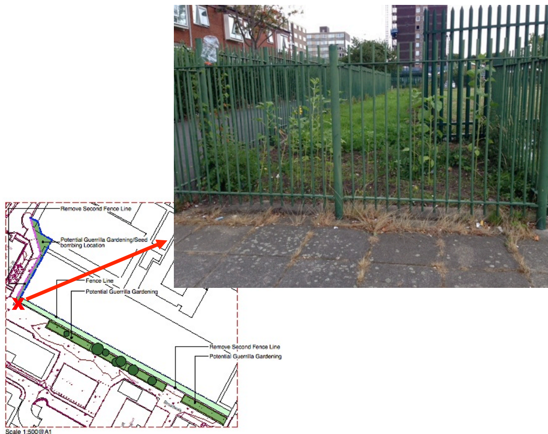
Figure 7: small guerrilla garden on the potential Guerrilla Gardening site of the Pendelton Regeneration Project