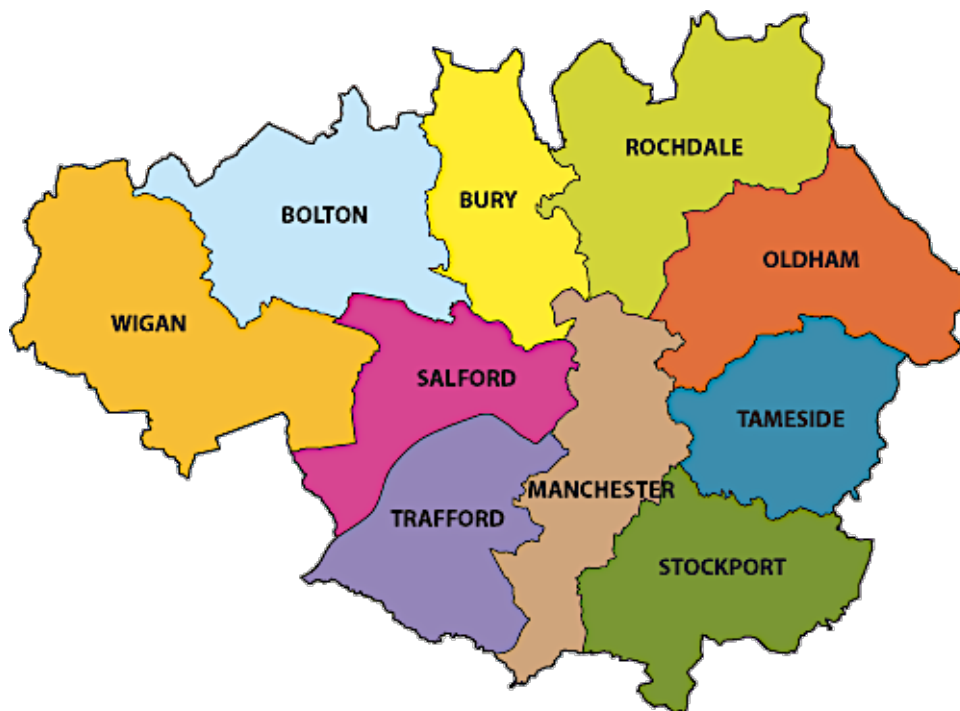
Figure 1: Greater Manchester

The research area is Greater Manchester. Located in the North West of England it consists of ten districts with a population of 2.7 million. After Greater London and the West Midlands it is the third most populated area in the UK. (Wikipedia n.d.) According to a survey conducted by the BBC Inside Out in 2007, where 1,000 people were questioned, Manchester is the second most important city in the UK (BBC 2007). With an unemployment rate of 8.7% the area lies above the national average of 7.2% (Nomis 2014).