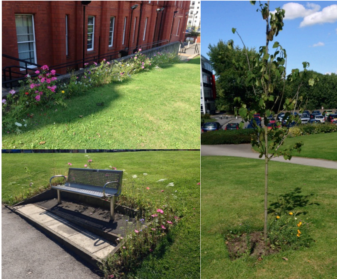
Figure12: wild flower guerrilla beds on University of Salford campus (source: author's photograph)