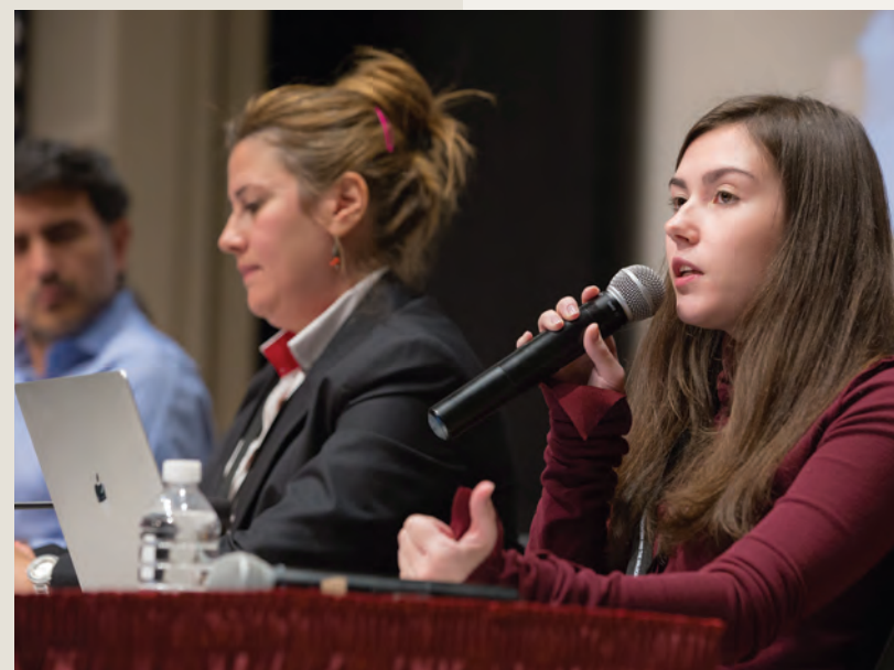
ABOVE LEFT: The new version of the online Holocaust Encyclopedia is optimized for viewing on mobile devices. LEFT: A representative of the Babi Yar Holocaust Memorial Charity Fund addresses a group of international educators gathered at the Museum.