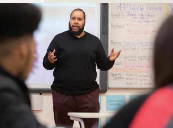
ABOVE: A Museum educator introduces Advanced Placement teachers to new resources on the Holocaust. RIGHT: Teachers from Argentina and Indonesia participating in the 2017 International Conference on Education and the Holocaust learn from a Chilean instructor (SECOND FROM LEFT) who attended the conference in 2015.

SHAPING LEARNING AND UNDERSTANDING requires influencing the educational infrastructure. Thanks to a new partnership with the College Board, our educational resources are now part of Advanced Placement (AP) European History courses for high school students nationwide. More than 6,000 AP teachers have already accessed an online professional development module on how to use Museum collections.