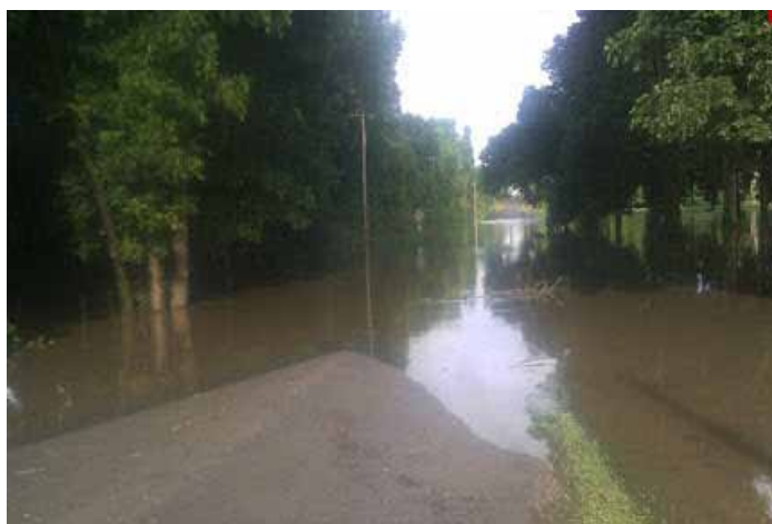
Bird Creek in Oklahoma continue to have a flooding problem. Here it overflows the road.

The Willapa Harbor Station was equipped with a Tipping Bucket rain gauge, anemometer, wind vane, sunshine recorder, and hygrothermograph. At the age of 83,