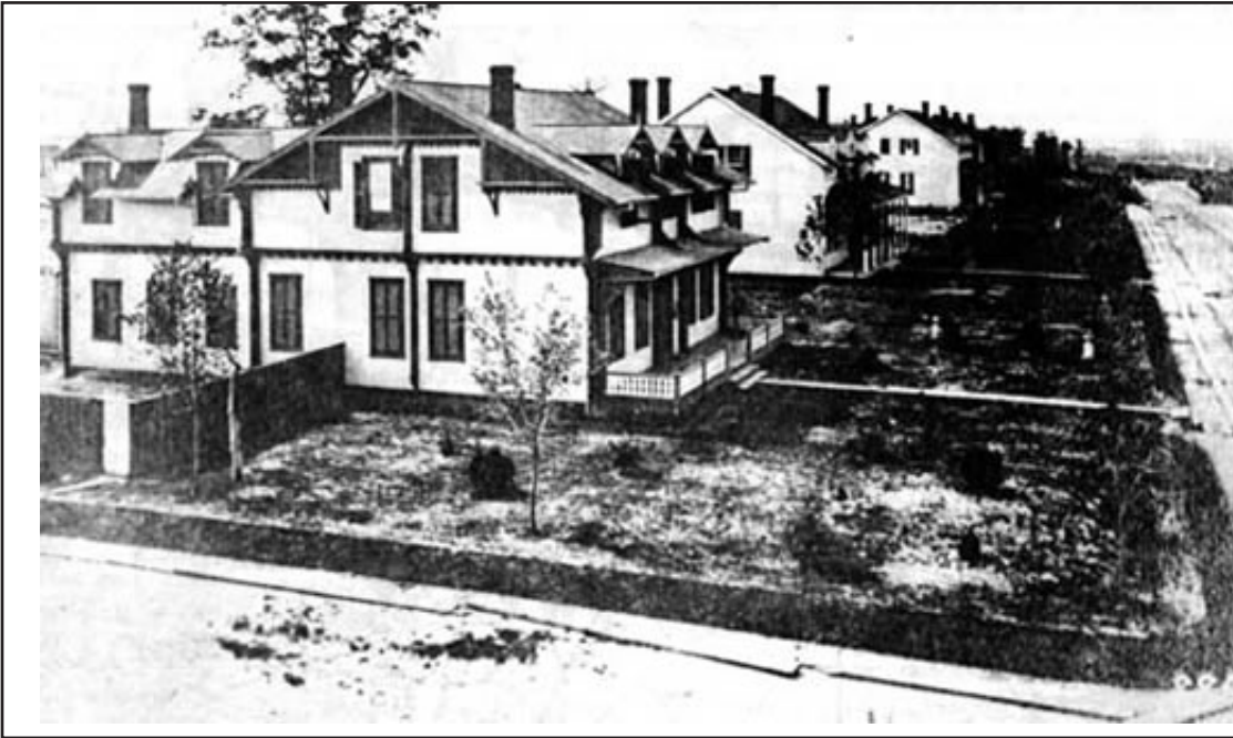
Ft. Myers, VA, the home of the Military's Signal Corps in the late 1800s.

The parting of the ways came on June 30, 1891, when the meteorological work of the Signal Corps was taken over by the Weather Bureau in the Department of Agriculture on July 1. With comparatively few exceptions, the personnel of the Signal Corps elected to go into civil life.