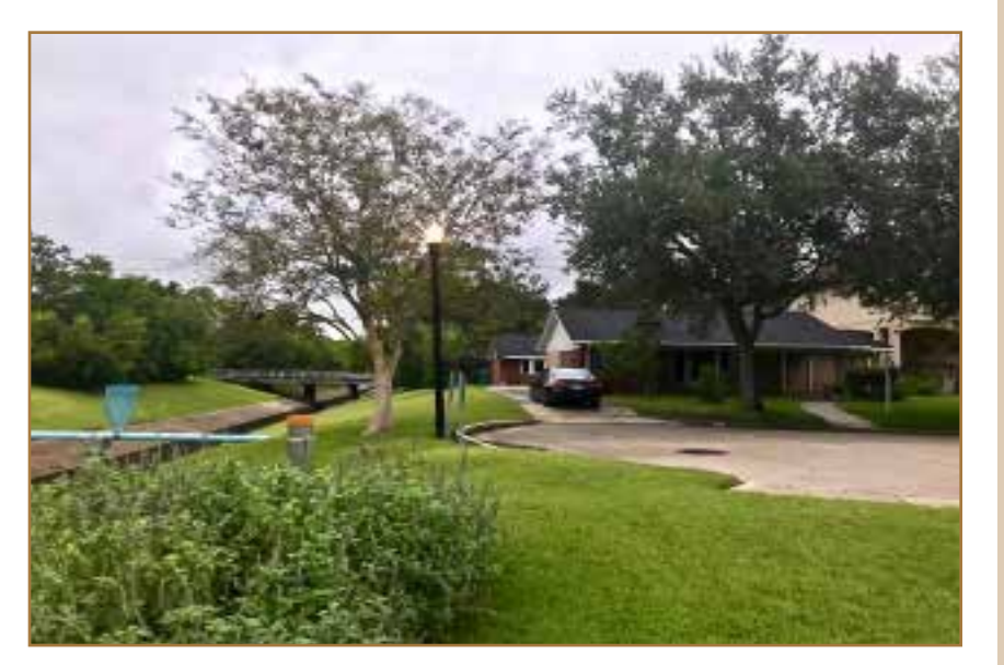
Figure 6: Rain gauge after water receded.

As a foot note, my home did not experience