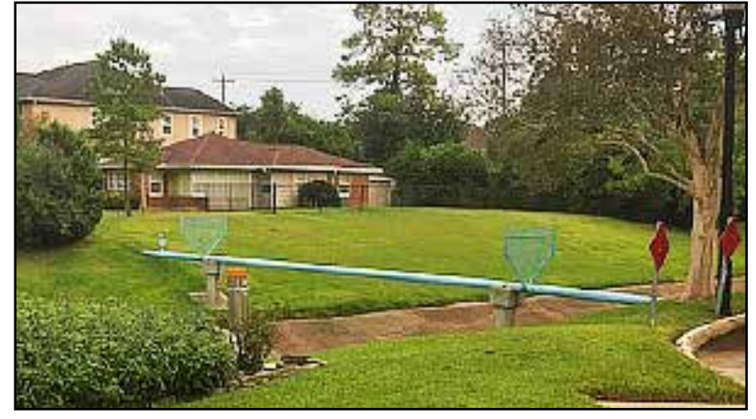
Figure 1: Rain gauge by drainage ditch

The first outer bands of Harvey produced moderate to briefly heavy rainfall. My first day total was 2.98 ending at 7 am on Saturday August 26. This amount caused