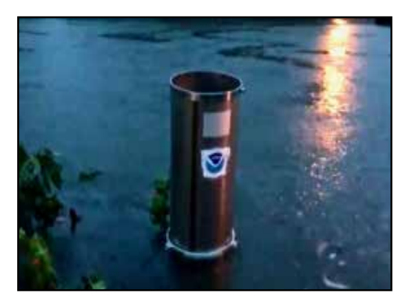
Figure 3: Rain gauge in danger of floating away

some time to think. I had already moved my vehicles across the street to higher ground since my garage was a lot lower than my neighbor's driveway.