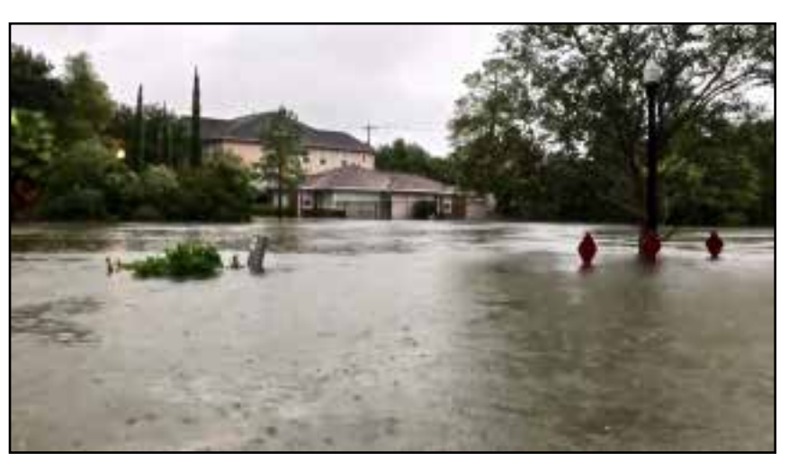
Figure 2: Rain gauge partially submerged, left.

I used a shim of wood for leveling and a brick deposited into the can for stability, although I did not think the wind would