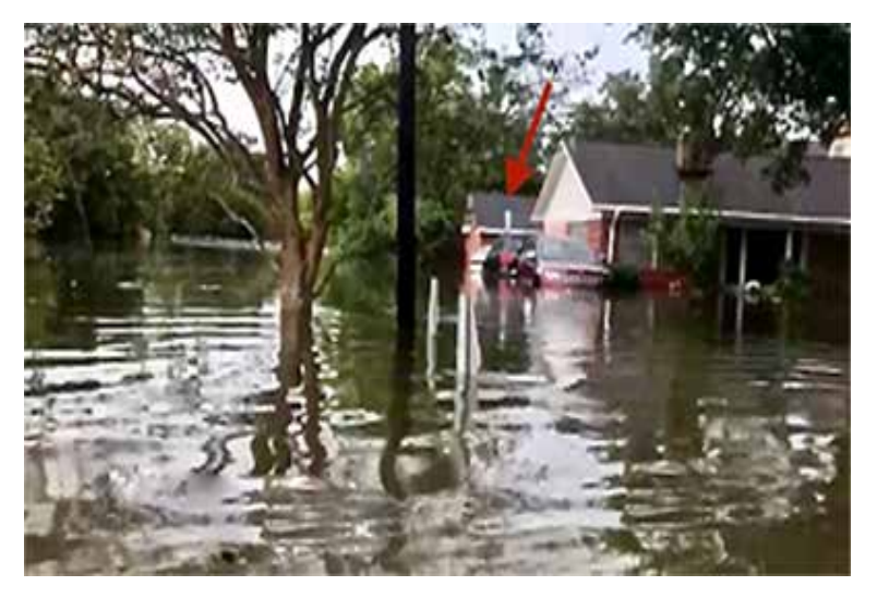
Figure 4: Newest location of rain gauge on car at full flood during Hurricane Harvey.

Heavy rainfall continued on and off for the next 2 days, 8.46 inches on the 29<sup>th</sup> and 0.87 inches on the 30<sup>th</sup>. Thankfully, the drainage ditch remained at bank full but did not threaten to overflow again. My 5-day storm total was 31.31 inches.