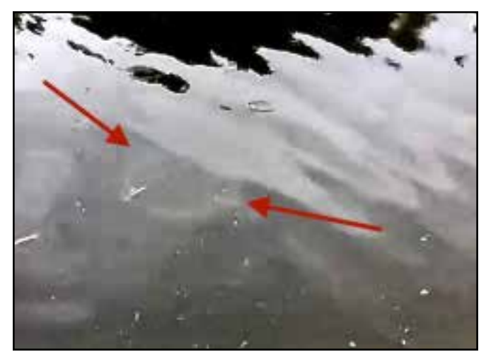
Figure 5: Rain gauge under water

any flooding because it was built above the 100 year flood plain. My garage is at normal grade and received 28 inches and sustained minor damage. Both of my vehicles were lost in the flood.