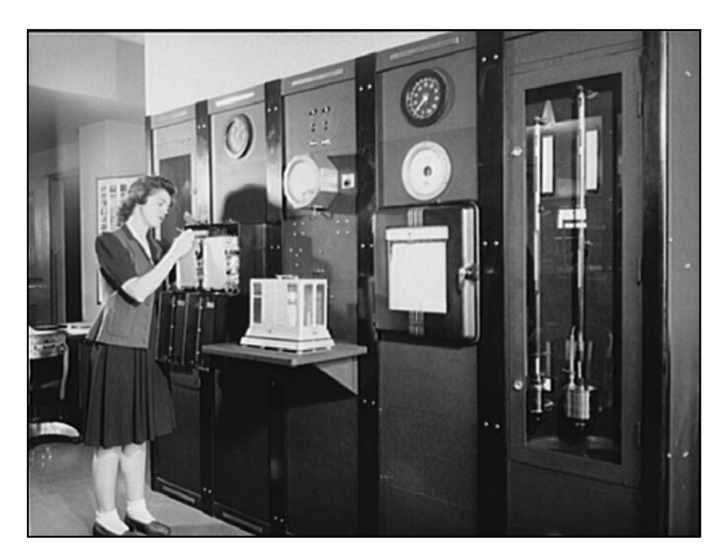
NWS staff member checking surface observations in 1943.

making observations of plants and animals in the New World, they journalized day-to-day weather on their plantations. Weather observations included temperature, barometric pressure, winds, and precipitation.