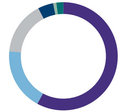
● 57% Visitors ● 19% Trading ● 16% Donations ● 5% Investment Income ● 1% Special Events ● 2% Other