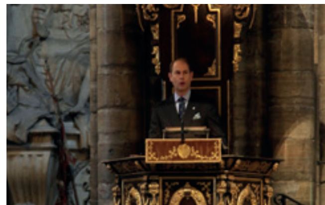
His Royal Highness The Earl of Wessex gives the Address at a Service to mark the Diamond Anniversary of The Duke of Edinburgh Award in September.

Building works this year have included new public lavatories off the South Cloister. Work also continued on repairs highlighted last year in the Quinquennial Survey report. This included re-roofing St Margaret's Church and the North porch of the Abbey as well as repairing the Abbey's precinct wall, commencing work on re-roofing the South Triforium roof of the Abbey and refurbishing parts of the organ. A total of £1.2m was spent on these works during the year. We are grateful to the Garfield Weston Trust which made grants of £0.8m to the Abbey to support this work.