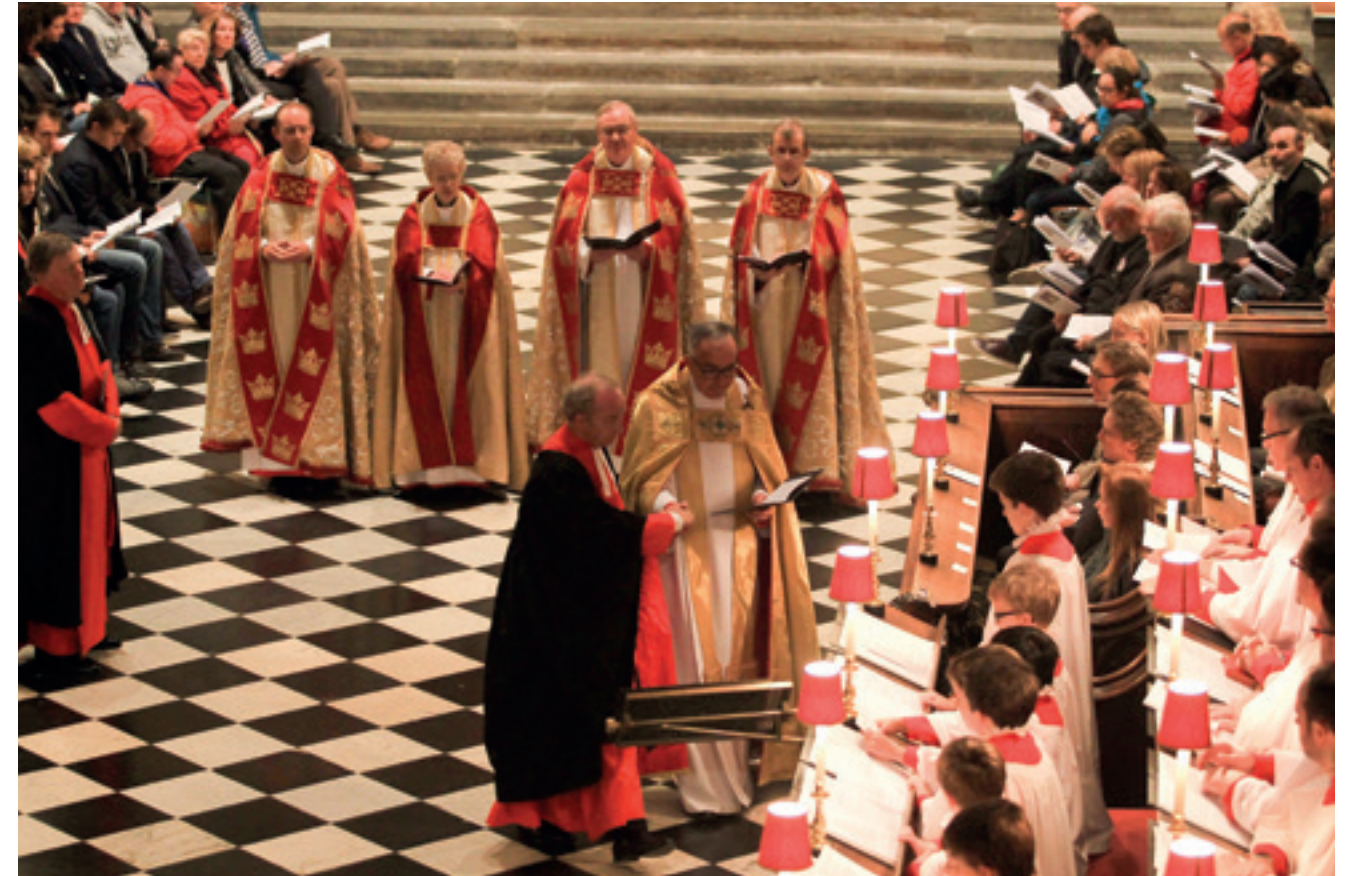
The Dean shows the Duke of Buccleuch and Queensbury to his stall in the Quire during his installation as High Steward in October.

I have reported in previous years that the theological life of the Abbey is part of its life-blood, operating at various different levels but all important. I look forward to sabbatical leave early in 2017 in the USA and Hong Kong as an opportunity not just for personal refreshment, but also to gain new perspectives and resources in theology from overseas to offer back to the Abbey.