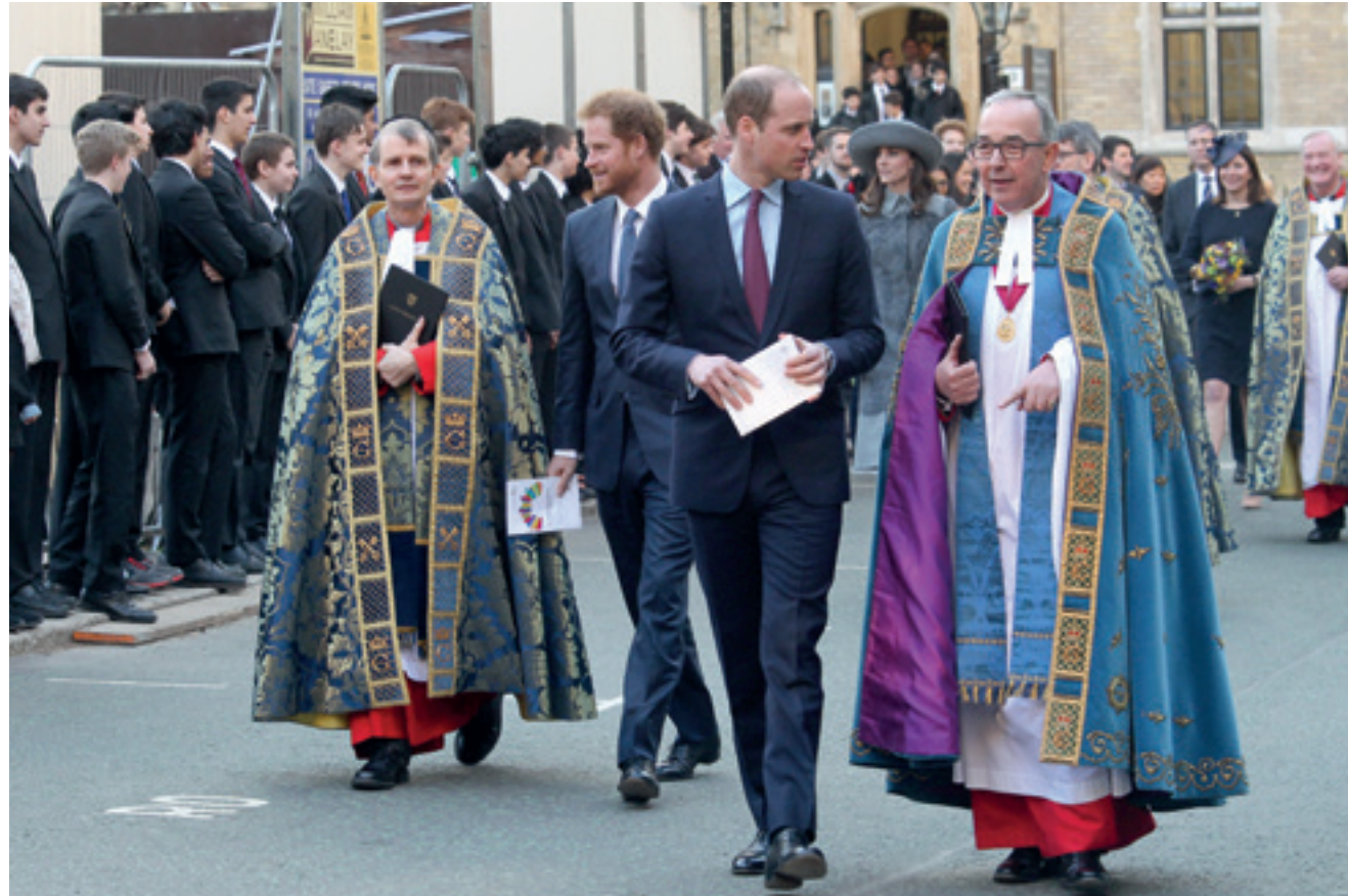
Their Royal Highnesses the Duke and Duchess of Cambridge and Prince Henry of Wales walk through Dean's Yard after the Commonwealth Day service in March.