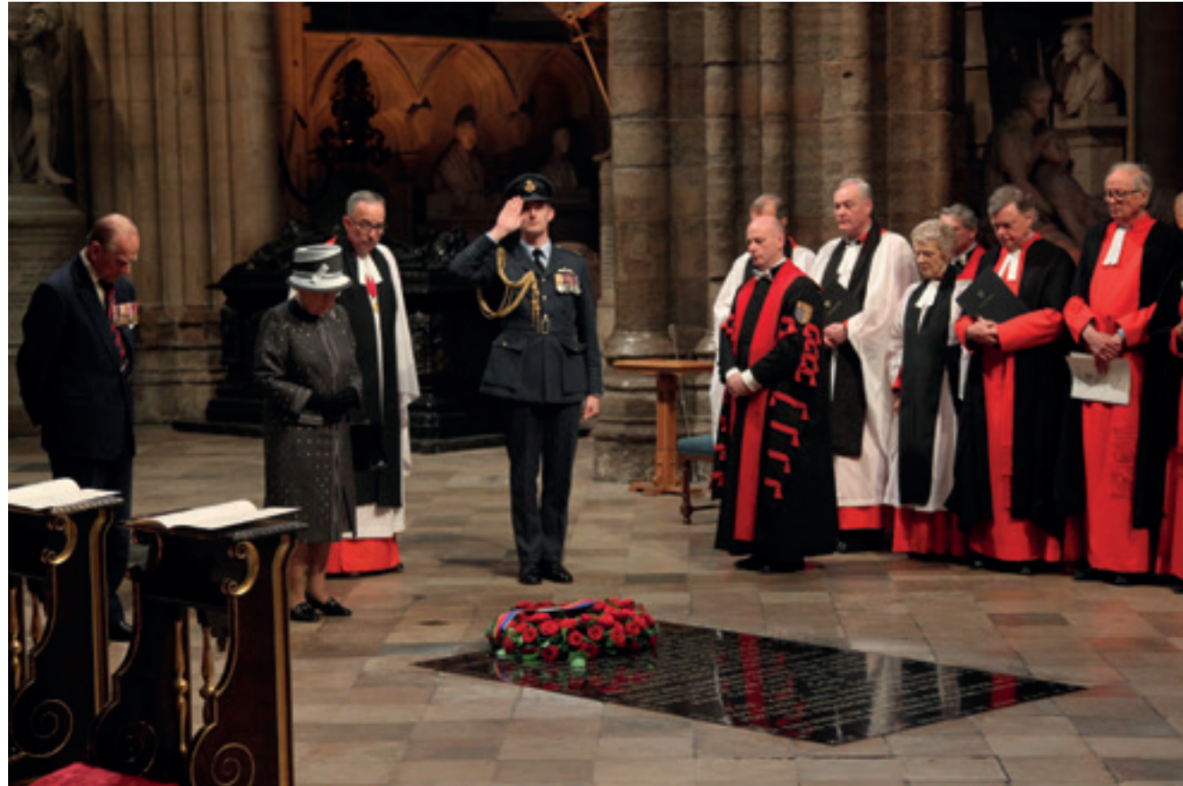
Her Majesty The Queen during the wreathlaying at a Service and Vigil on the Eve of the Centenary of the Battle of the Somme in June