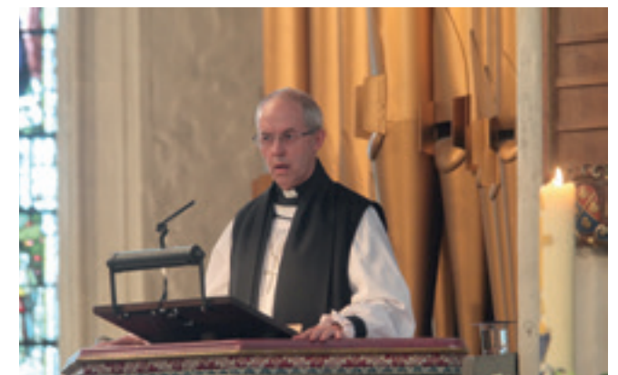
The Most Reverend and Right Honourable Justin Welby, Archbishop of Canterbury, Primate of All England, and Metropolitan paid tribute to the late Jo Cox MP at a memorial service in June.