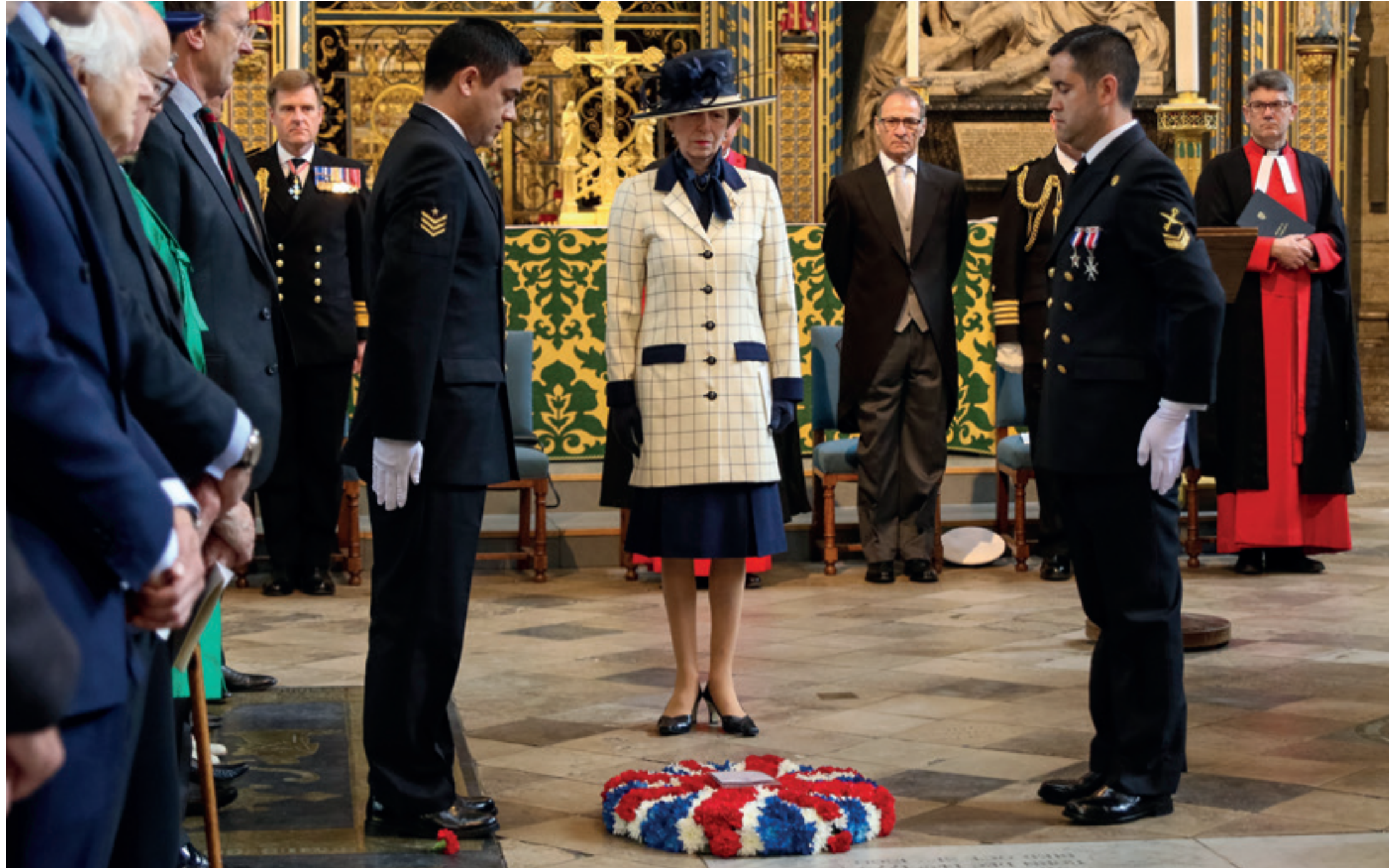
Her Royal Highness The Princess Royal joins representatives of the Chilean Navy at Westminster Abbey in May for the annual wreathlaying ceremony to honour Admiral Lord Cochrane, 10 th Earl of Dundonald, on Chilean Naval Day.