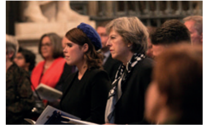
Her Royal Highness Princess Eugenie of York and the Prime Minister, the Right Honourable Theresa May MP, at a wreathlaying at Westminster Abbey in October to honour the work of William Wilberforce and to mark the publication of the first annual report of the United Kingdom's Anti-slavery Commissioner.