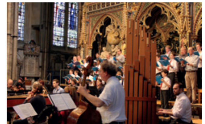
The Choir of Westminster Abbey rehearses with St James' Baroque for the London Festival of Baroque Music in September.