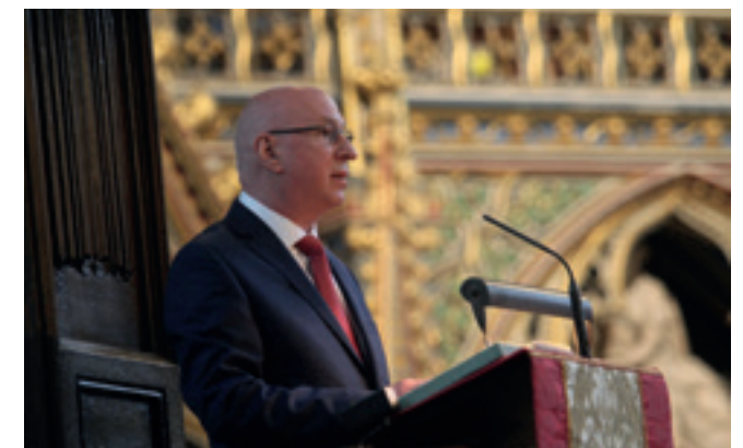
The BBC Radio 2 presenter Ken Bruce reads a Lesson during the Service of Thanksgiving for the Life of Sir Terry Wogan.