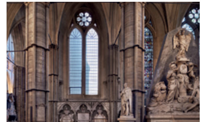
The Abbey has commissioned David Hockney to design a window in the north transept to celebrate the reign of Her Majesty The Queen.