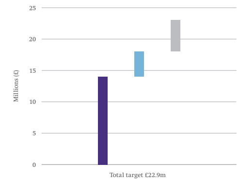
● £4.9m Left to Fundraise at 29 Sept 16 ● £3.9m Pledged to 29 Sept 16 ● £14.1m Received to 29 Sept 16