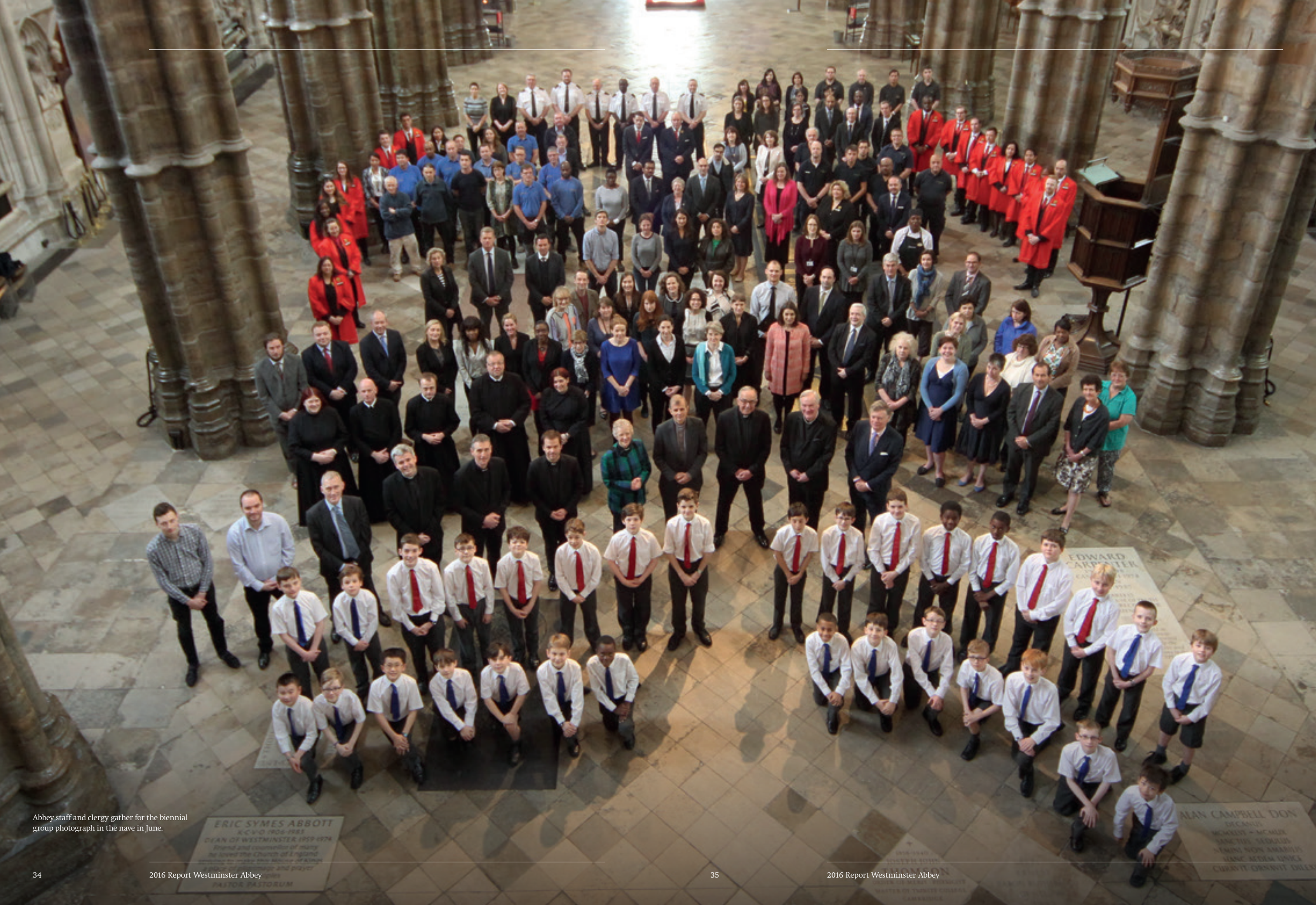
Abbey staff and clergy gather for the biennial group photograph in the nave in June.