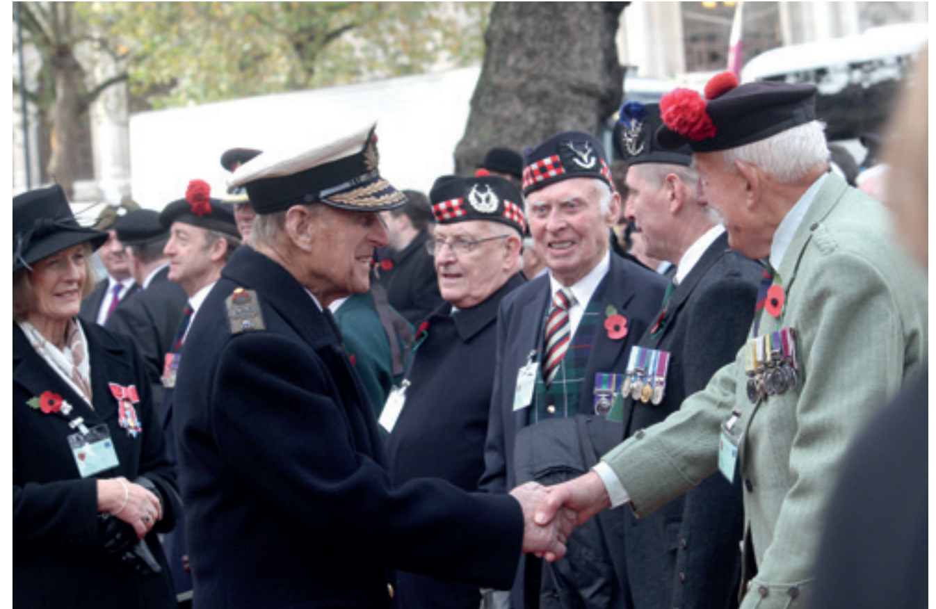
His Royal Highness The Duke of Edinburgh meets veterans during the Opening of the Field of Remembrance in November.

At the end of the year, the Abbey musicians and clergy were preparing for a visit to Rome in January 2017. The Pope had invited the Abbey Choir to sing with the Sistine Chapel Choir at Vespers in the Basilica of St Paul without the Walls to mark the culmination of the annual Week of Prayer for Christian Unity on the Feast of the Conversion of St Paul. His Holiness would give the Abbey choir and delegation a private audience. The previous evening, again with the Sistine Chapel Choir, the Abbey Choir planned to perform a concert of sacred music in the Basilica of St John Lateran. Some music would be sung by each choir separately and some by both choirs together. Significantly, the Sistine Chapel Choir had prepared to sing with the Abbey Choir an anthem in English composed by Sir Hubert Parry.