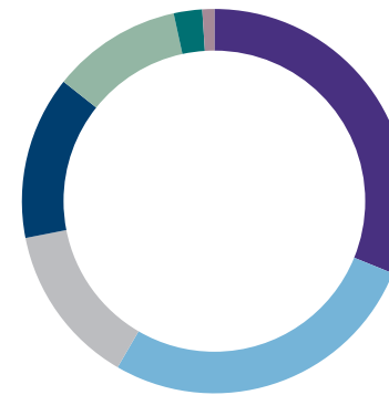
● 31% Visitor Related ● 27% Upkeep ● 14% Choir & Music ● 14% Religious Activities ● 11% Trading ● 2% Special Events ● 1% Fundraising