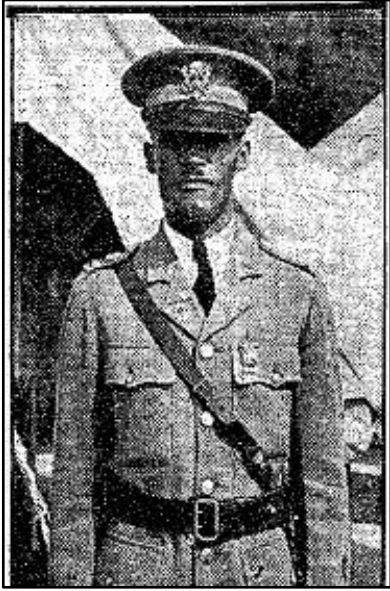
Afro-American (Baltimore, MD) 15 May 1936

Army Officer, Athlete, and Census Bureau Manager