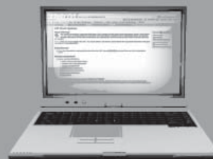
Table of contents Podcasts Ahead of Print Medscape CME Specialized topics