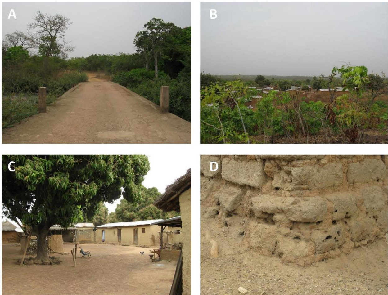
Technical Appendix Figure. Villages in the Sibirilia commune of southern Mali are predominantly rural and isolated by heavily wooded savannas. A) The road to the village of Soromba; B) Soromba and surrounding area; C) typical housing in this region; D) evidence of rodent infestation.