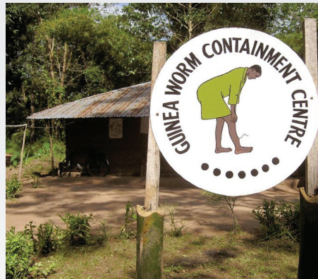
This 2004 photograph depicted the entrance to a Nigerian Guinea worm containment center. The sign at the entrance displayed a drawing of a Guinea worm sufferer.

Guinea worm disease was once a substantial cause of illness in tropical and subtropical Africa and Asia, but cases declined as water sanitation improved in the 19th century. In 1986, the World Health Organization resolved to eradicate the parasite, and in 2015, due in large part to the work of the Carter Center, led by former Centers for Disease Control and Prevention Deputy Director Donald R. Hopkins, there were only 22 cases in 4 countries (Chad, Ethiopia, Mali, and South Sudan).