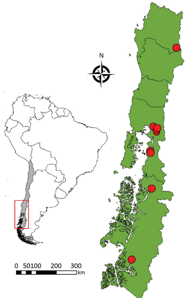
Figure. Locations of probable exposures (red circles) of 9 scrub typhus patients in continental Chile, 2016–2018. Inset map shows the study area (red box) and the location of Chile (gray shading) within South America.

The case series we report provides important epidemiologic information for South America, highlighting that scrub typhus is not limited to Chiloé Island but also occurs over a wide range of continental Chile. The actual incidence of the infection remains unknown; the observed increase from 1 case in 2016 to 6 cases in 2018 most probably reflects the growing awareness of scrub typhus among