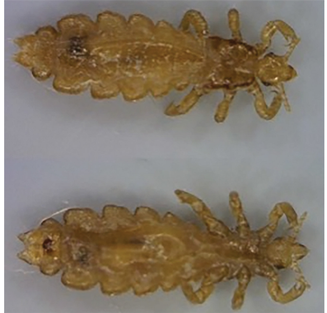
Figure 2. Two female body lice, Pediculus humanus humanus , collected from a person experiencing homelessness in inner city Winnipeg, Manitoba, Canada (9).

When analyzing B. quintana -positive louse pools, we found Ct values were similar between ITS3, yopP , and fabB genes (test statistic H = 0.54 ; p = 0.76 ). The average ITS3 Ct values decreased from the first and second instar pools (34.6) to the third instar pools (28.9) by 5.7, and from the third instar pools to the