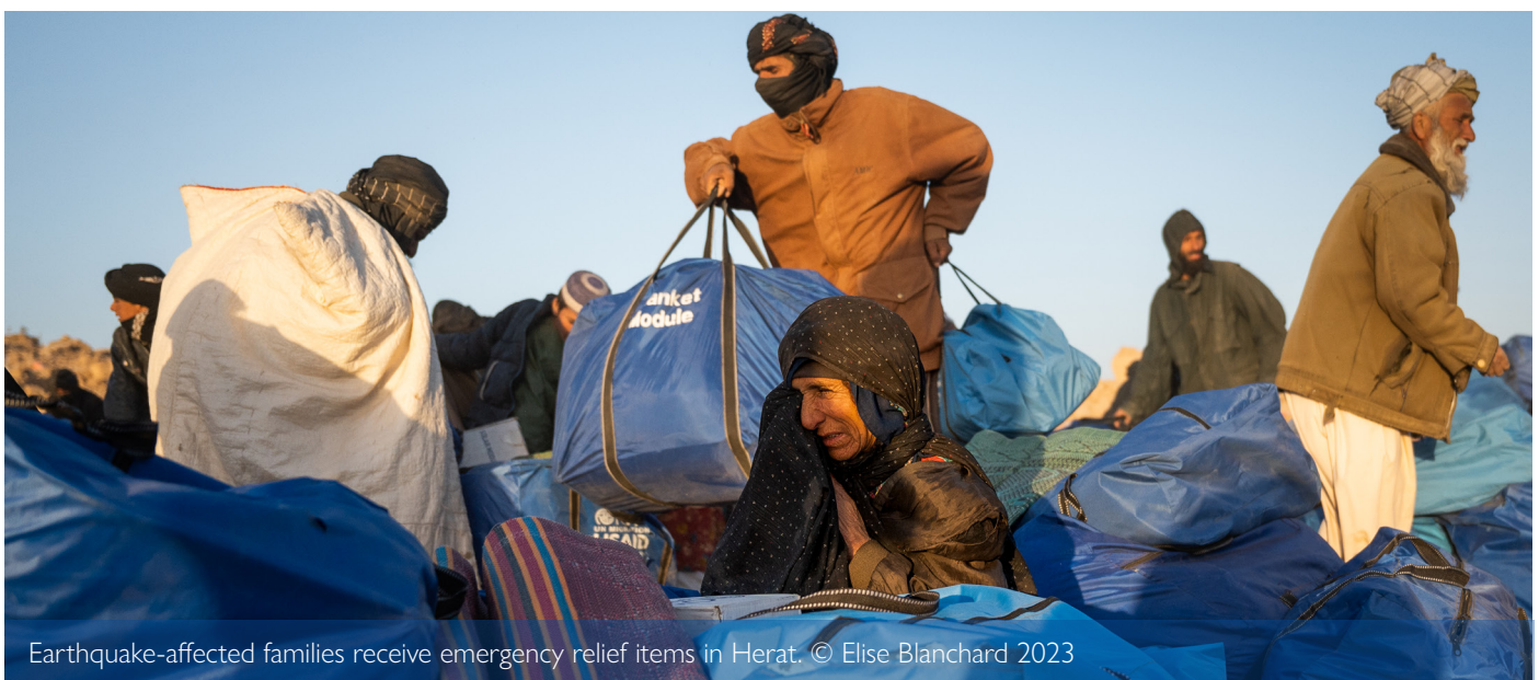
Earthquake-affected families receive emergency relief items in Herat.