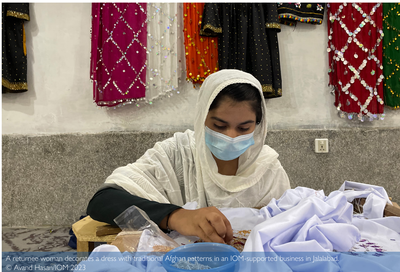
A returnee woman decorates a dress with traditional Afghan patterns in an IOM-supported business in Jalalabad.