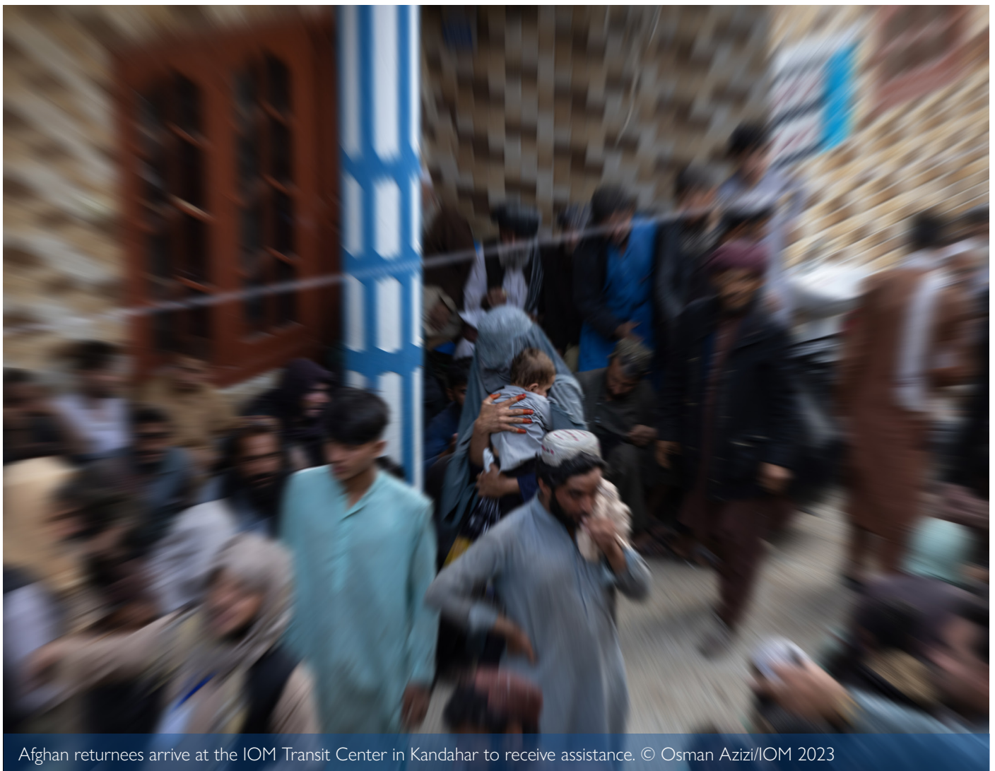
Afghan returnees arrive at the IOM Transit Center in Kandahar to receive assistance.

With a workforce of over 1,200 people, IOM is present in 34 provinces, has seven sub-offices, and manages 16 warehouses across the country.