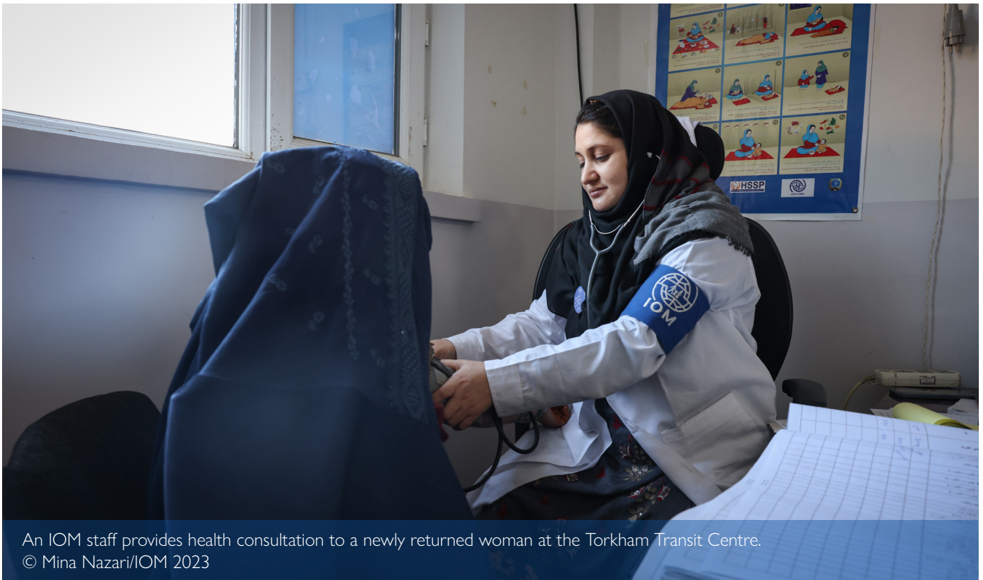
An IOM staff provides health consultation to a newly returned woman at the Torkham Transit Centre.

Despite these measures, during 2023, IOM remained committed to ensuring women’s meaningful engagement and participation as deemed culturally acceptable and when needed throughout its programming. Through these efforts, IOM has upheld its commitments to not replacing female staff with male staff and prioritizing staff safety and security.