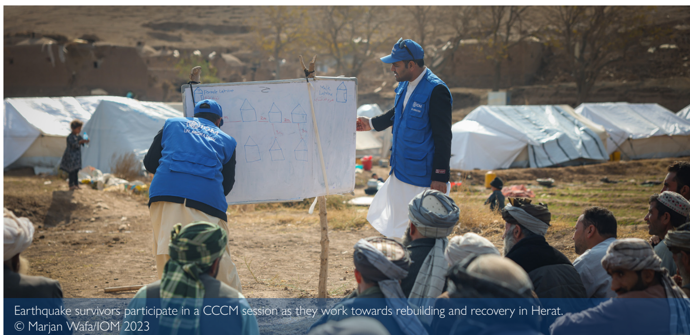
Earthquake survivors participate in a CCCM session as they work towards rebuilding and recovery in Herat.