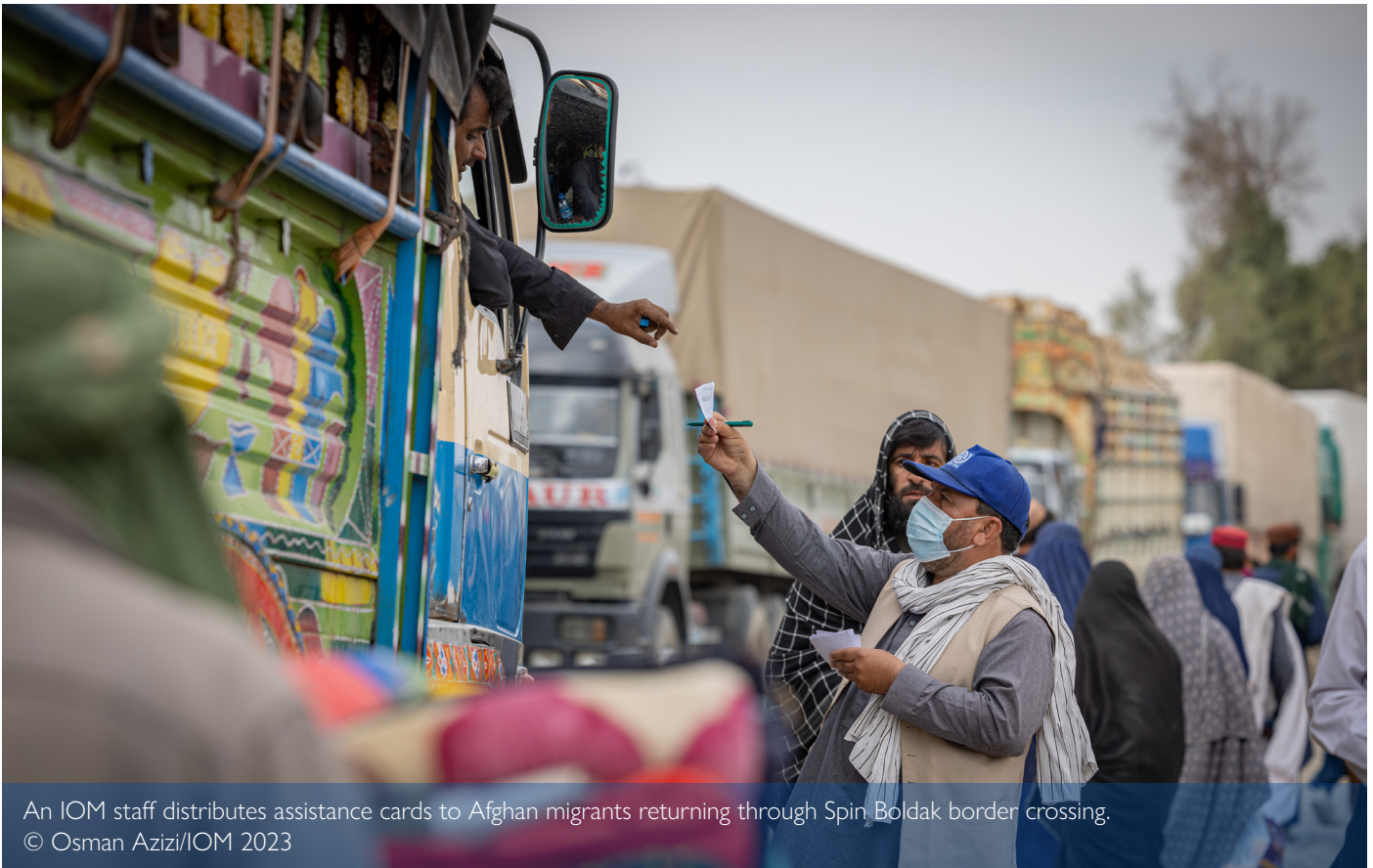
An IOM staff distributes assistance cards to Afghan migrants returning through Spin Boldak border crossing.