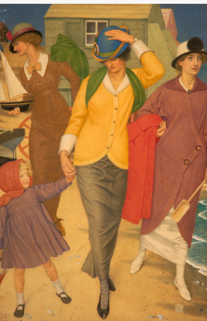
ABOVE Joseph Edward Southall Southall (1861–1944) Along the Shore , 1914 Gallery Oldham