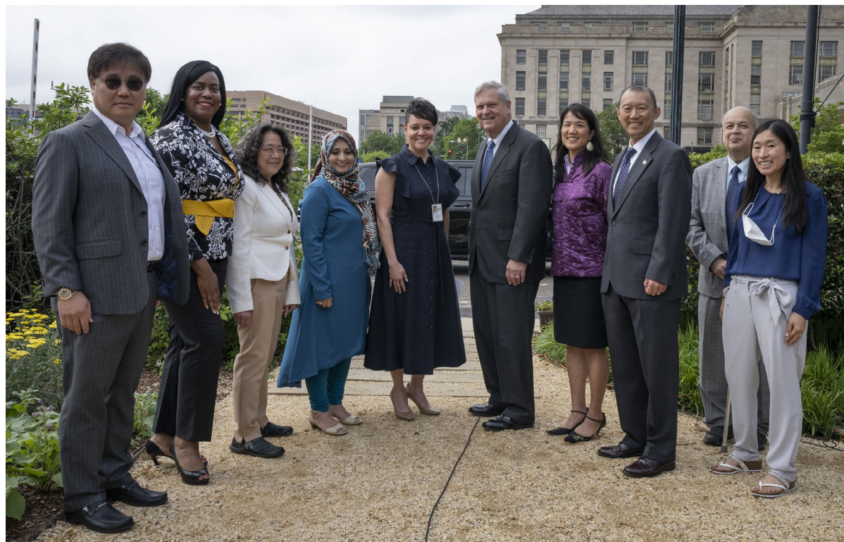
Agriculture Secretary Tom Vilsack and others at an Asian American and Native Hawaiian and Pacific Islander (AANHPI) event in the Peoples Garden in Washington, DC.

As Secretary Vilsack has emphasized, “most of the work of building and supporting the economy is done by small business owners”—but small businesses have long faced obstacles to participating in federal procurement. USDA is committed to removing those barriers, and has made significant progress implementing initiatives like USDA’s Procurement Forecast webpage , which allows small businesses to easily search and filter USDA procurement forecasts, identify the opportunities most relevant to them, and download the results for easy reference. Agency-level initiatives are key as well and are described at https://www.usda.gov/equity/activities .