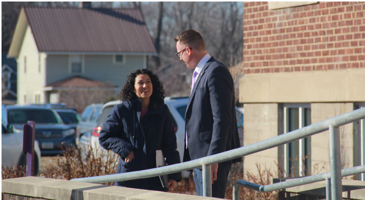
Xochitl Torres Small, currently USDA Deputy Secretary and formerly Rural Development Under Secretary, toured Mahaska Health, a hospital in Oskaloosa, Iowa, and participated in a roundtable discussion to highlight USDA investments in rural healthcare.

USDA's mission is: "To serve all Americans by providing effective, innovative, science-based public policy leadership in agriculture, food and nutrition, natural resource protection and management, rural development, and related issues with a commitment to delivering equitable and climate-smart opportunities that inspire and help America thrive." To accomplish this mission, we must, together, build and maintain public trust and confidence among USDA stakeholders that this truly is, in the words of President Lincoln, the "People's Department". We must: (1) identify and root out systemic discrimination in USDA programs; (2) ensure equitable access to USDA programs and services for all communities, including by removing barriers to access and working to repair past mistakes that have resulted in economic, social, and racial disparities; and (3) promote nutrition security, a healthy environment, and the opportunity for a good life for every person, in every community in America.