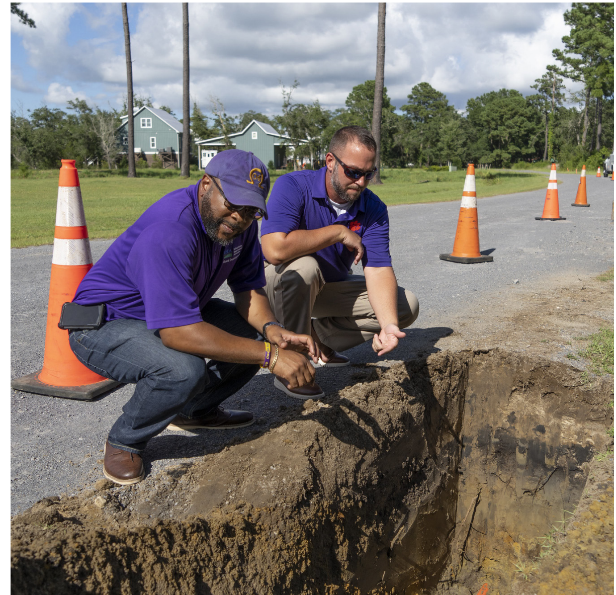
Home Telephone Company, Inc employees perform directional drilling to insert underground fiberoptic cables, part of the U.S. Department of Agriculture USDA Rural Development RD ReConnect 50/50 grant.

of their application using their assigned Grants.gov tracking number. This new look-up tool offers an easy, convenient way for prospective grantees to view the status of their applications for any NIFA funding opportunities.