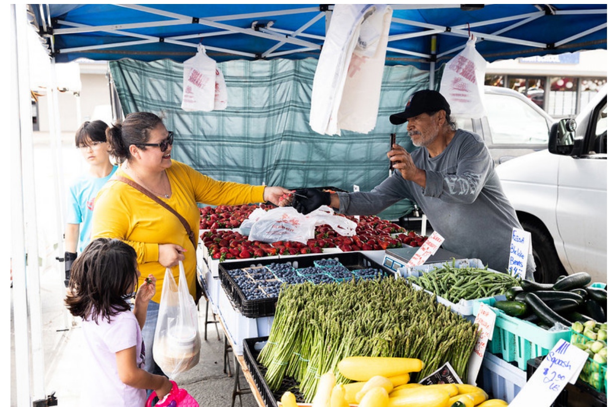
Farmer returns WIC EBT card to WIC shopper at the Santee Certified Farmers Market in Santee, California.

Clean energy for rural America. Rural Development rolled out two programs made possible by the Inflation Reduction Act, providing $11 billion in grants and loan opportunities that will help rural energy and utility providers bring affordable, reliable clean energy to their communities across the country, support new jobs and healthier communities. This represents the single largest investment in rural electrification since President Franklin D. Roosevelt signed the Rural Electrification Act into law in 1936. Also, through the passage of the Inflation Reduction Act, the Rural Energy for America Program (REAP) has been provided over $2 billion for renewable energy systems and energy efficiency improvement grants for agricultural producers and rural small business owners.