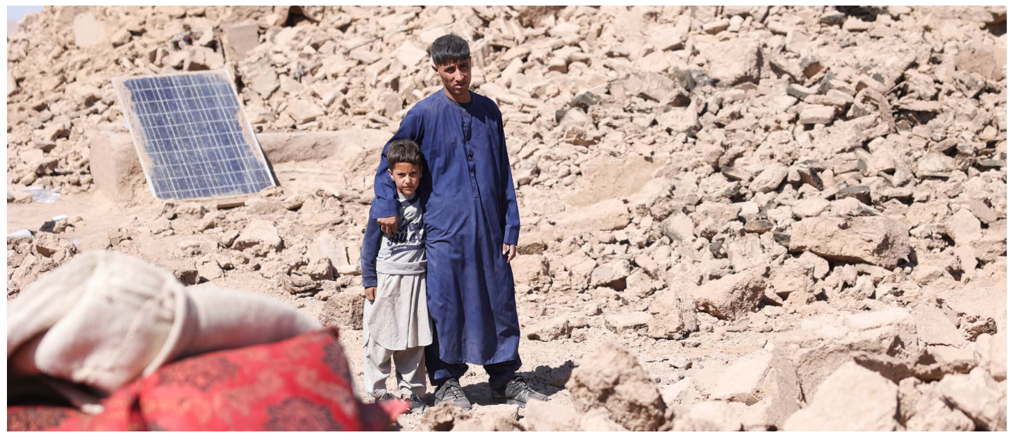
Earthquake in Herat province, Afghanistan.

An estimated 114,000 most affected people are in urgent need of life-saving health assistance following series of earthquakes in western Afghanistan between 7 and 15 October. The WHO-led health sector appeals for <u>US$ 7.9 million</u> to ensure affected communities will be provided with essential health services in the next six months. For up-to-date information on the situation following the earthquakes which hit the Herat region in October 2023, click <a href="here">here</a>.