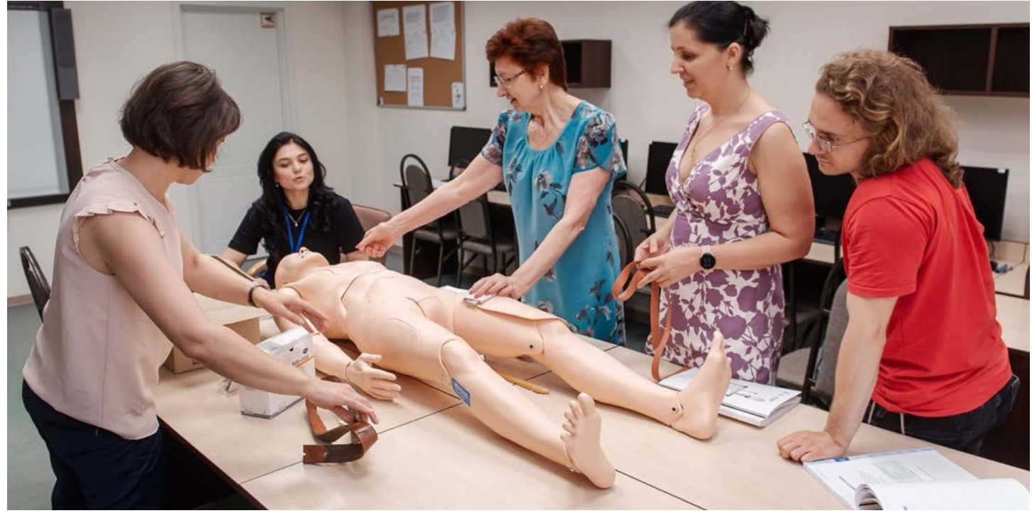
Health workers participate to the skill station in the hospital simulation laboratory during the BEC course.

Since the start of the war in Ukraine in February 2022, hundreds of thousands of refugees fled over the border into the Republic of Moldova, leaving the country to face a prolonged health emergency. As of October 2023, around 100 000 refugees are remaining in the country, many of whom are requiring health care.