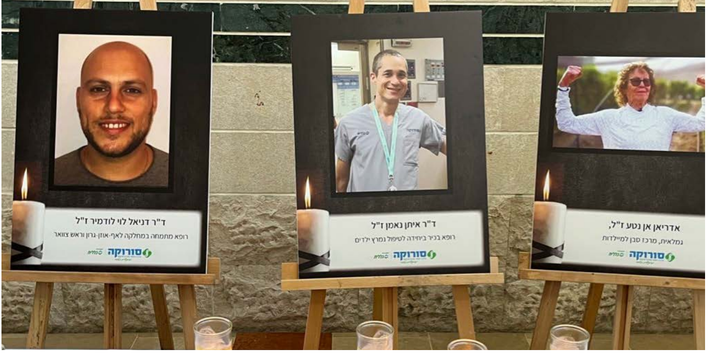
Victims of the 7 October 2023 attacks.

On Saturday 7 October 2023, Hamas launched thousands of rockets toward Israel and breached through the perimeter fence of Gaza at multiple locations. Members of armed groups entered into Israeli towns, communities, and military facilities near the Gaza Strip, killing and capturing Israeli forces and civilians. The Israeli military declared "a state of war alert," and begun striking targets in the Gaza Strip. Over 1200 people were left dead after the attacks, and over 5400 persons have been injured during and following the initial October attack, including due to ongoing hostilities affecting communities across Israel. Due to the direct impact of the attack on civilians, hundreds of thousands of Israelis were evacuated from southern and northern parts of the country.