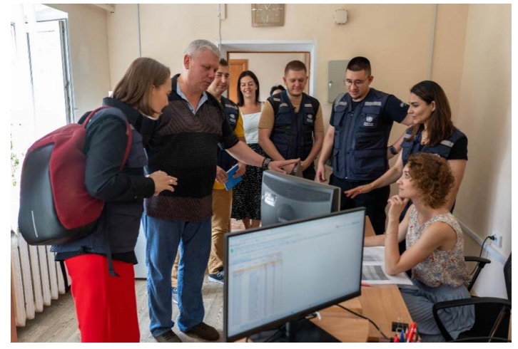
WHO supports medical statistics information and analytics centers in Ukraine by providing IT equipment and training for medical staff in the six most war-affected regions.

To ensure accuracy and best inform decision making, HeRAMS data needs to be verified continuously. In Ukraine, the data verification work will be undertaken by a third-party monitoring group in coordination with WHO on a randomly selected sample of 528 health care facilities – approximately 30% of all previously assessed health facilities. Approximately half of the facilities that will undergo the verification process will be multi-profile health facilities offering specialized care while the remainder will be primary health care centers from both urban and rural areas. Once available, the verification results will be leveraged to enhance the quality of the data collected across Ukraine. They will also form the foundation for data quality workshops engaging HeRAMS focal representatives.