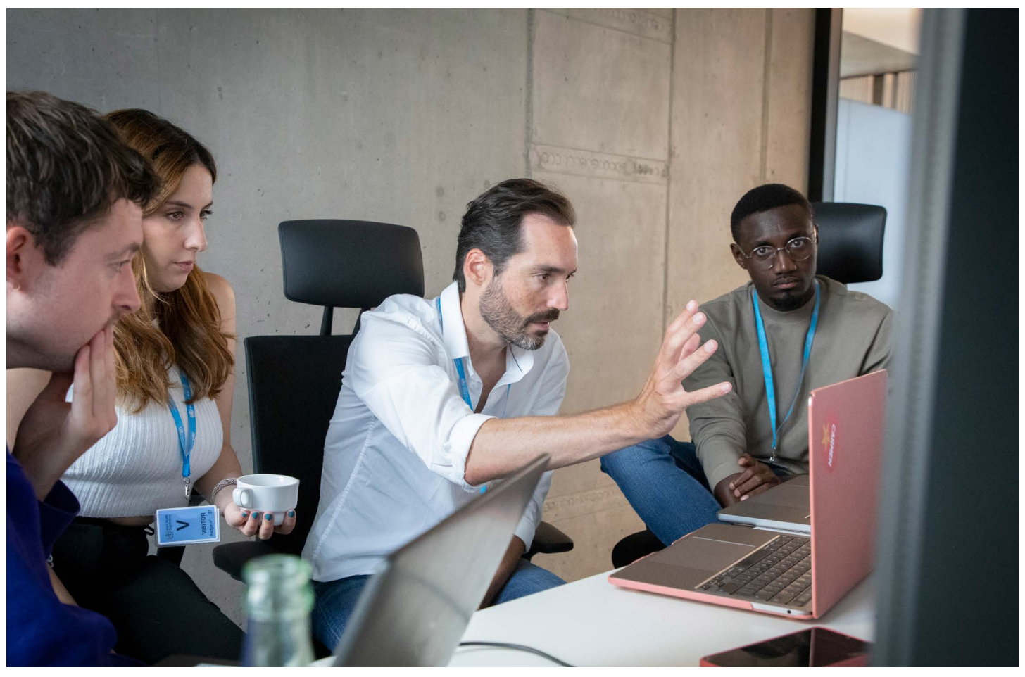
Participants co-creating analytical pipelines.