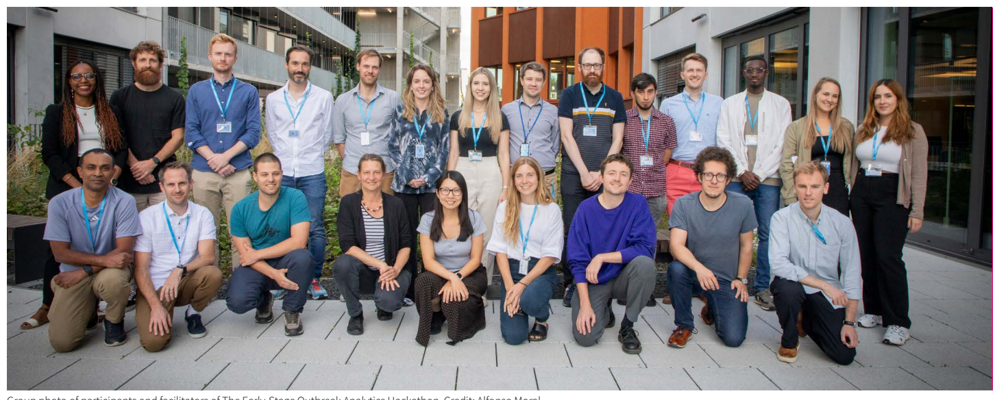
Group photo of participants and facilitators of The Early-Stage Outbreak Analytics Hackathon.

To manage outbreaks effectively, every second counts. To consolidate and analyse data to inform decision-making – such as data on the severity or transmission rate of a disease -, the availability of ready-to-use analytical tools can save critical scale-up time and strengthen early outbreak response efforts.