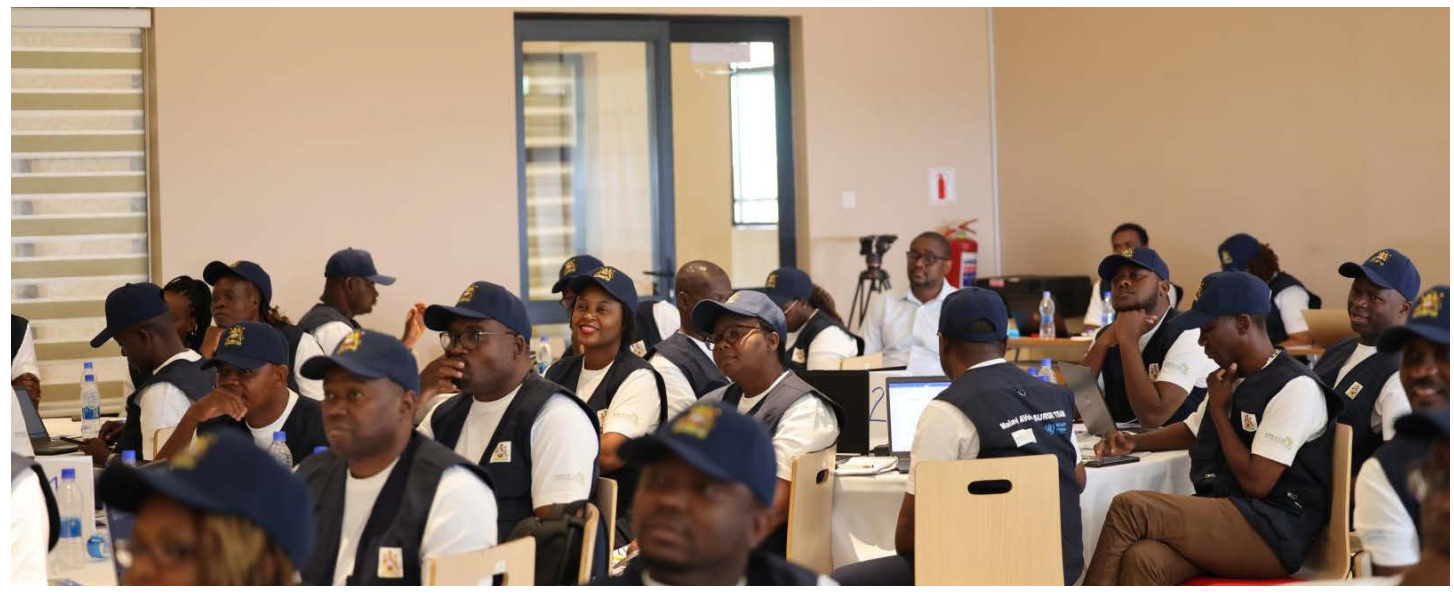
AVoHC-SURGE taining in Mponela, Malawi.

On 9 October 2023, the Ministry of Health in Malawi with support from WHO and the Africa Center for Disease Control and Prevention (CDC) launched the first training for frontline responders, which is aimed at enhancing response capacities for health emergencies and disasters in Malawi and beyond.