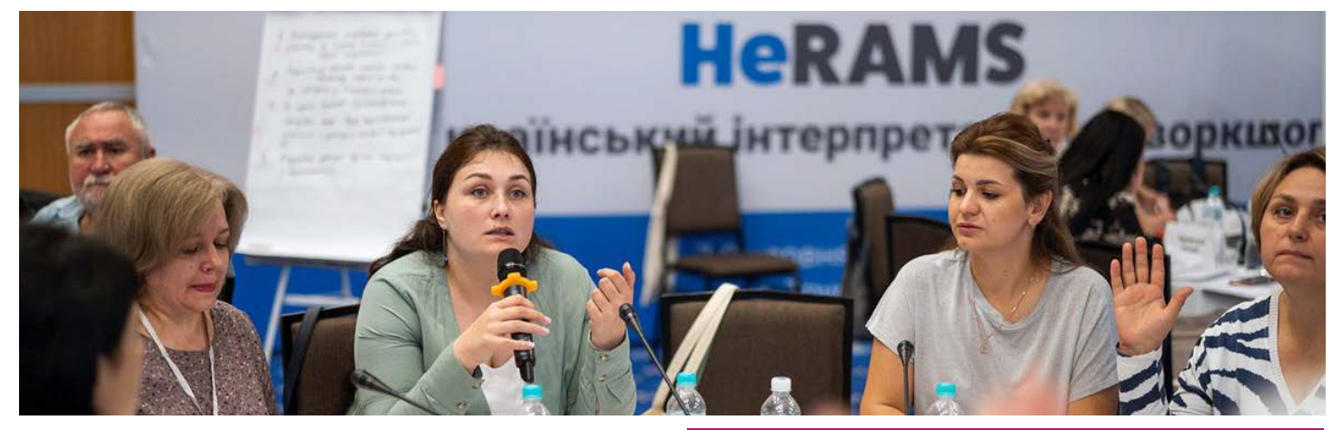
WHO organized a HeRAMS workshop in Ukraine.

The Health Resources and Services Availability Monitoring System (HeRAMS) initiative aims to provide decision-makers and health stakeholders with vital and up-to-date information on the availability and accessibility to essential health resources and services, and help them identify gaps and determine priorities for intervention. HeRAMS can be rapidly deployed and scaled to support emergency responses as well as routine health information systems, ensuring continuity between emergency and response, health systems strengthening and universal health coverage. As of September 2023, HeRAMS is deployed in 25 countries across the world. HeRAMS has been deployed in Ukraine since November 2022, to help monitor overall heath system functionality, including potential damage to infrastructure and basic amenities, populations accessibility to essential health resources and services as well as barriers impeding service delivery.