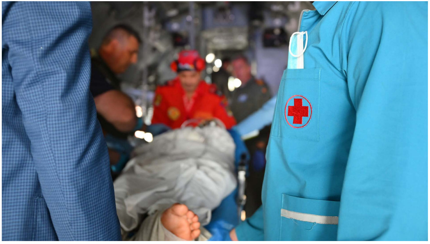
Medical evacuation of burns survivors in Yerevan, Armenia.