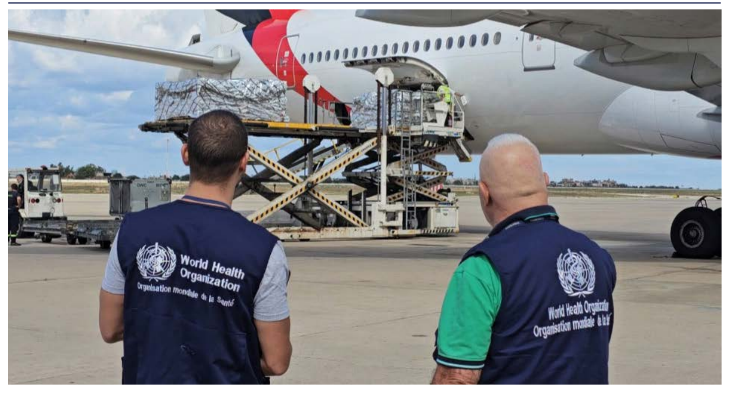
WHO delivers medical supplies to Lebanon as violence in the occupied Palestinian territory intensifies.