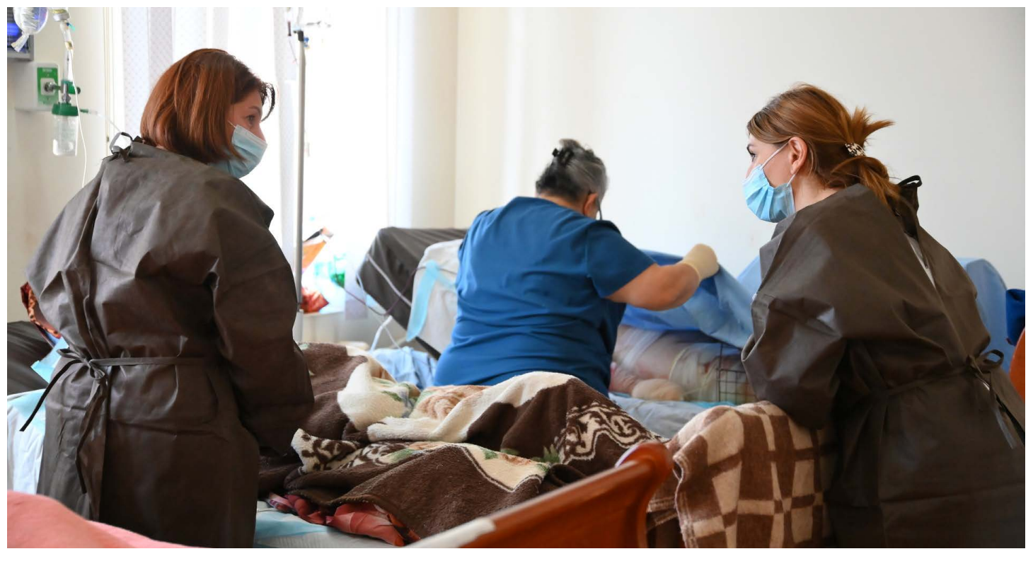
WHO\text{-}trained\ psychologists\ providing\ mental\ health\ support\ to\ burns\ patients.\ Credit:\ WHO/Spartak\ AVETISYAN

Since September 2023, WHO has been supporting the Ministry of Health of Armenia with the health response for refugees from the Karabakh region. The UN estimates <u>US$ 97 million are needed to provide urgent humanitarian aid and protection to refugees and host communities until March 2024</u>, out of which US$ 10.8 million are needed for health. For more information, click here.