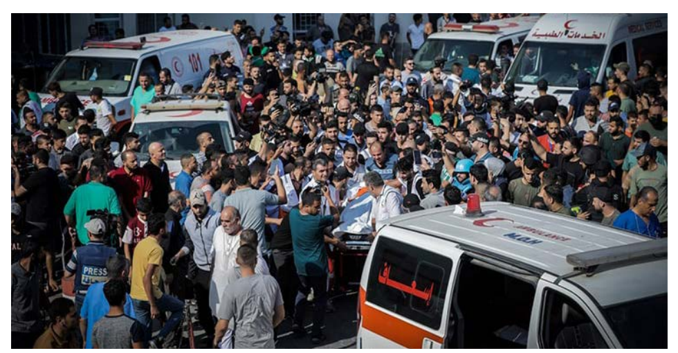
Hospitals in Gaza are at a breaking point.

Since 7 October 2023, the escalating hostilities in Israel and the occupied Palestinian territory has taken a toll on the physical and mental health of civilians. As of 14 November 2023, 1200+ deaths, 5400 injuries, 239 hostages and 33 attacks on health care have been reported in Israel. 11,500 deaths and 29,000 injuries have been recorded in Gaza. 195 deaths and 2625 injuries have been reported in the West Bank. A total of 273 attacks on health have been reported in the occupied Palestinian territory.