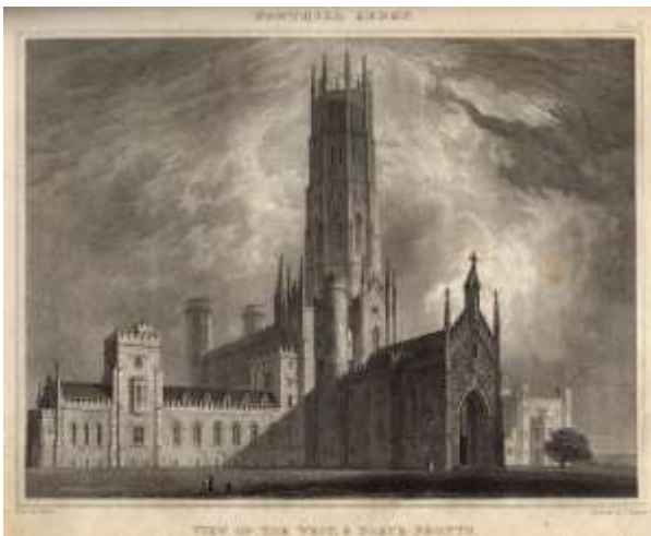
Fonthill Abbey, built by William Thomas Beckford (click on image to go to BL's digital galleries for more information)