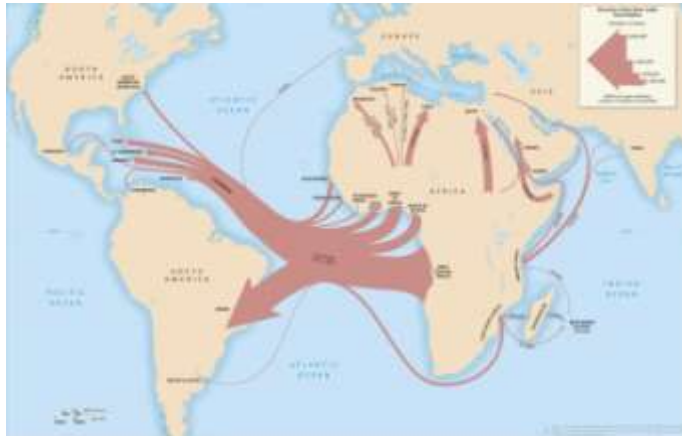
The Slave Trade, from the Legacies of British Slave-ownership exhibition, 'Slave-owners of Bloomsbury'.

The colonial slave system was structured around the 'triangular trade' that saw British manufactured goods exchanged for slaves along the West Africa coast, to be shipped to the Caribbean where tropical cash crops were loaded for sale in Britain. Between the 15 th and 19 th centuries when the Atlantic slave trade persisted it is estimated that at least 12.5 million people were shipped by European nations from Africa to the Americas – at least 1.7 million of whom died during the 'Middle Passage', as the crossing was termed.