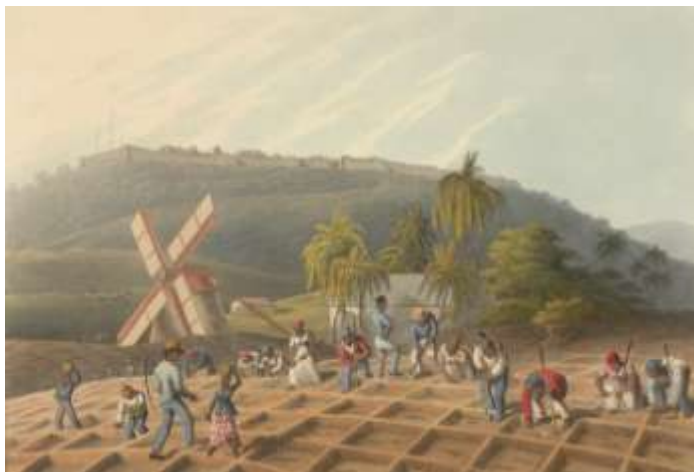
'Planting the Sugar Cane, Antigua', from William Clark, Ten Views in the Island of Antigua, 1823 (click on the image to go to BL's Digital Galleries for more information).

The efforts of this group became increasingly defensive during the late eighteenth century as the public campaign for the abolition of the slave trade gathered momentum. A combination of falling sugar profits, exacerbated by the protracted period of war from 1776 until 1815, and public resentment at the incongruity between rising sugar prices on the one hand and the perceived luxuriant wealth of returning planters on the other, left the West Indian lobby increasingly beleaguered. A hard fought rear guard action delayed the abolition of the slave trade during the 1790s and won a few