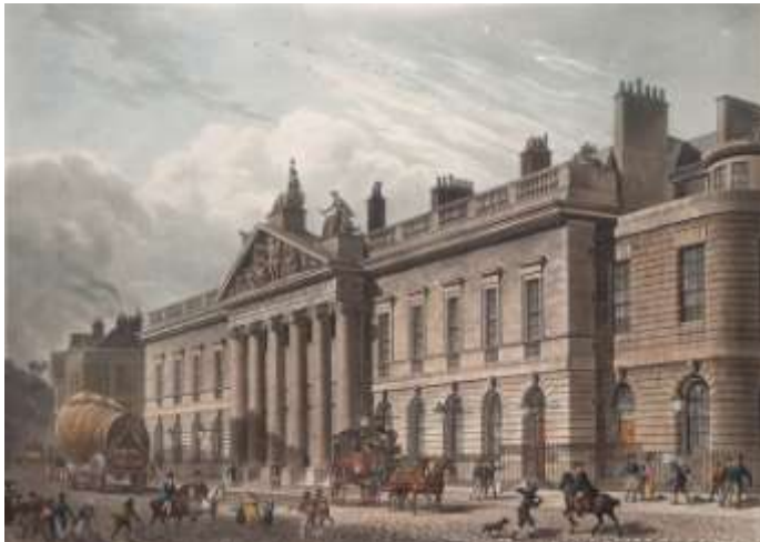
View of East India House, Leadenhall Street, London, 1817 (click on the image to go to BL's digital galleries for more information).

the century the British presence in India was transformed from commercial traders into 'conquerors and rulers', whose power 'was to engulf the Indian subcontinent.' 9 Victory at the Battle of Plassey in 1757 set in motion a period of aggressive expansion that led in 1765 to the British assuming direct rule over the province of Bengal. This acquisition alone extended EIC control over twenty million people, provided £3 million a year in revenue and proved the catalyst for similarly far-reaching expansion in southern India around Madras (present-day Chennai) and in the west from Bombay (present-day Mumbai). 10 In all three 'Presidencies' – Bengal, Madras and Bombay – EIC armies fought both local rulers and European rivals in an attempt to secure British interests.