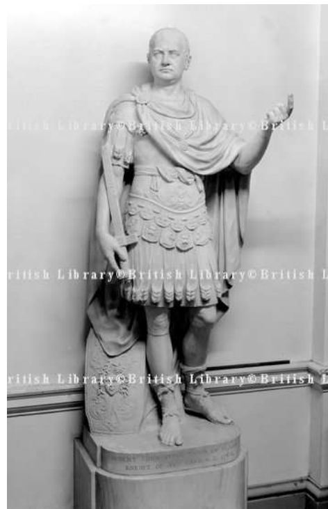
Robert Clive, 1st Baron Plassey (1725-1774) Governor of Bengal (click on image to go to BL's Digital Collections for more information).

Appointments were tightly controlled through the patronage system, with all recruits having to be nominated by a sitting director. Without access to persons of influence or a family association with the EIC it was increasingly difficult to obtain an appointment. The appointment system helps to explain why some families established such a long-lasting and self-perpetuating association with careers in India as '[m]en who had served in India sought election to the Directors and used their patronage to send their sons to India, who became Directors in their turn.' 20 Many EIC families also intermarried constructing complicated networks that supported family ambition within the