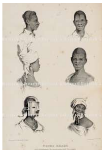
'Negro Heads', from Richard Bridgens, West India Scenery, with illustrations of negro character (c.1836). (Click on the image to go to BL's Digital collections for more information).

Although amelioration had a modifying effect on birth-to-death ratios amongst the enslaved population, it certainly did not create the conditions depicted by many artists and travel writers sympathetic to the slave-owners, who portrayed life on a Caribbean plantation as idyllic. Allusions to the violence and repression imposed upon slaves emerged even in sympathetic accounts of the slave system, as captured by the illustration from Richard Bridgens' 1830s publication, West India Scenery, with illustrations of negro character, the process of making sugar, from sketches taken during a voyage to, and residence of seven years in, the island of Trinidad . The uncomfortable juxtaposition of smiling 'negro heads' above depictions of slaves wearing a mask of metal – either as punishment or to prevent the practice of 'dirt eating' – and an iron collar, highlights the complacent indifference to violence that underpinned the strategies of racialised "othering" deployed to endorse slavery. Even after 1807 the West Indian lobby continued to defend their interests in Britain in a manner that defied any naïve hopes that Caribbean slavery would simply fade away. Abolition did not destroy the sugar trade nor did it represent the final acknowledgement from the British government that the Caribbean had ceased to be economically