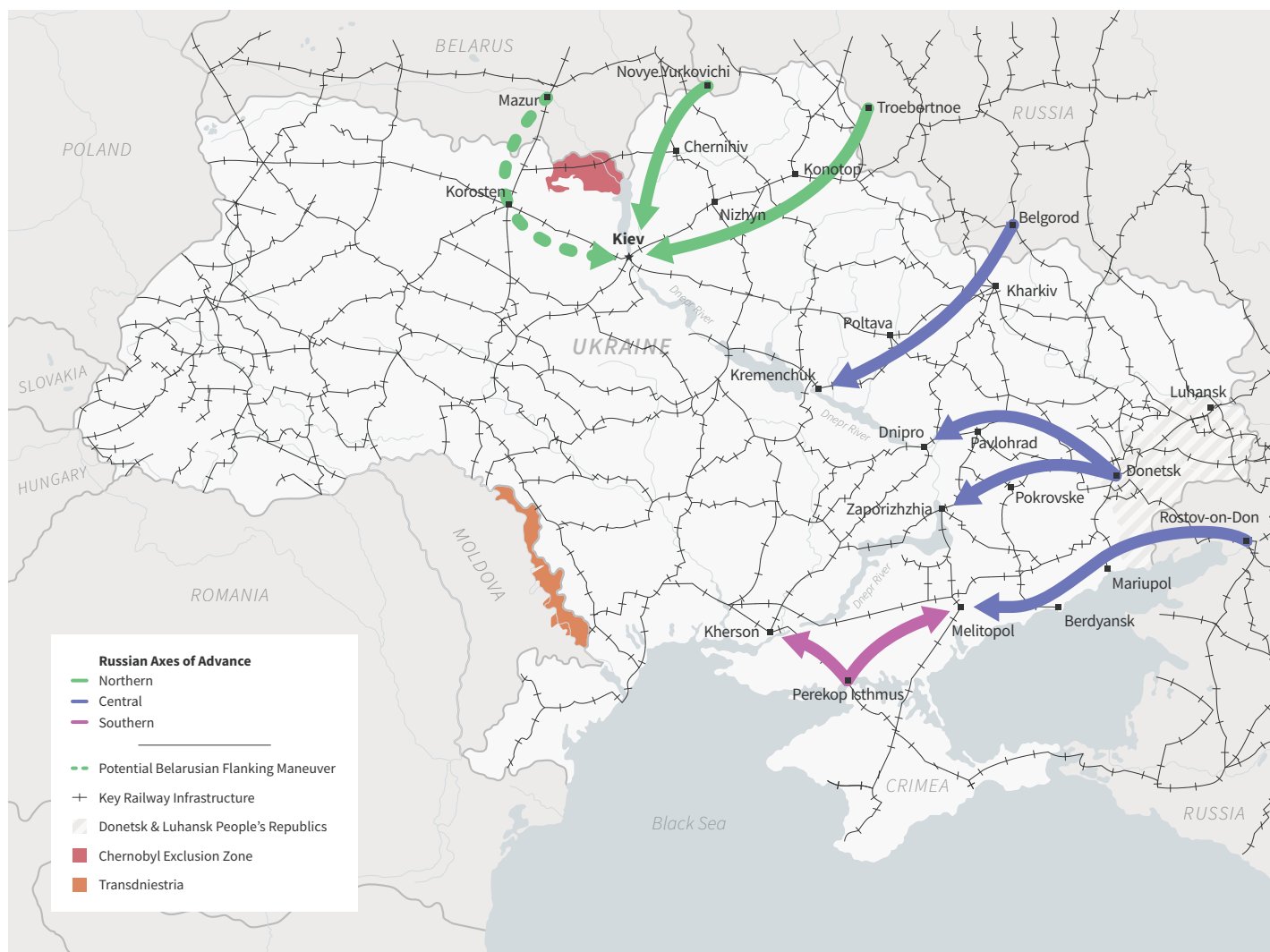
Figure 2a: Russian Seizure of Ukraine up to the Dnepr River