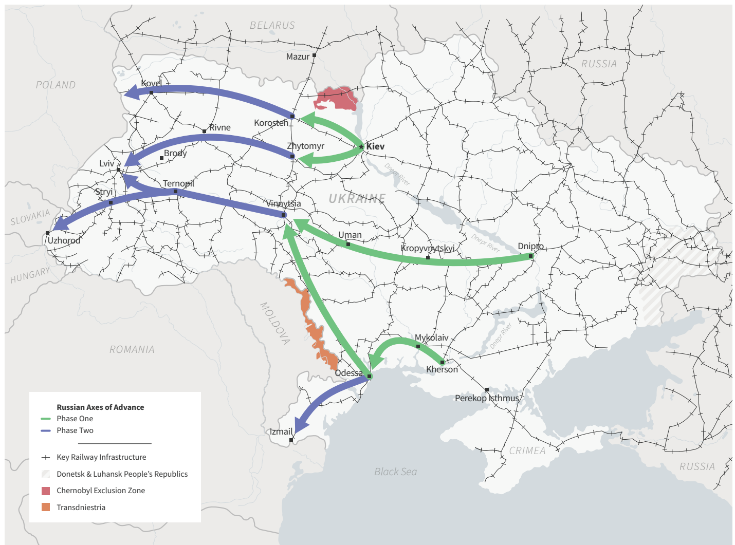
Figure 2c: Russian Seizure of Ukraine past the Dnepr River