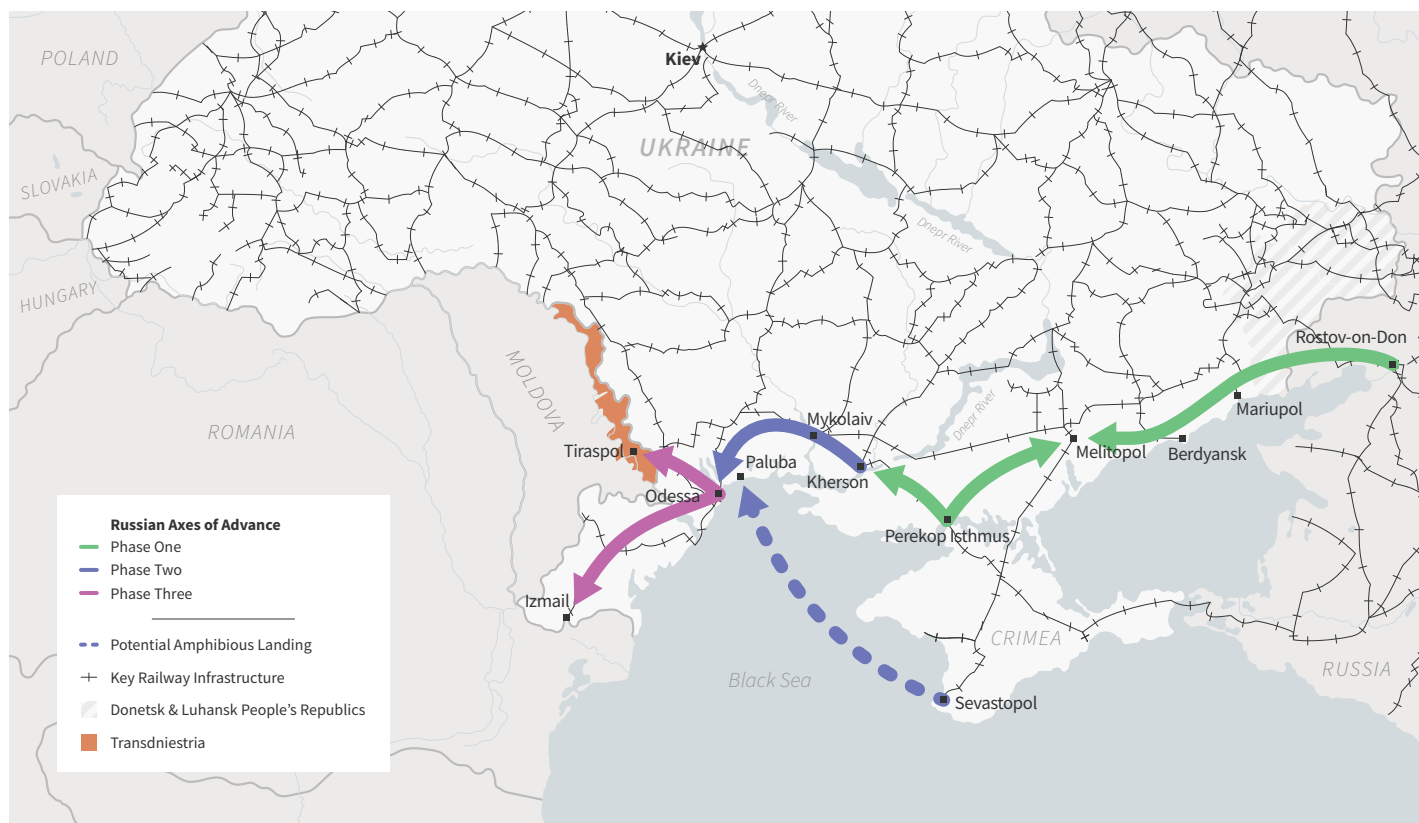
Figure 2b: Linking Russia with Crimea and Transdnier