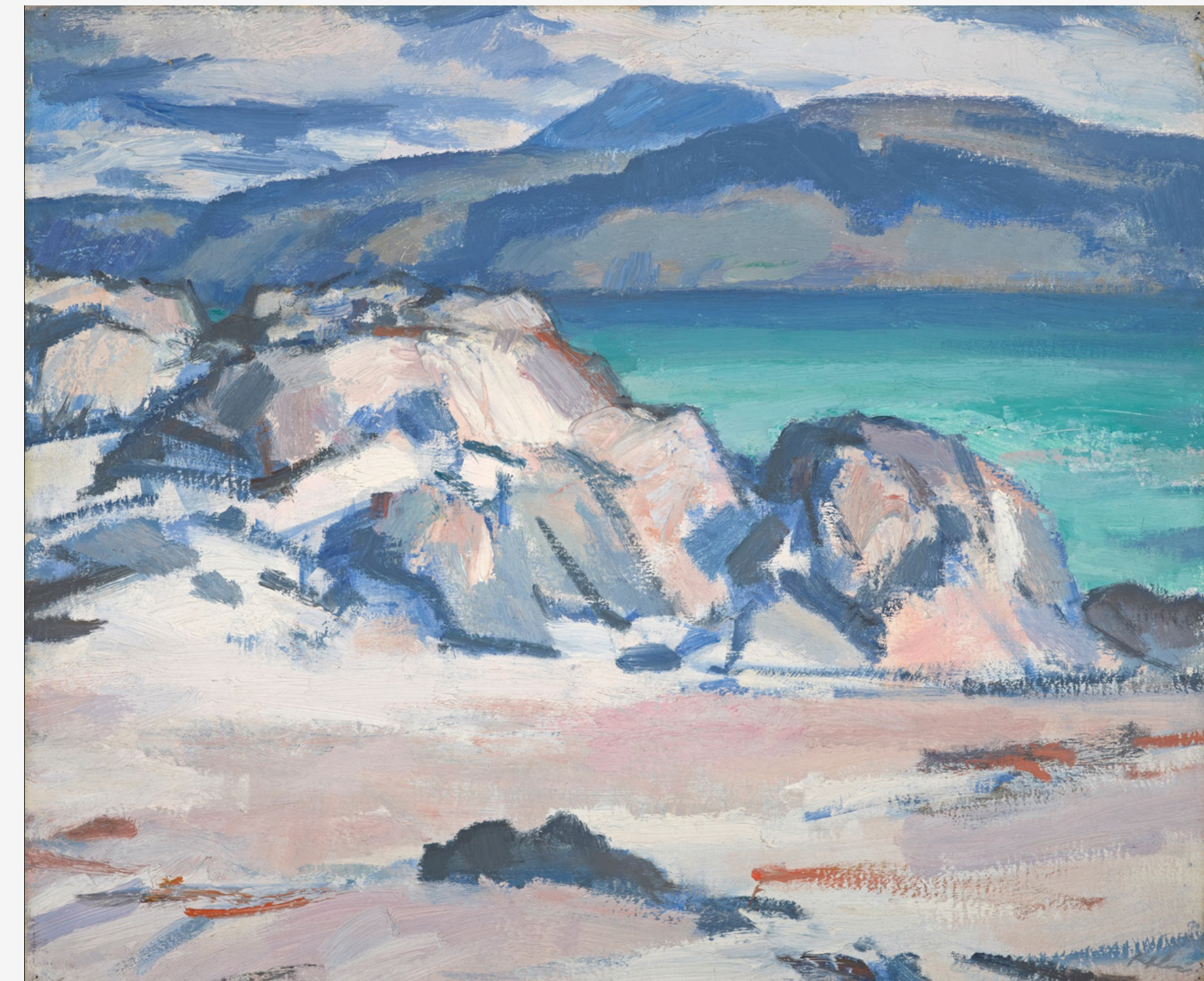
Iona, Mull and Ben More in the Distance by Samuel John Peploe (1871-1935).