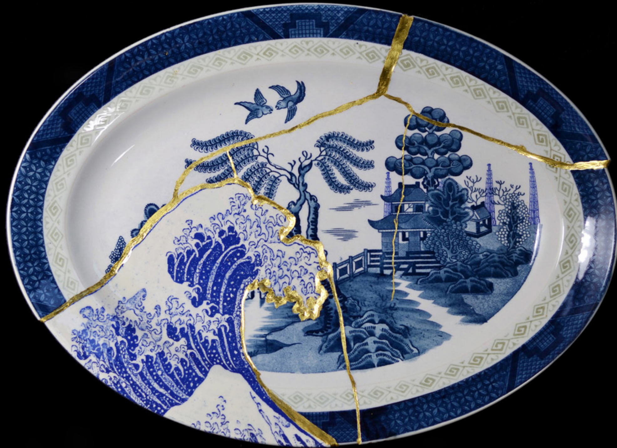
Fukushima No. 8 by Paul Scott (b.1953) © the artist.

‘The Museum Data Service will mean researchers can more easily discover the richness of our local and regional museums across the UK, alongside the collections taken care of by national museums’