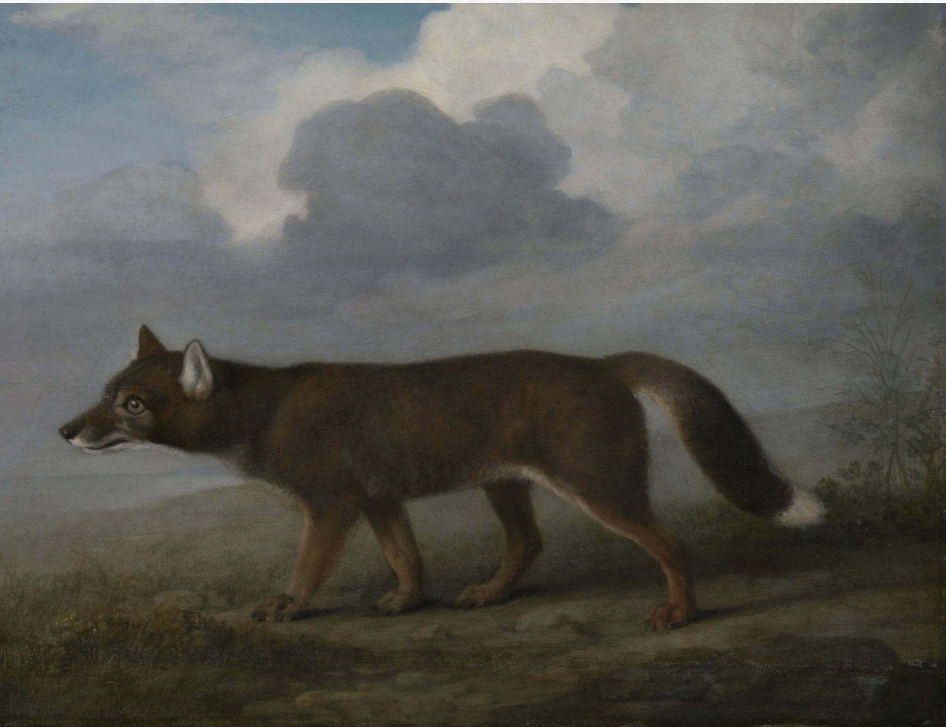
Portrait of a Large Dog (Dingo) (detail) by George Stubbs (1724–1806).

Art UK is, we believe, the largest ever institutional arts partnership put together in the UK. At least 90% of the institutions we work with would not be able to do what we do for them on their own. There are now 3,472 collections on Art UK, with 329 of these being paying Partner Collections.