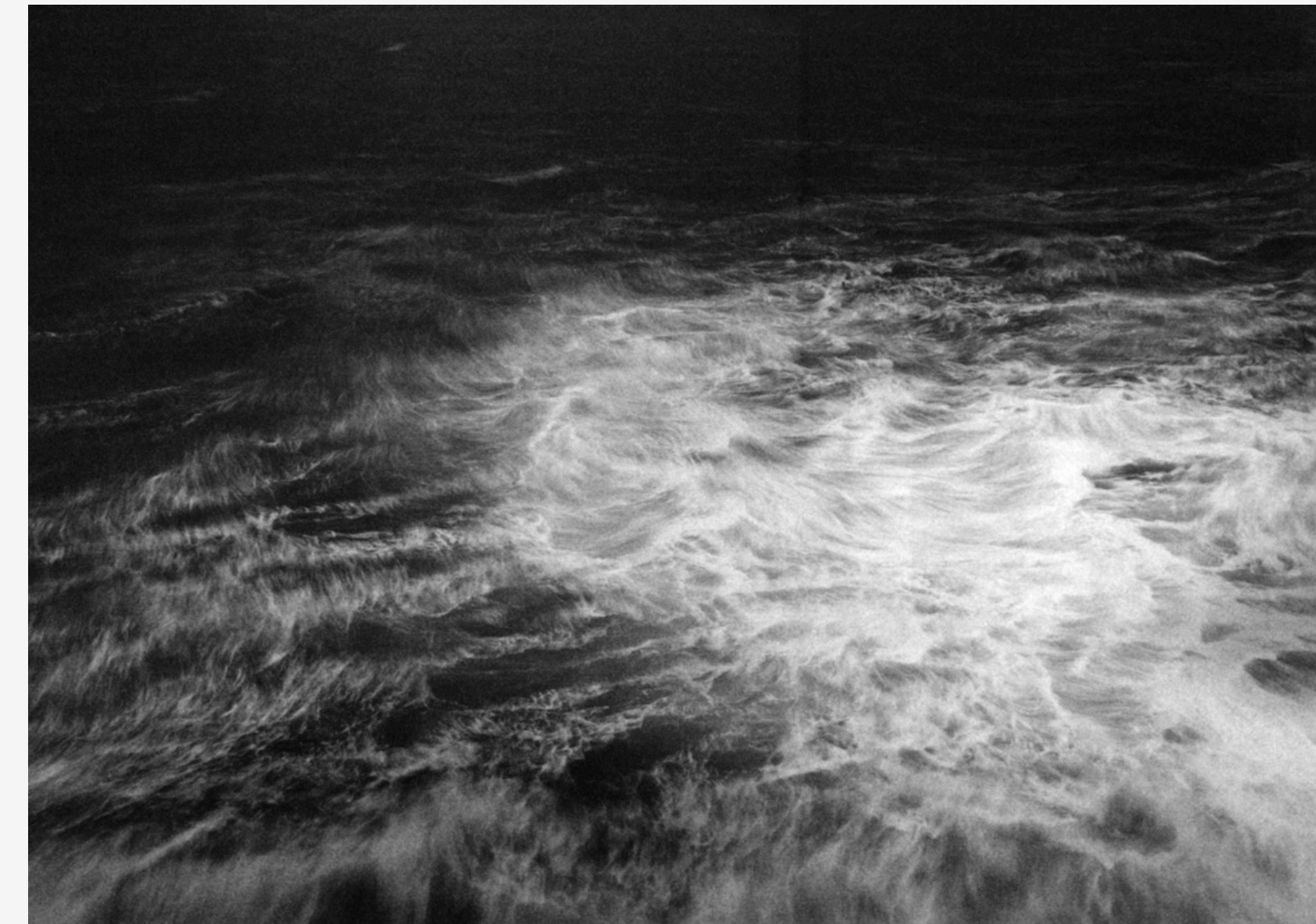
The Swelling of the Sea – Furthest West – The North Atlantic Ocean by Thomas Joshua Cooper (b.1946)