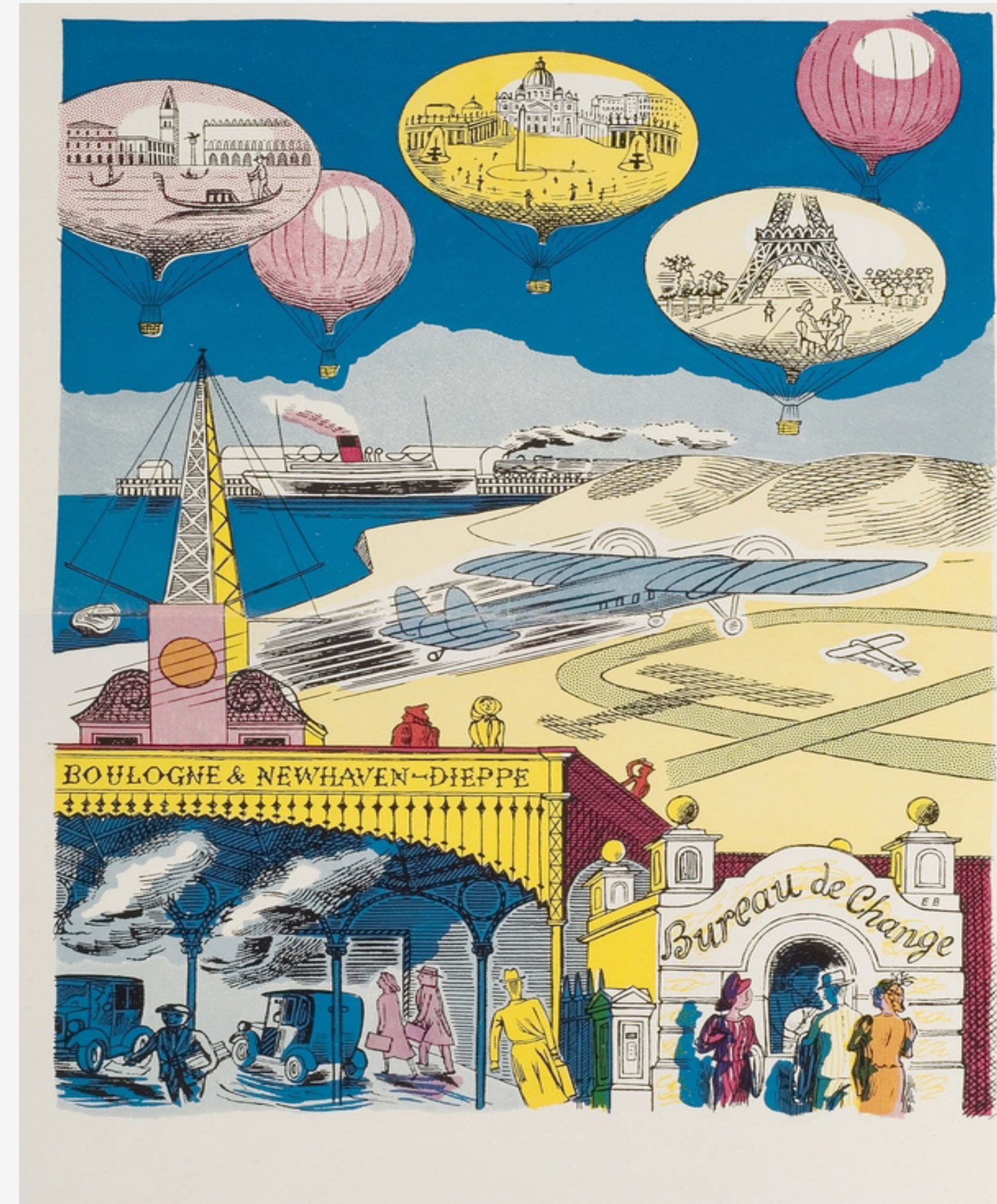
Holidays Abroad by Edward Bawden (1903–1989) © the estate of Edward Bawden. Image credit: The Higgins Bedford