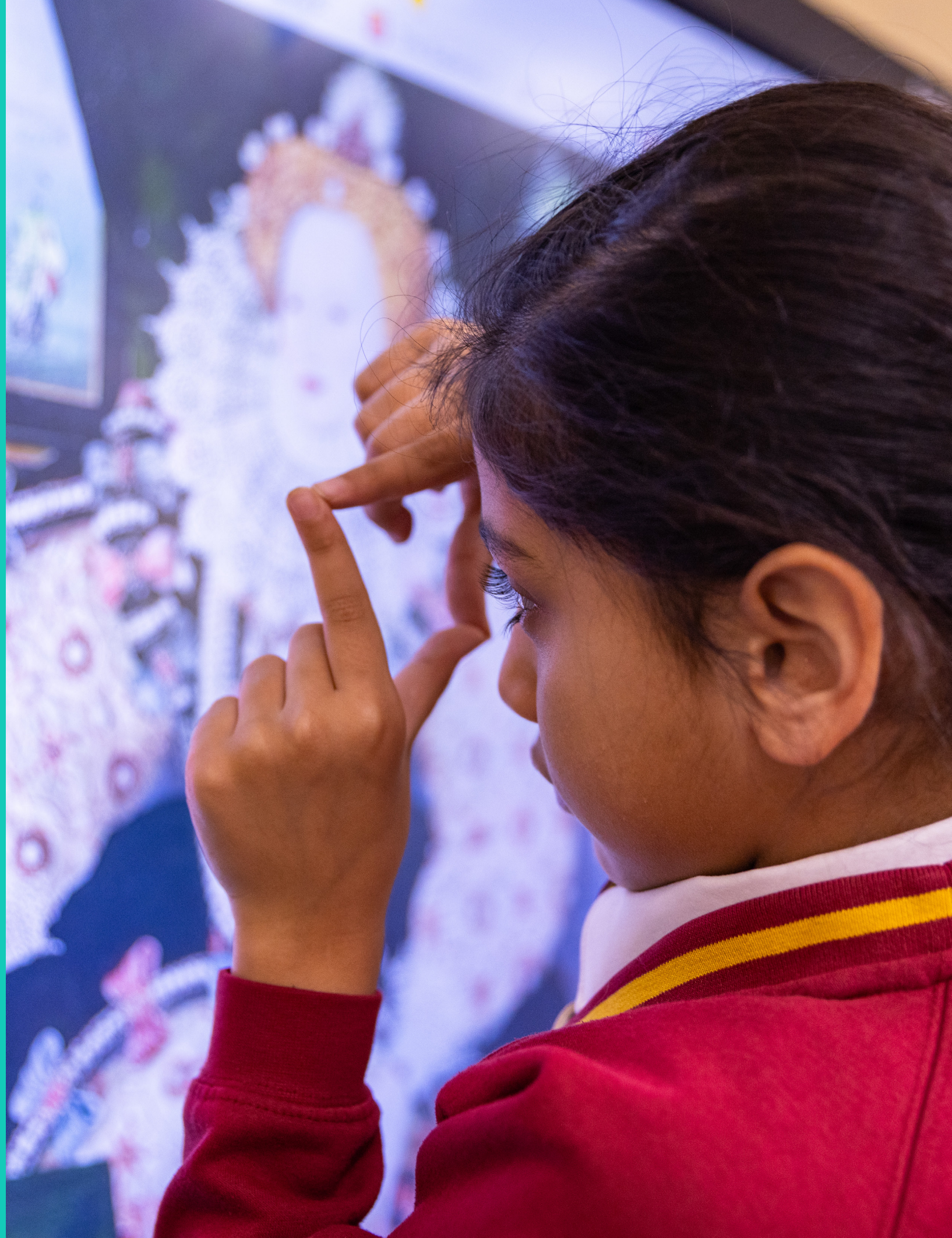
A pupil at Belgrave St. Bartholomew's Academy.