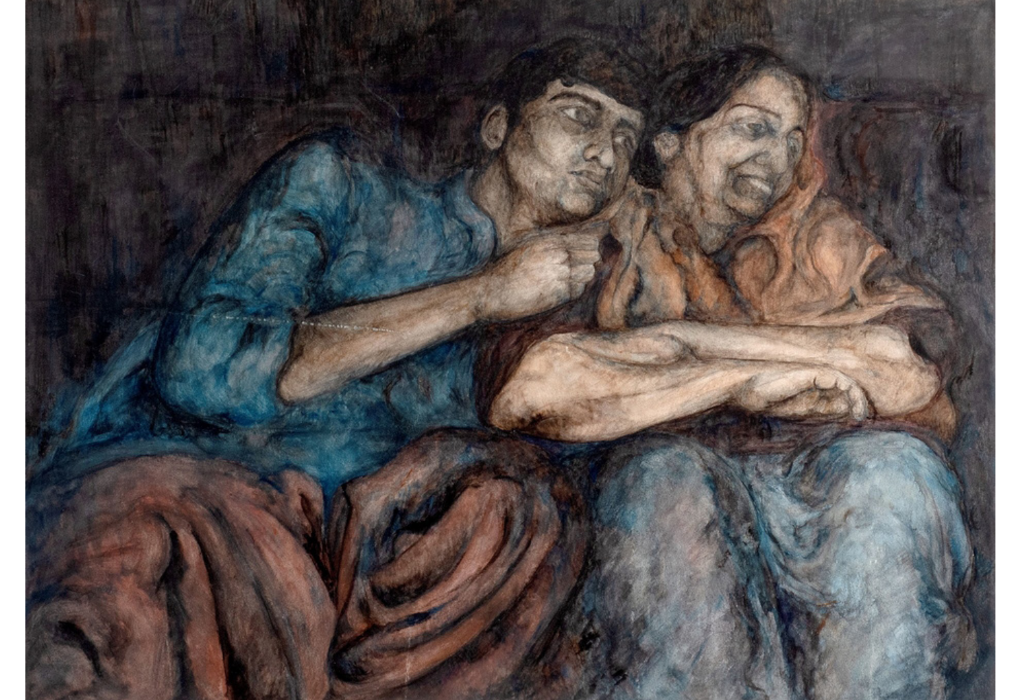
The Contrast by Nasser Azam (b.1963) © the artist. Image credit: Ben Uri Collection