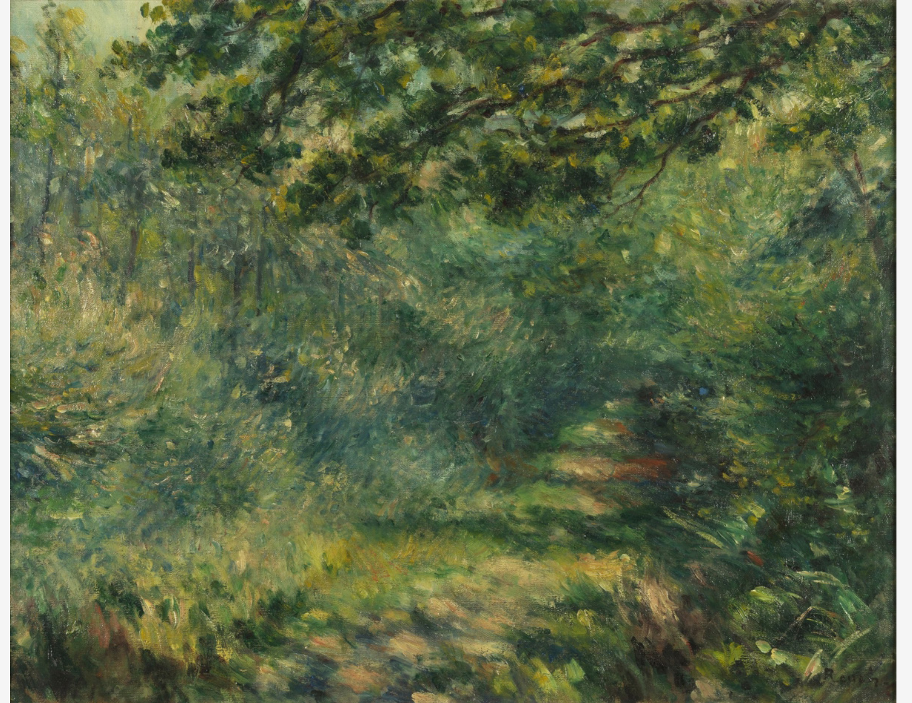
L'allée au bois (The Woodland Path) by Pierre-Auguste Renoir (1841–1919).

'Art UK is an indispensable resource. Curations are a wonderful feature, virtually extending engagement with exhibitions. Art Detective encourages knowledge sharing and debate, plugging informational gaps and reanimating works through reappraisal.'