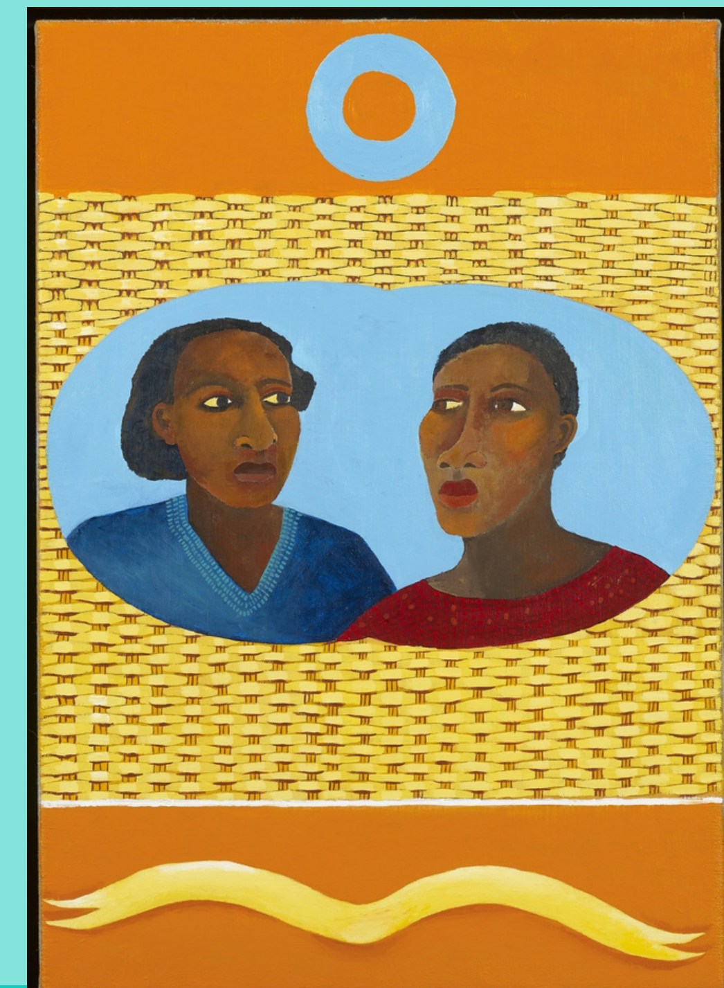
Dream Team by Lubaina Himid (b.1954)