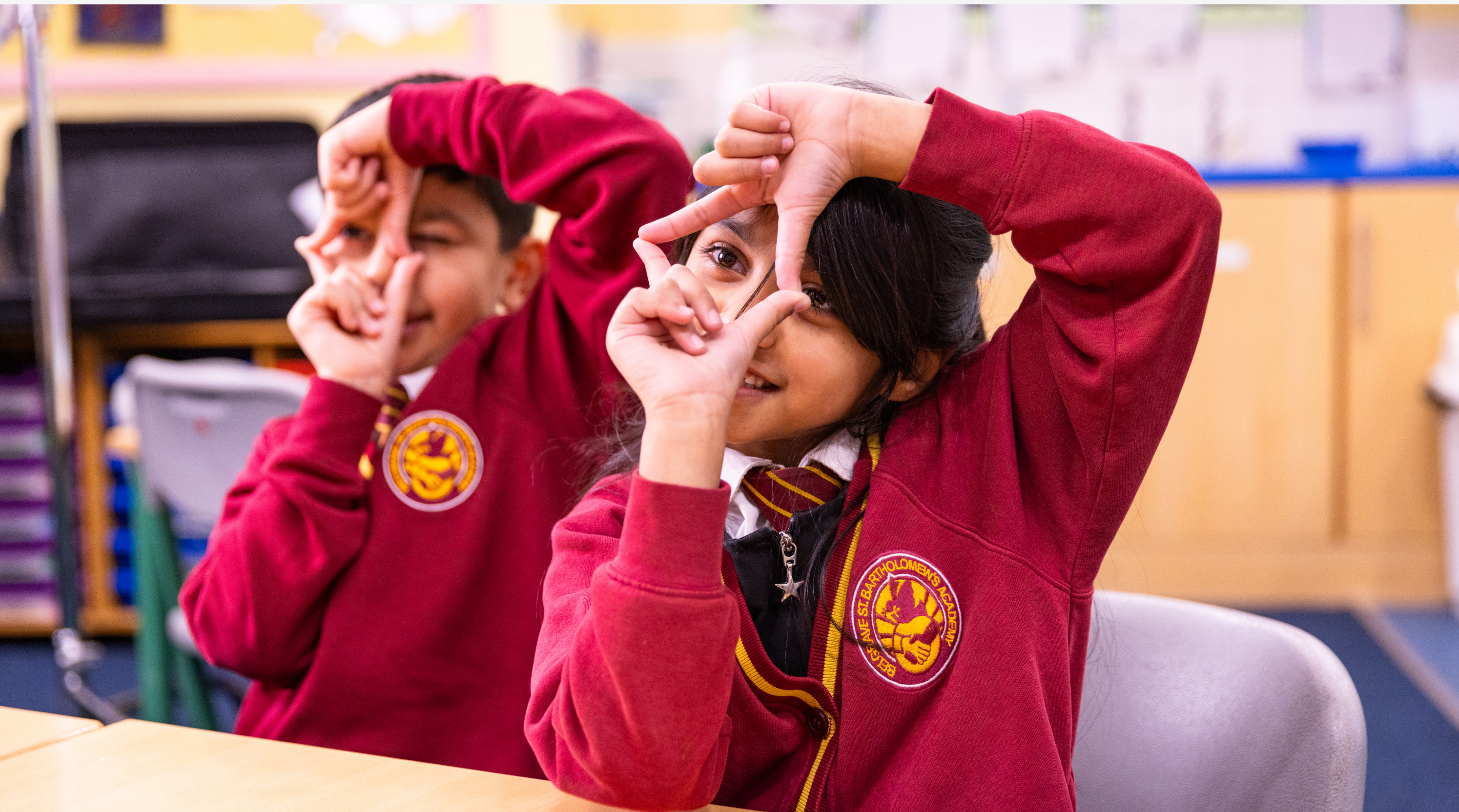
Pupils at Belgrave St. Bartholomew's Academy.

'Watching my pupils' enthusiasm in the classroom grow after The Superpower of Looking lessons has been inspiring. For children who may never have been to a gallery before, it's been transformative'