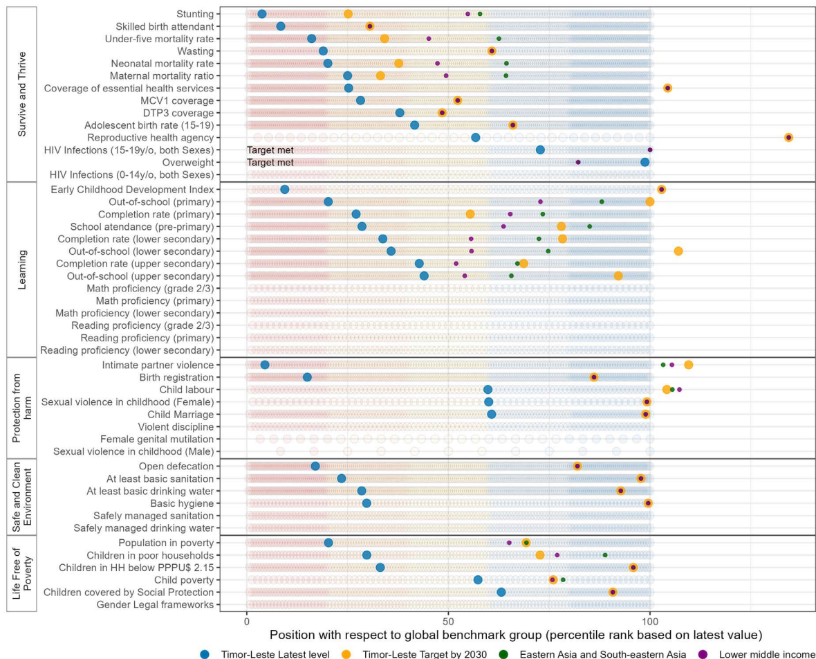
Figure 3. Benchmarking where the country is and where it aims to be by 2030

These findings have broad implications: first, they illustrate that the expected effort is not uniform across outcome areas (and respective indicators). This indicates that certain outcome areas (and specific results) may require more attention, resources, or effective strategies, highlighting the need for differentiated approaches. The point of this exercise is not to question or challenge the targets chosen but to offer a metric that can help inform expectations regarding the actions required to match these targets. This exercise also shows that for some indicators in some cases countries, the expected effort surpasses that in recorded history.