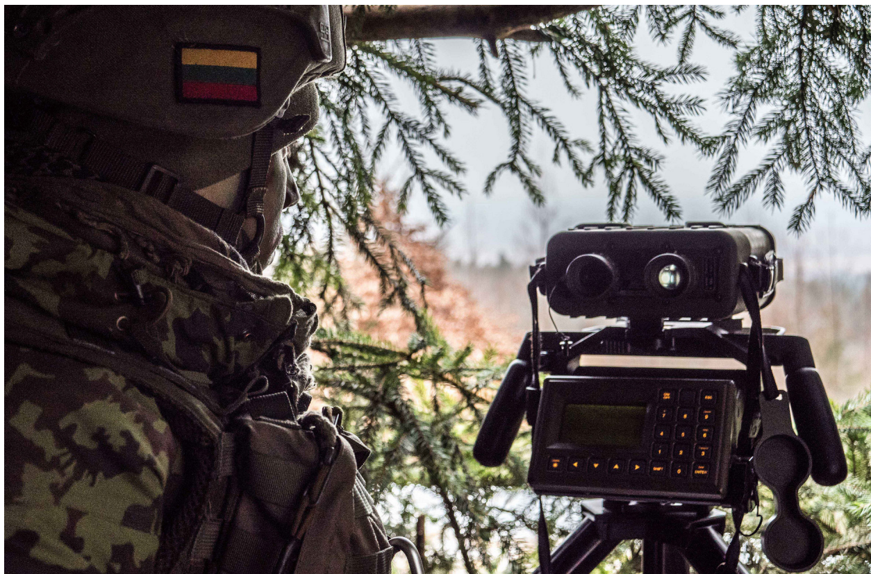
Target observer during Exercise Dynamic Front 2018.

7. Terrorist Attacks: Moscow may use the pretext of pre-empting or responding to terrorist threats, or actual attacks, as well as acts of sabotage against Russia’s infrastructure, to stage a cross-border incursion. Its armed interventions on Georgia’s territory on the pretext of eliminating Chechen jihadists during and after the Second Russo-Chechen War (1999-2002) serve as a precedent. In this scenario, a real or manufactured terrorist attack on Russian or Belarusian territory triggers an armed incursion couched as a “hot pursuit”