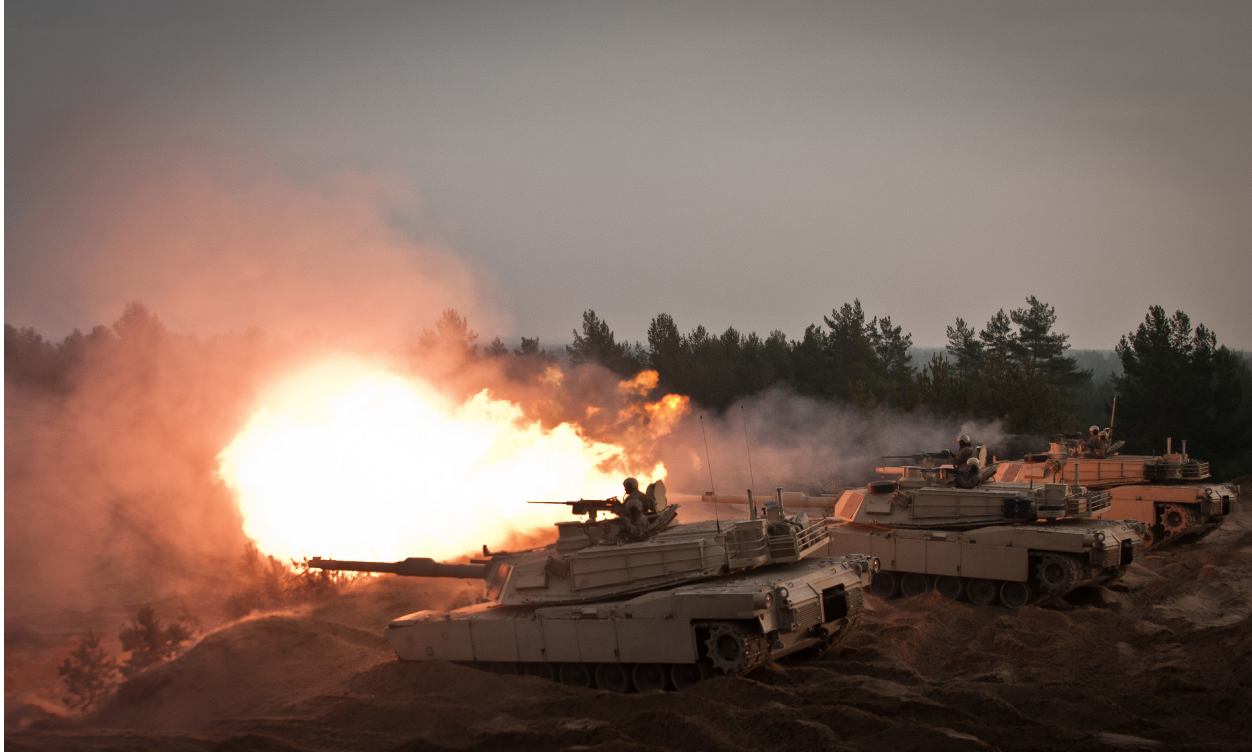
M1A2 Abrams during training in Lithuania.