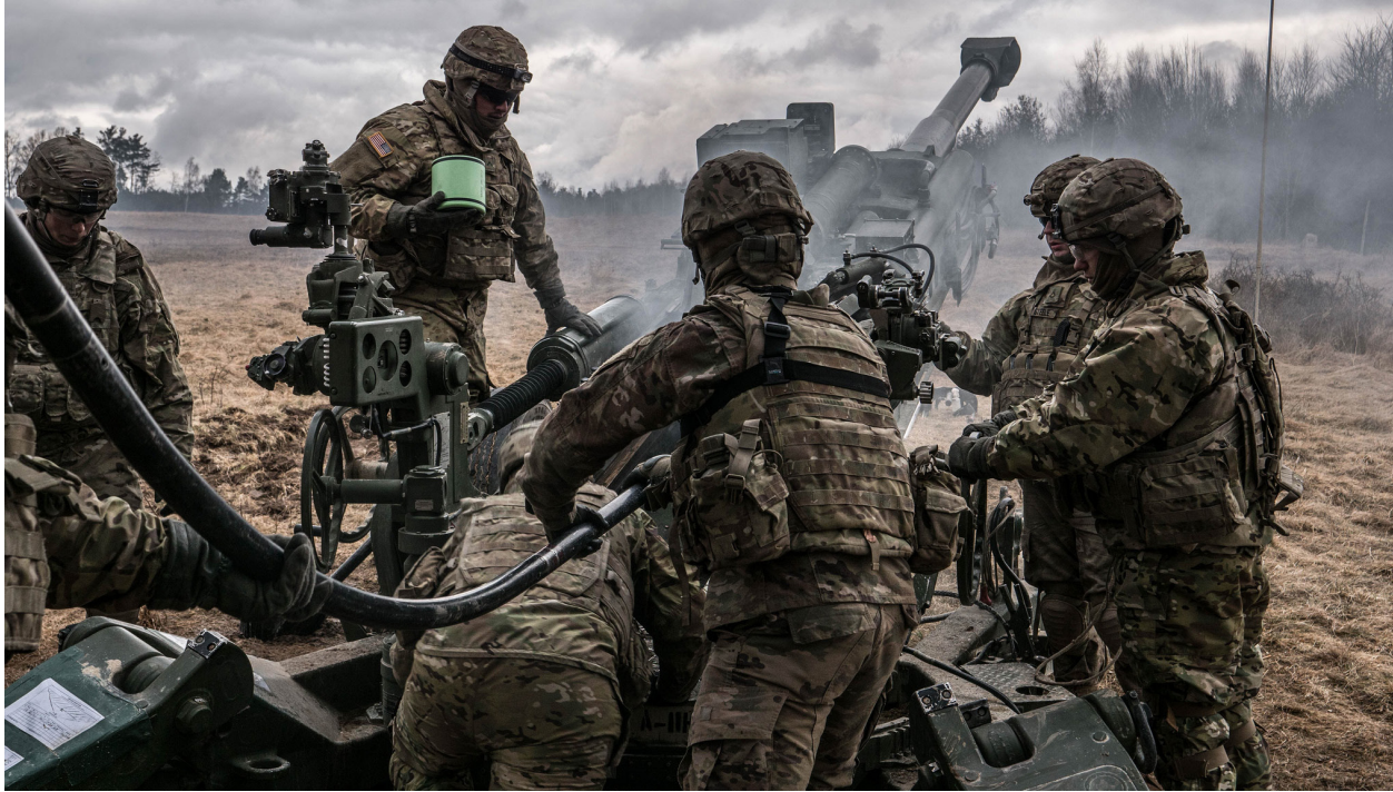
Reloading Howitzer during Exercise Dynamic Front 2018.