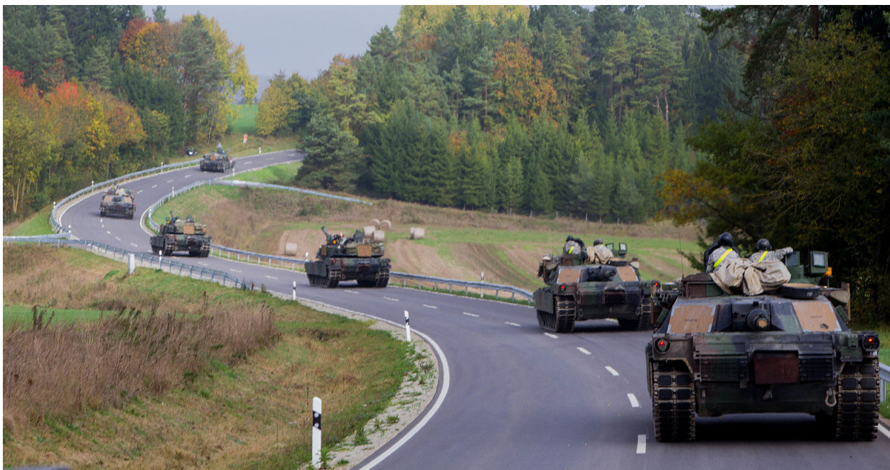
U.S. Army M1A2 Abrams tanks in Hohenfels, Germany.

The overarching problem: Russia’s methods of warfare are changing, but NATO’s organizing strategy and force posture are still moored to Fulda and Cold War conceptions. 17 In the