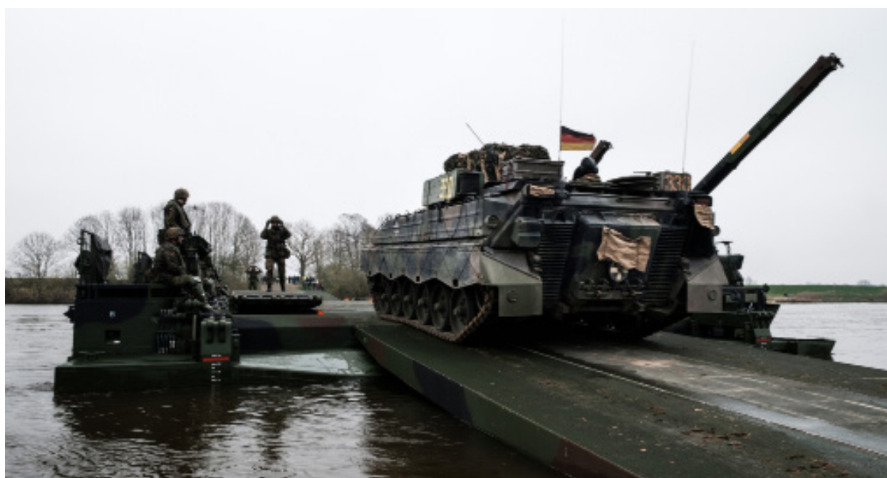
River crossing exercise prepares Germany to lead NATO's VJTF in 2019.

The Suwałki Corridor is particularly vulnerable given the continued, intensified militarization of Kaliningrad and Russia's Western Military District. All the while, Moscow is able to use Belarusian territory as either a staging ground for offensive operations against NATO, or for positioning advanced A2/AD (Anti-Access Area Denial) capabilities pursuant to its military-political agreements with Minsk. Either option is a potential threat to Suwałki and the Alliance as a whole. For Russia, closing the Suwałki Corridor is likely to be a part of a broader strategic offensive in the region. In this case, the aim would not necessarily be to hold Suwałki, but rather to deny access to it to NATO and its reinforcements.