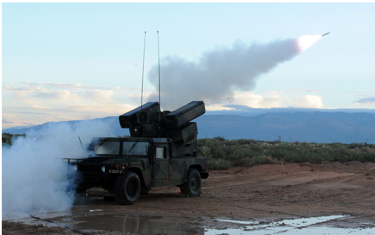
Avenger Air Defense System.

The first actionable step that can be taken immediately is to upgrade the static nature of NATO's tripwire forces with "Mobile Tripwires." As the organizing problem with tripwires ( i.e. , forward deployments under Operation Atlantic Resolve North-East) is that Russia can avoid them, NATO should deny opposing planners this luxury. To this end, U.S. Army Europe Avengers could offer one meaningful solution. These offer a highly mobile short-range air defense capability. By ensuring that one battery of this battalion (at a minimum) is always permanently forward deployed in the Baltic States, U.S. Army Europe can not only provide a short-range air defense capability in the Baltics—a high value to allies—but the inherent mobility of this capability means that it can be constantly repositioned—anywhere that Indicators and Warnings (IW) of a threat might emerge. And because this mobile