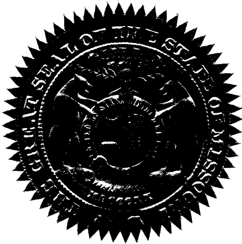
MICHAEL L. PARSON GOVERNOR

IN WITNESS WHEREOF, I have hereunto set my hand and caused to be affixed the Great Seal of the State of Missouri, in the City of Jefferson, on this 10 th day of August, 2021.