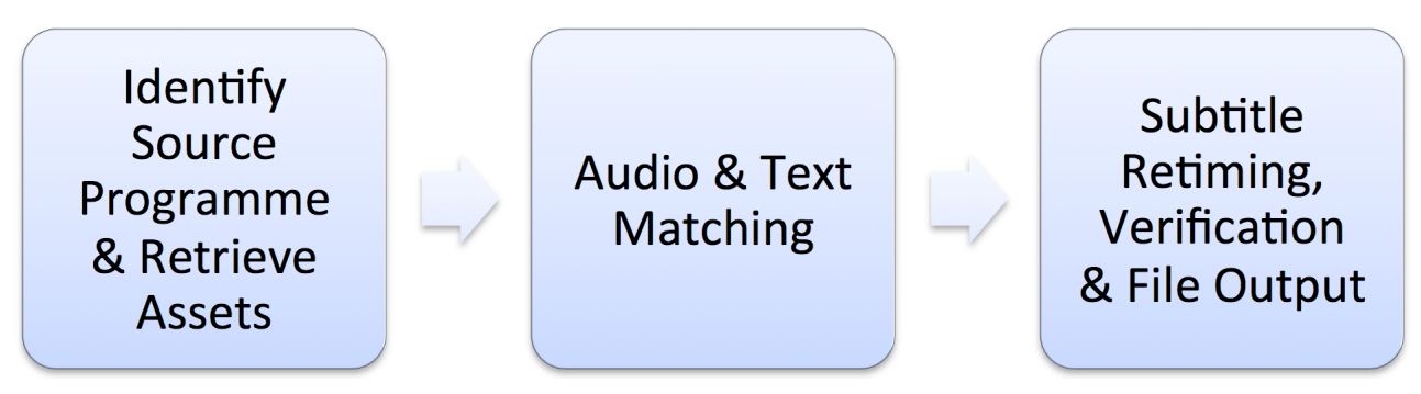
Figure 1 Subtitle Recovery Process Outline

The task breaks down into three basic components, identifying the programme (or several versions of the programme) from which the content could have been derived, locating the section of the programme from which the clip was lifted and verifying that the subtitles are a good match to the speech across the length of the clip. In order to increase the chance of the system being able to run without any human intervention it was agreed that we would initially limit the scope of the work to 'straight lift' clips where no editing had taken place after the clip had been taken from the original programme.