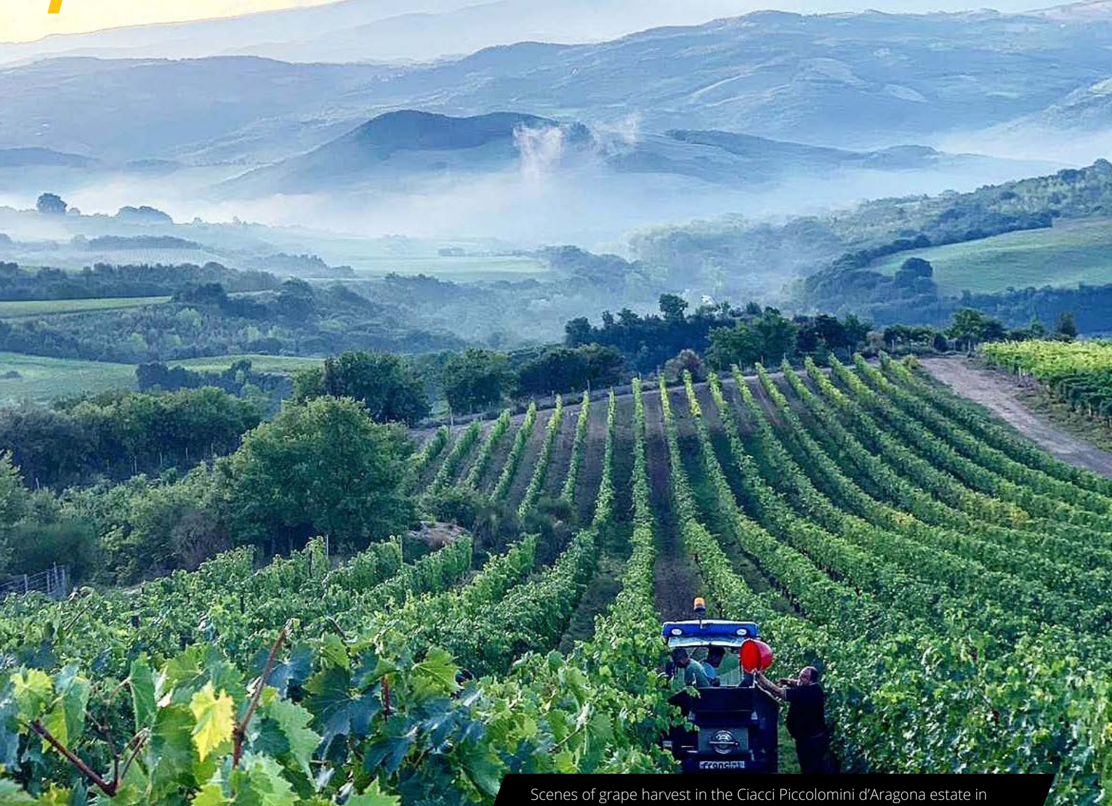
Scenes of grape harvest in the Ciacci Piccolomini d'Aragona estate in Castelnuovo dell'Abate, Italy.