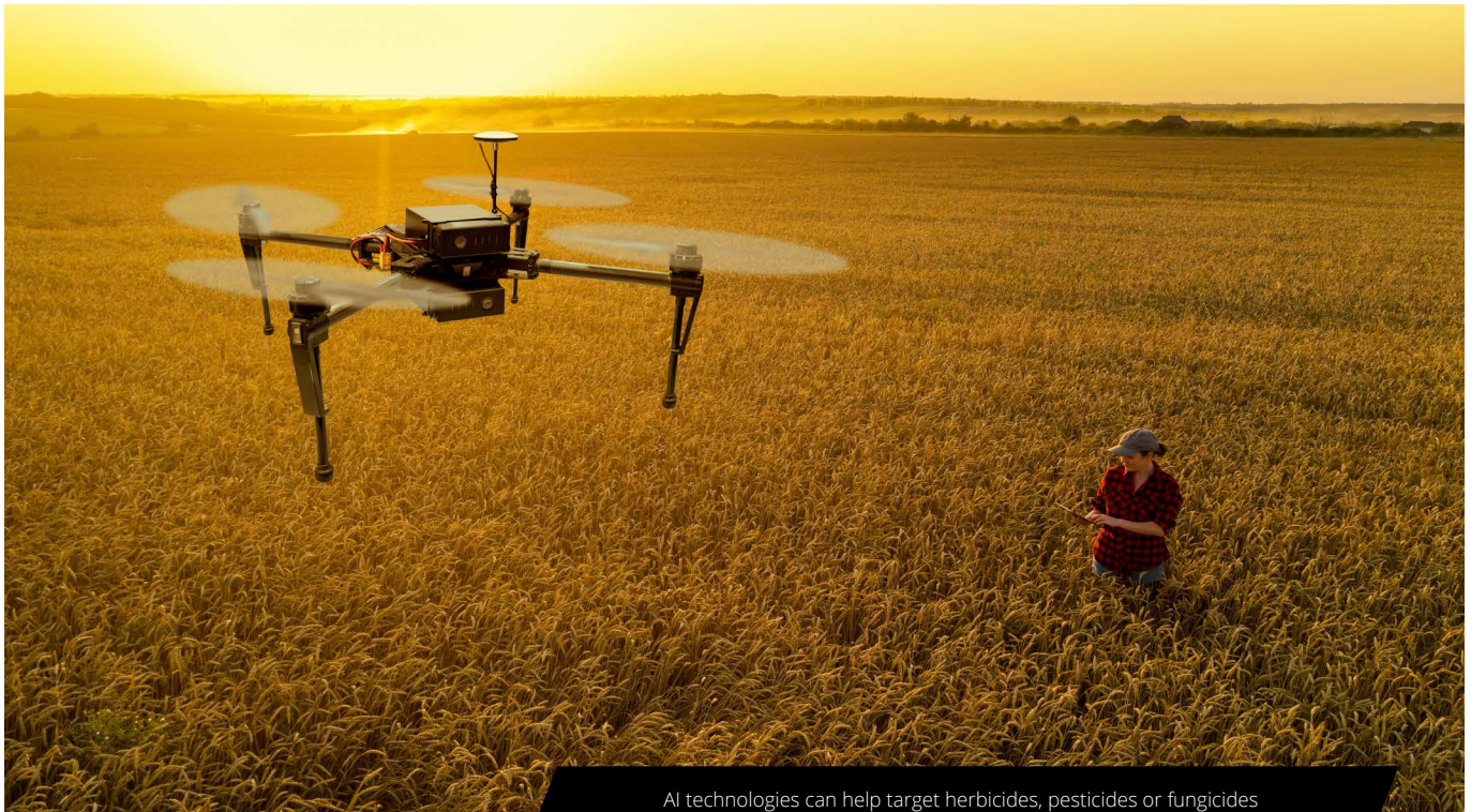
AI technologies can help target herbicides, pesticides or fungicides