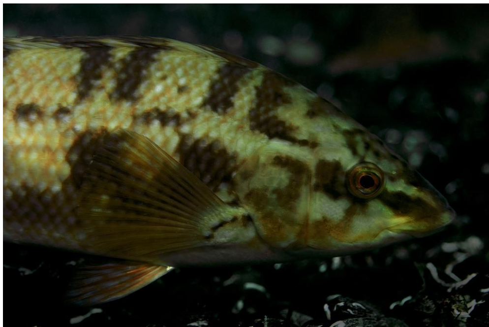
[Figure 6. A Ballan Wrasse, a common cleaner fish species. ]

Wrasse have been taken in such unsustainable numbers from their habitat that wild populations are becoming depleted. 59 New aquaculture operations are being developed in order to farm supply cleaner fish to be supplied to salmon farms. These farms will have to overcome its own unique set of welfare challenges, which are idiosyncratic to the biology of the cleaner fish. Wrasse are undomesticated carnivorous finfish, so they will share many of the same unsuitability as salmon in captivity. 60 There is an obvious logical question about the ethics of farming fish in order to alleviate the suffering of other farmed fish.