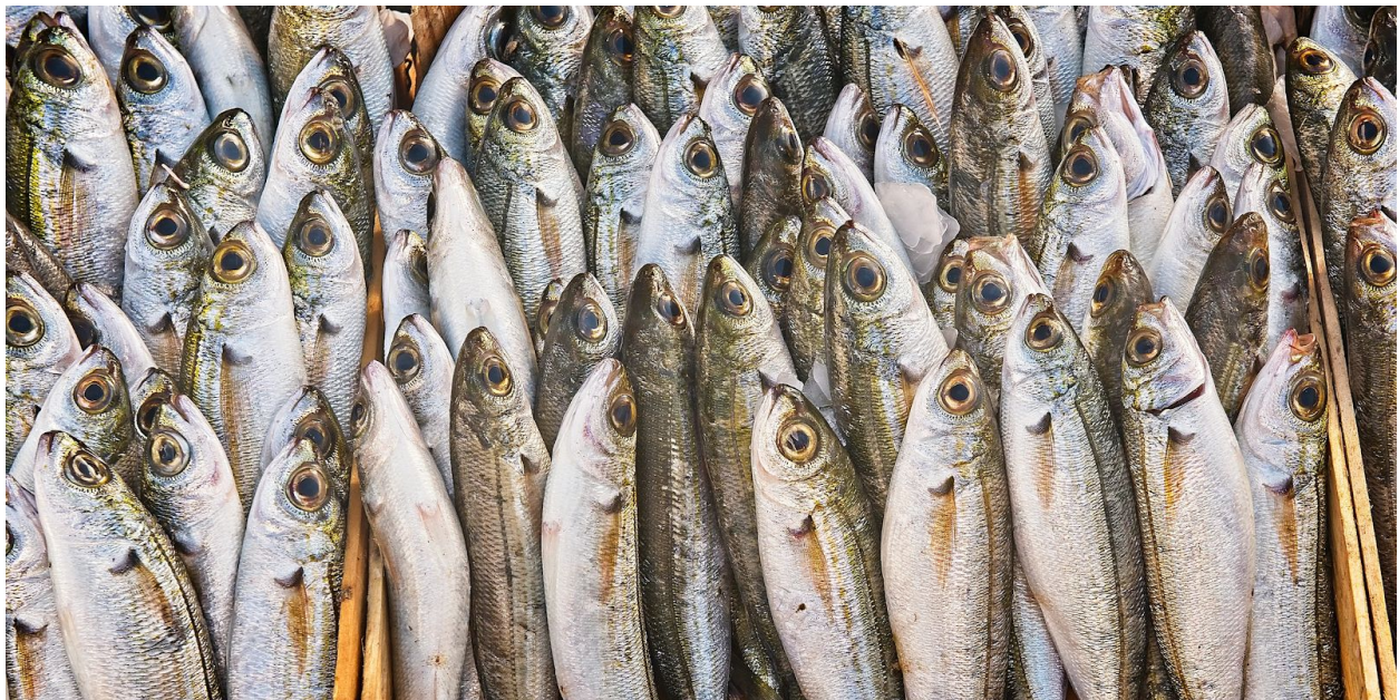
[Figure 10. Atlantic Herring, one of many wild fish caught to be fed to Salmon. \frac{1}{3} of all fish caught are used as animal feed. ]

Salmon, as apex carnivores, sit on top of a welfare pyramid. The production of each salmon requires the sourcing of meat for its diet. The qualitative experience of the animals salmon are fed ought to be considered, especially if this fish comes to be produced through supplementary aquaculture.