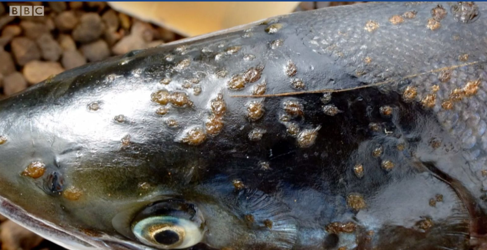
[Figure 1. A farmed Salmon which is infested with Sea Lice.]