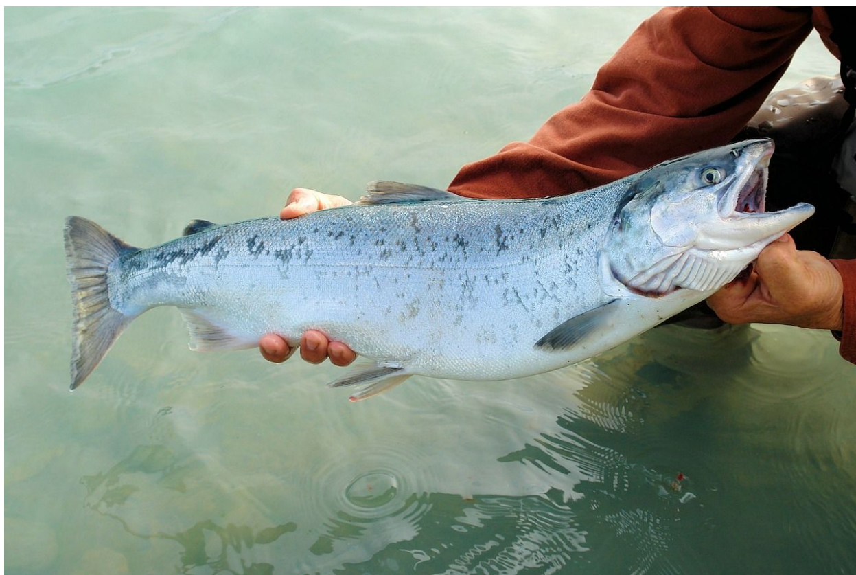
[Figure 12. An ocean-phase sockeye salmon, at approximately commercial harvest weight. ]

While promising, RAS systems do nothing to address the concerns listed in this article re: slaughter, preferred behaviors, or other animals in the food pyramid. It will also introduce new risks, and sufficient care must be taken to make sure that the salmon in inland systems have their welfare requirements understood.