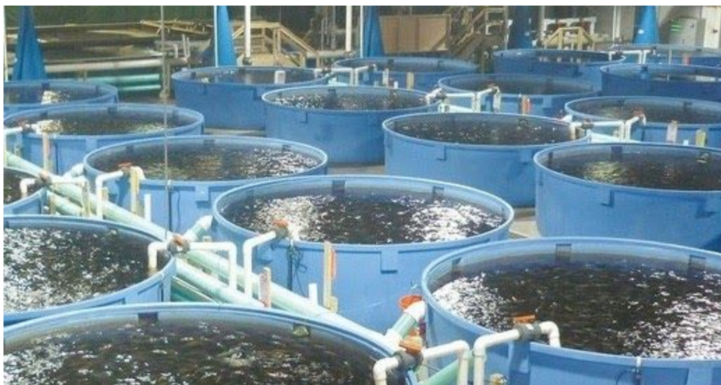
[Figure 3. A recirculating aquaculture system, of the type used to mature juvenile salmon ]

Fish find handling stressful, especially when it involves removal from the water. 17 The Humane Slaughter Association recommends the application of anaesthetic for removals of more than 15 seconds. 18 As a result, juvenile salmon are usually graded no more than four times, meaning their size groupings are imprecise.