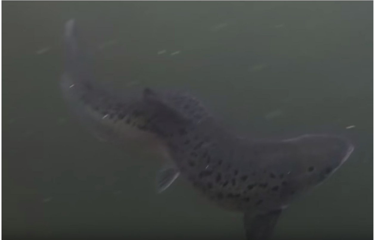
[Figure 9. A farmed salmon with spinal deformities. ]

salmon roe, producing populations of all-female and triploid salmon populations. Female fish are preferred by farmers, as they mature later than males, allowing them to grow larger without decline in meat quality. As a result most aquaculture shoals are all-female. Triploid salmon contain an extra chromosome, and as such are infertile. While they are less destructive to the genetics of wild salmon if they escape, these fish are more likely to develop health problems. Spinal deformities are common in triploid salmon, and though this can be reduced with the application of mineral supplements in the feed, undercover investigations in salmon farms regularly return pictures of deformed salmon. 63