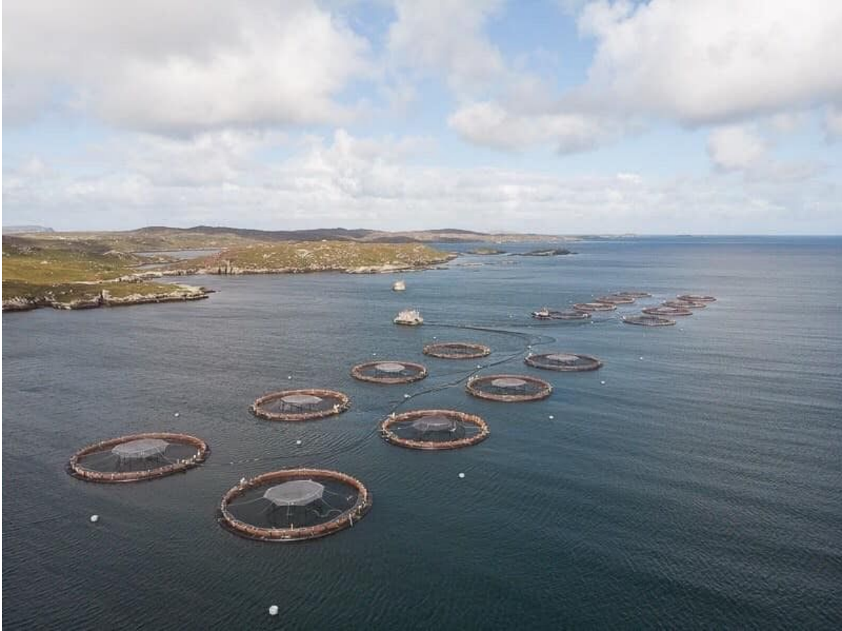
[Figure 2. A 16-net open-net farm, home to around 3 million salmon.]