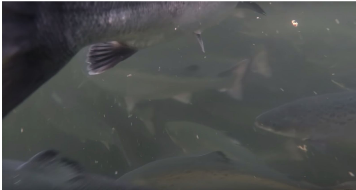
[Figure 4. Stocking density in the upper layer of a sea cage in Norway. ]

High stocking densities are associated with decreased growth, diminished nutritional uptake, reduction in food conversion efficiency, fin erosion, gill damage, immunosuppression, and inter-fish aggression. 30 One 2005 study suggests that these symptoms begin to appear when salmon are stocked above 22kg/m 3 . 31 Nota bene that the current EU restrictions exceed this, allowing fish to be stocked up to 25kg/m 3 . 32 EU organic regulations, which aim for high welfare but are followed by a minority of salmon farmers, set salmon stocking density at 10kg/m 3 . 33 This more cautious stocking density is calculated in recognition that fish welfare exists in a complex web of situational factors, and other conditions (e.g. a slow tide reducing refresh rate of water in the cage) can impact the oxygen availability for individual fish.