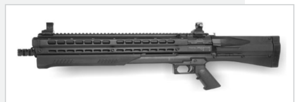
UTAS UTS-15 pump action tactical shotgun.