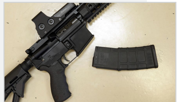
Semi-Automatic rifle and large capacity magazine.