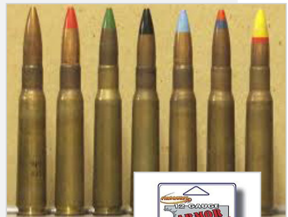
Armor-Piercing Ammunition.

Since 1986, ATF no longer requires ammunition sellers to maintain records of sales even though it is a federal crime for prohibited persons to purchase any ammunition.