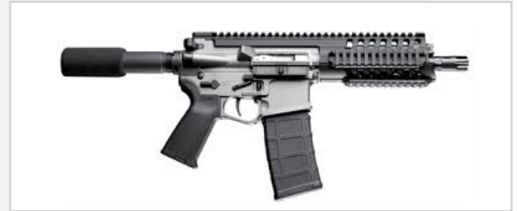
AR Style Pistols.