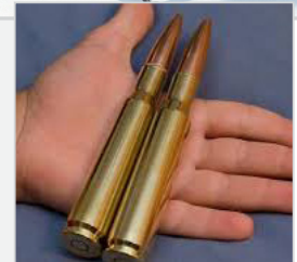
Right: .50 Caliber Ammunition.