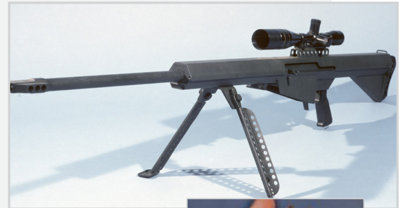
Above: .50 Caliber Rifle.

The NFA requires the registration of “destructive devices,” generally including any firearm of more than .50 caliber. The semi-automatic .50 caliber rifle is therefore the largest caliber firearm that does not fall under the NFA. The sniper rifle is deadly at distances of a mile or more and considered a national security threat due to its ability to shoot down a helicopter. Designed for use in military situations and utilized by military units across the world, these weapons can penetrate structures and destroy or disable light armored vehicles, radar dishes, stationary and taxiing airplanes, and other high-value military targets. In the hands of terrorists or other dangerous individuals, .50 caliber rifles could easily cause a mass casualty incident. The gun industry actively markets these weapons, which are legal in every state but California.