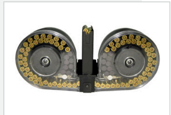
100-round Drum Magazine.