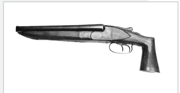
Ithaca Auto & Burglar Gun, classified as AOW by ATF.