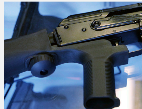
A “bump stock” is attached to a semi-automatic rifle at the Gun Vault store and shooting range in South Jordan, Utah.

Shortly after the Las Vegas attack, bipartisan legislation was introduced in Congress to address the threat posed by the bump stock and similar devices. After President Trump claimed that he would solve the problem of bump stocks by directing the Bureau of Alcohol, Tobacco, Firearms & Explosives (ATF) to ban them, the legislation in Congress stalled. As of the publication of this report, it has been one year since the massacre in Las Vegas and bump stocks remain legally available and un-regulated. The ATF regulation has still not been finalized and the bipartisan legislation in Congress has not advanced beyond introduction. In contrast, ten state legislatures have responded effectively to this threat, enacting new bans on bump stocks.*