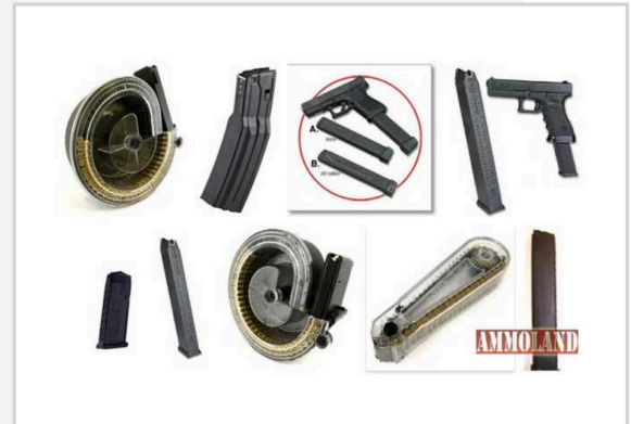
Collection of large capacity magazines.

The danger posed by firearms that enable shooters to continue firing in this manner is the same reason Congress chose to include machine guns in the NFA when it was originally enacted: these weapons enable a shooter to fire many bullets very quickly. Semi-automatic firearms equipped with large capacity magazines do not, however, fall under the NFA. The NFA refers to machine guns as those firearms that discharge more than one shot “without manual reloading, by a single function of the trigger.” Firearms developed since the NFA and equipped with large capacity magazines rarely require manual reloading, but they can expel a lot of ammunition in a brief period of time. They do so by allowing a trigger to be pulled many times very easily and ensuring that there is almost always another bullet ready to go. Despite this, large capacity magazines and semiautomatic firearms equipped with them (sometimes called “assault weapons”) are not regulated under the NFA, even though they pose incredible danger to our communities.