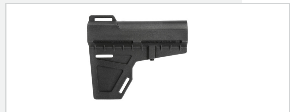
Top: AR Pistol Arm Brace. Bottom: AR Pistol Blade Stabilizer.