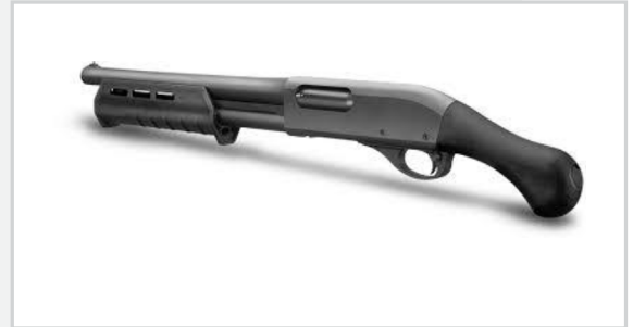
Remington Model 870 Tac-14.

The Remington Model 870 Tac-14 is a similar gun. It has a 14-inch barrel and 26.3-inch overall length and fires shotgun shells. Pew Pew Tactical, a popular gun enthusiast blogger, confirms Remington’s strategy to aid and abet people who want to work around the NFA.