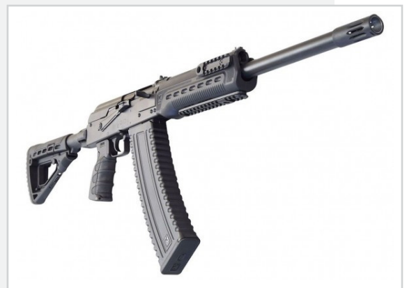
Kalashnikov KS-12T 12 gauge semi-automatic shotgun.