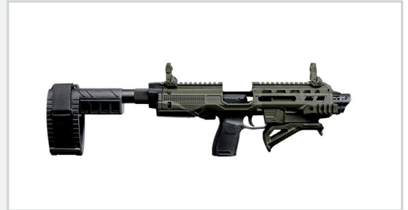
Kidon Pistol Conversion.

Sellers of the kits are not regulated by ATF, since the kits themselves do not fall within the definition of a firearm. They are, however, marketed with videos that tout the lethality of these weapons and demonstrate how to evade the law. These videos also often caution watchers to be careful not to get run afoul of the ATF by improperly using these kits.