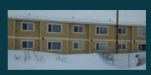
Nome Senior Apartments, an 18-unit elder housing facility, owned and managed by BSRHA.

The Housing Authority of the Sac and Fox Nation, located in rural Oklahoma, assisted nearly 1,100 native and non-native households with rent and utility support with its ERA1 award. With pandemic-related moratoriums and utility shutoffs for water and electricity expiring, the TDHE prioritized getting qualified citizens caught up with overdue heat, electricity, and water bills.