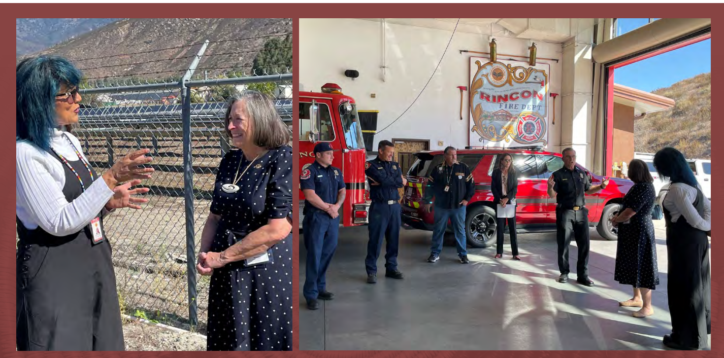
Rincon Band of Luiseño Tribal leader and the fire chief discussing land management practices, including wildland fire safety and risk mitigation, water management, and sustainable energy projects that the Tribe has done to keep citizens on the reservation safe. A previous fire had left some Tribal citizens without homes, which created many challenges.

Although efficient land management and the need to improve housing inventory will require longer-term reforms, Tribal governments are pooling their award funding from ORP programs with a focus on housing stability and using it in conjunction with other funding sources to respond to housing needs and supply.