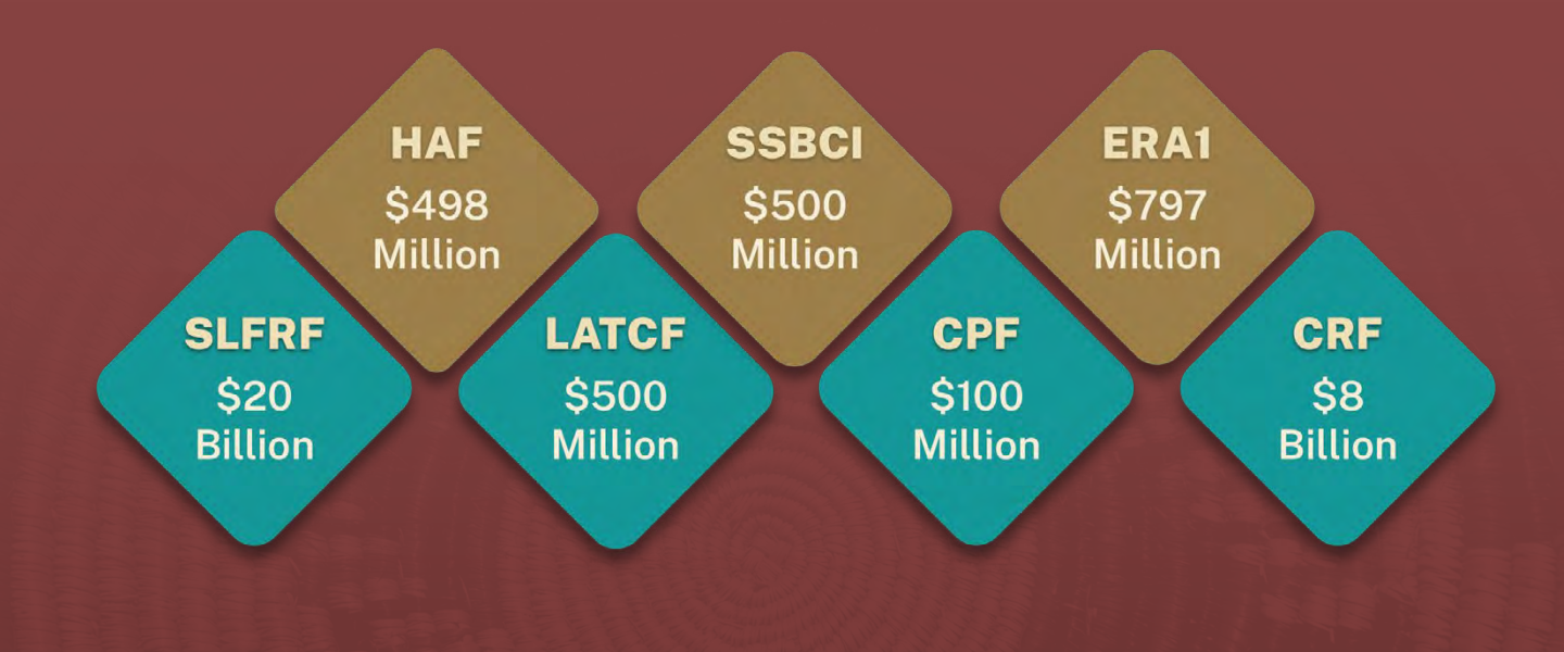
TABLE 1 Summary of Tribal Grantee Recovery Funding Data

funding is administered by the Office of Recovery Programs (ORP) within Treasury. ARPA authorized five critical Tribal recovery programs: Coronavirus State and Local Fiscal Recovery Funds (SLFRF), Homeowner Assistance Fund (HAF), Local Assistance and Tribal Consistency Fund (LATCF), State Small Business Credit Initiative (SSBCI), and Capital Projects Fund (CPF). ORP oversees two additional recovery programs for Tribes – Emergency Rental Assistance (ERA1)¹ and the Coronavirus Relief Fund (CRF)² that were authorized by legislation enacted before ARPA and implemented by the Biden-Harris Administration. These programs are intended to assist Tribal governments, their communities, Tribal citizen-owned businesses, and households with accessing relief.