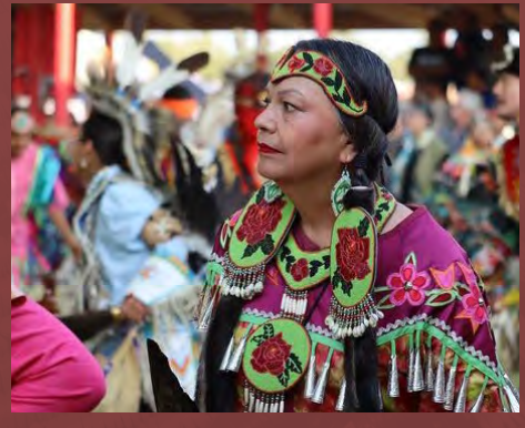
Unlike state and local governments, Tribes have the additional responsibility of restoring language, preserving culture and traditions and safeguarding sacred sites.

in states<sup>5</sup> that do not have a sales tax, which makes instituting Tribal sales tax an unreliable revenue strategy. As a result, Tribes rely on for-profit business revenue in place of a solid tax base. Over 30 percent of Tribal businesses reported laying off or furloughing 80 to 100 percent of their workforce at the beginning of the pandemic.<sup>6</sup> The financial viability of some of these businesses was threatened, especially for those businesses that were already operating on small profits because of their intent<sup>7</sup> to provide governmental services and create jobs for the community.