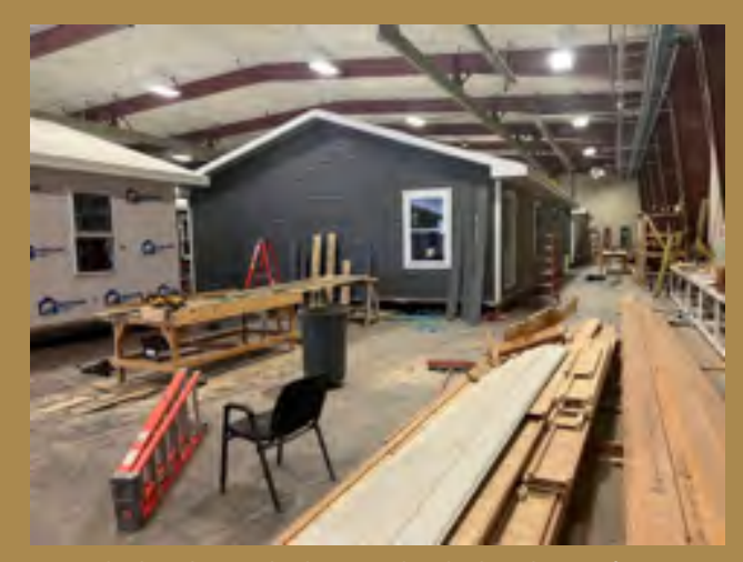
Home built in the Rosebud Sioux Tribe's high-tech manufacturing plant.