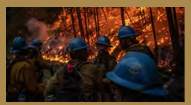
Firefighters from the Carson Hotshots in the Klamath national forest.

Consistent with the SLFRF program's flexibility, Tribes are using these fiscal recovery dollars for a wide variety of housing activities to address the unique access to capital and land challenges in ways that best serve their communities.