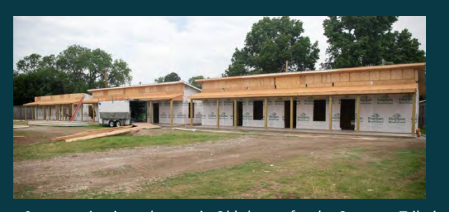
Construction is underway in Oklahoma for the Quapaw Tribe's Tiny Homes Village.

The Quapaw Tribe is building tiny homes for victims of domestic violence with its SLFRF award funds. Domestic violence, a leading cause of homelessness among women and children, increased during the pandemic. These temporary housing options aim to reduce the incidence of domestic violence by supporting victims with a safe space to live and address housing instability. The Tribe will partner with social services to provide culturally relevant healing and recovery services.