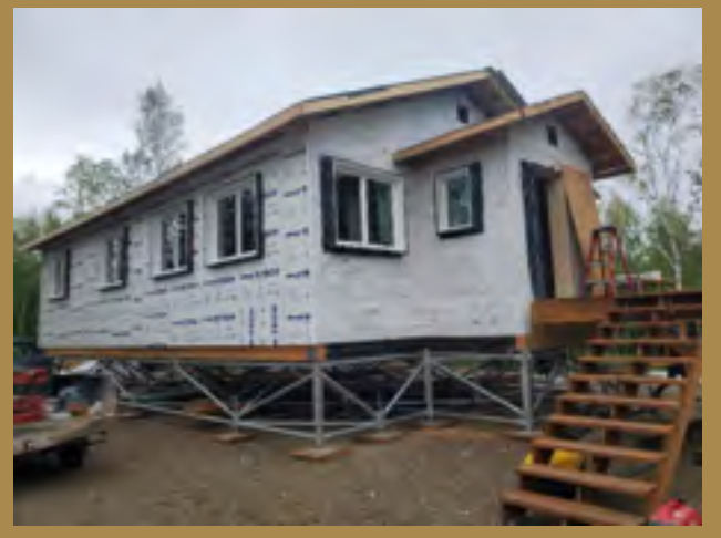
Home built with SLFRF at the Louden Tribal Council (Galena Village).

The Louden Tribal Council (Galena Village) endured a devastating ice jam on the Yukon River in 2013, which caused waters to surge more than 15 feet overnight. An ice jam happens when chunks of ice clump together to block the flow of a river. The disaster destroyed many homes and structures, leaving some community members homeless. The Tribe is nearly 300 miles from the closest road, and the remoteness makes purchasing building supplies unfeasible. Funding from its SLFRF award will build new homes, and its HAF award will be used to rehabilitate homes in need of repairs. The construction is creating jobs and training opportunities for citizens.