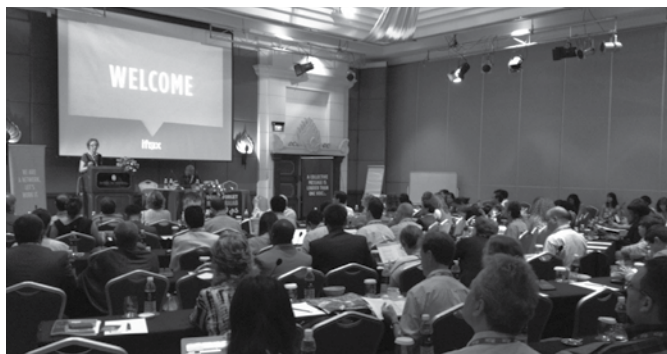
Participants at the 17th IFEX General Meeting and Strategy Conference Participants at the 17th IFEX General Meeting and Strategy Conference