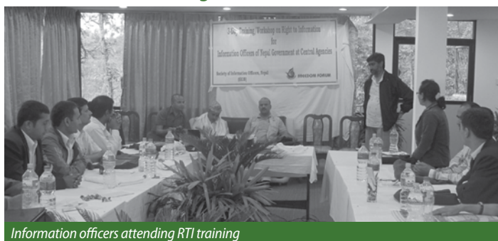
Information officers attending RTI training

A total of 54 information officers at central level of government agencies were provided training on RTI, focusing how they could help create atmosphere for better practice of the RTI with clear understanding of the subject matter. The 3-day training was conducted in two lots- first from April 3 to April 5, 2013 while the second from 7 to 9, 2013.