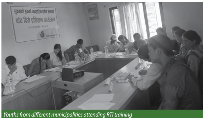
Youths from different municipalities attending RTI training

In the practical session of training, the trainers were sent to various public agencies (government offices) in the Kathmandu Valley to file information applications. Similarly, they were taken to the National Information Commission to garner knowledge how it was functioning in the RTI sector and how it could help the RTI campaigners across the country.