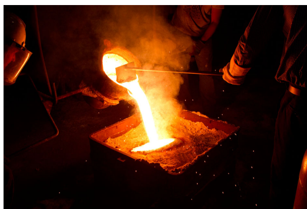
Figure 2. Katie Paterson, Campo del Cielo, Field of the Sky , 2012. Commissioned by the Royal Borough of Kensington and Chelsea, London.

was taken of a meteorite, which was subsequently melted down, recast in its mold (Figure 2), and returned to space by the European Space Agency. Paterson's 2015 editioned work Candle (from Earth into a Black Hole) (Figure 3) consists of a white taper candle, scented in layers so that as the candle is lit and burned slowly over the course of a day various scents are emitted, layer by layer, each corresponding conceptually to the Earth, moon, planets of our solar system and beyond. In each of these and many other artworks, Paterson explores sublime temporalities and expanses, gazes into the deep time of Earth and the Universe's history, distances or quantities approaching infinity on a macro or micro scale, and natural processes that are otherwise beyond human comprehension.