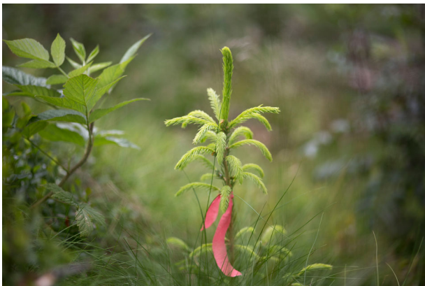
Figure 6. One of the Future Library saplings in Nordmarka.

Since then, four more Handover Ceremonies following a similar format have taken place. In 2016 English novelist David Mitchell presented his manuscript titled “ From Me Flows What You Call Time ,” in 2017, Icelandic author Sjón handed over his manuscript “ As My Brow Brushes On The Tunics Of Angels or The Drop Tower, the Roller Coaster, the Whirling Cups and other Instruments of Worship from the Post-Industrial Age ,” in 2018, Turkish novelist Elif Shafak presented her manuscript titled “ The Last Taboo ” (Figure 8); and in June of 2019, South Korean writer Han Kang handed