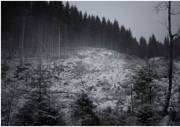
Figure 4. Cleared site of the Future Library forest.