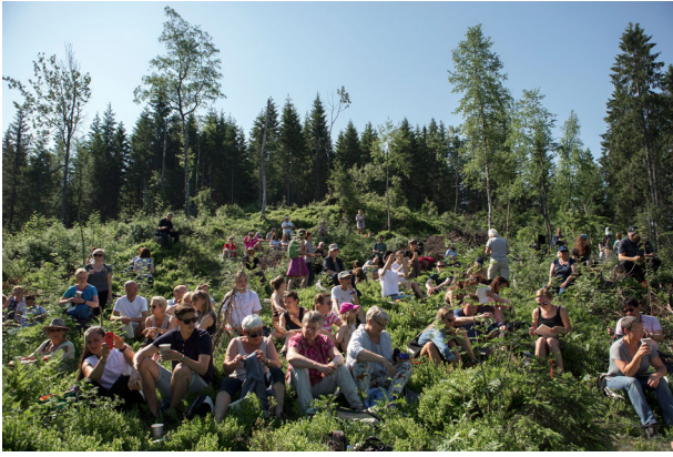
Figure 8. Attendees of the Handover Ceremony in 2018 gathered amongst the Future Library saplings. Photo © Björvika Utvikling by Kristin von Hirsch.

the visiting public. For the last five years, architects from Atelier Oslo and Lund Hagem have been designing and constructing this space in consultation with Paterson and the rest of the Trust and it is set to open to the public in 2022. The undulating walls and ceiling of this darkened space will be completely lined with strips of wood from the trees felled in 2014, punctuated by one hundred glass-fronted drawers, one for each of the hundred manuscripts.