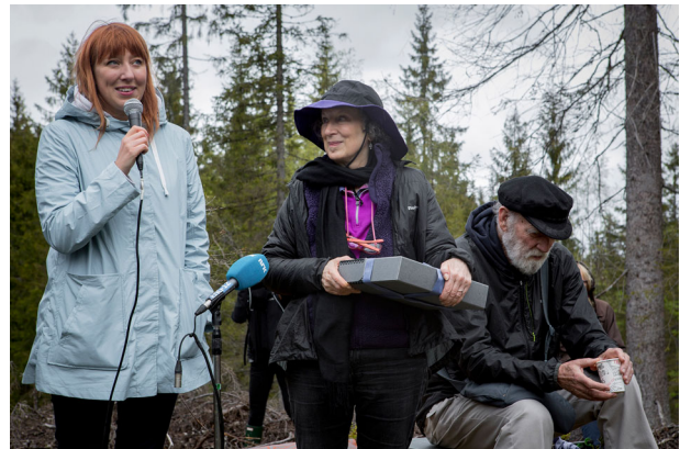
Figure 7. Katie Paterson (left) with author Margaret Atwood (center) and her sealed manuscript Scribbler Moon at the inaugural Future Library Handover Ceremony in 2015.

Since then, four more Handover Ceremonies following a similar format have taken place. In 2016 English novelist David Mitchell presented his manuscript titled “ From Me Flows What You Call Time ,” in 2017, Icelandic author Sjón handed over his manuscript “ As My Brow Brushes On The Tunics Of Angels or The Drop Tower, the Roller Coaster, the Whirling Cups and other Instruments of Worship from the Post-Industrial Age ,” in 2018, Turkish novelist Elif Shafak presented her manuscript titled “ The Last Taboo ” (Figure 8); and in June of 2019, South Korean writer Han Kang handed