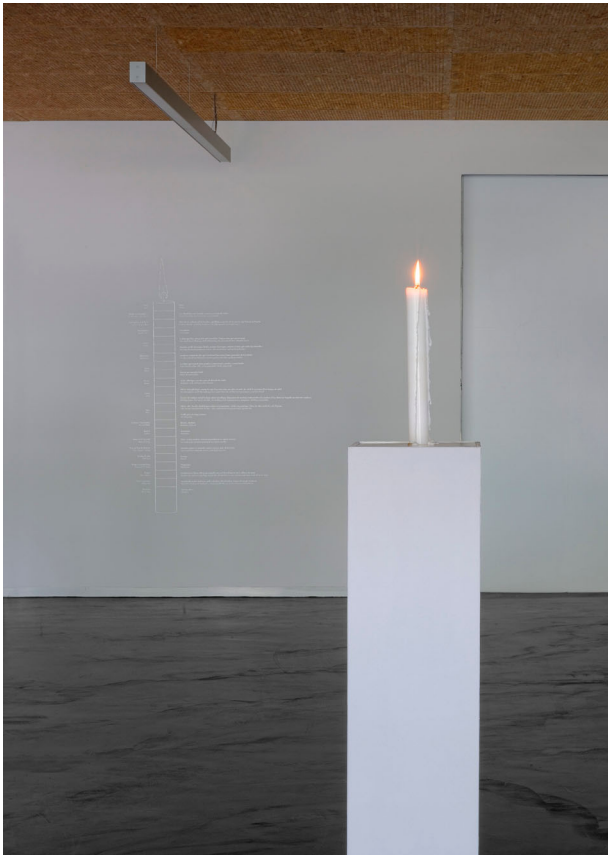
Figure 3. Katie Paterson, Candle (from Earth into a Black Hole) , 2015. Exhibition view Frac Franche-Comté.

sand the artist carved, or the entire process of the work's creation, including the gesture of its reburial in the Sahara Desert? Is Campo del Cielo , Field of the Sky the physical object that is the recast meteorite, or the performance of its selection, casting, and launch back into space? Is a manifestation of Candle the physical object of any one of the editioned candles, or the event of burning one and participating in its olfactory journey through the solar system?