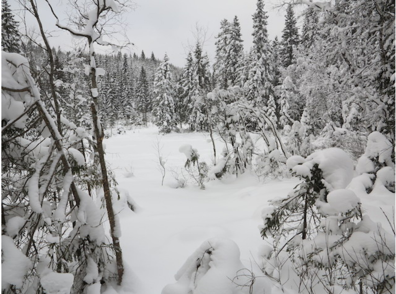
The site of artist Katie Paterson's Future Library in Norway.

If a book is just pulp, then a library is just a forest.