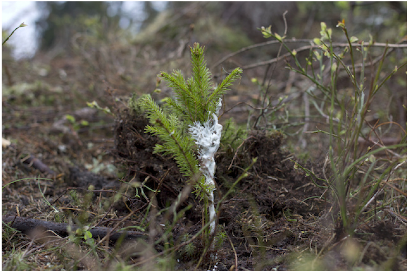
A Future Library sapling

Yes. And, I have to admit, I lived in Iceland for a while and did start to believe in fairies. Well, actually, I got lost in a rock forest—it looked like a forest made of rocks—and I suddenly realized why all these myths and sagas have come out of Scandinavia. These places do feel eerily magical; you can completely believe that there are other imaginary creatures around you.